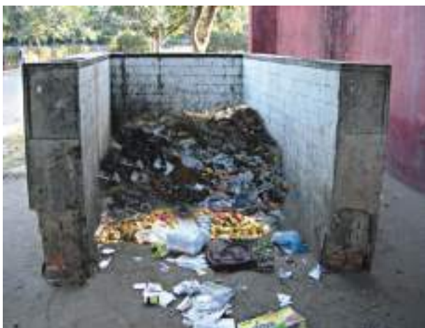
Fig. 16.7 Neighbourhood garbage dump

a few days. In how many days does the bucket become full? You know the number of members in your family. If you find out the population of your city or town, can you now estimate the number of buckets of garbage that may be generated in a day in your city or town? We are generating mountains of garbage everyday, isn't it (Fig. 16.7)?