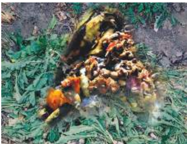
Fig. 16.5 Food for redworms

that may contain salt, pickles, oil, vinegar, meat and milk preparations as food for your redworms. If you put these things in the pit, disease-causing small organisms start growing in the pit. Once in a few days, gently mix and move the top layers of your pit.