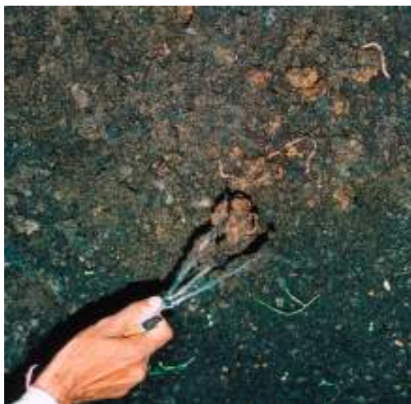
Fig. 16.6 Vermicomposting

Put some wastes as food in one corner of the pit. Most of the worms will shift