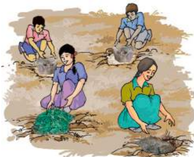
Fig. 16.2 Putting garbage heaps in pits

Now divide the contents of each group into two separate heaps. Label them