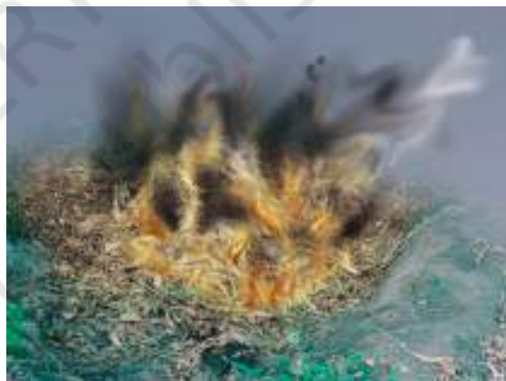
Fig. 16.3 Burning of leaves produce harmful gases

crop plants in their fields after harvesting. Burning of these, produces smoke and gases that are harmful to our health. We should try to stop such practices. These wastes could be converted into useful compost.