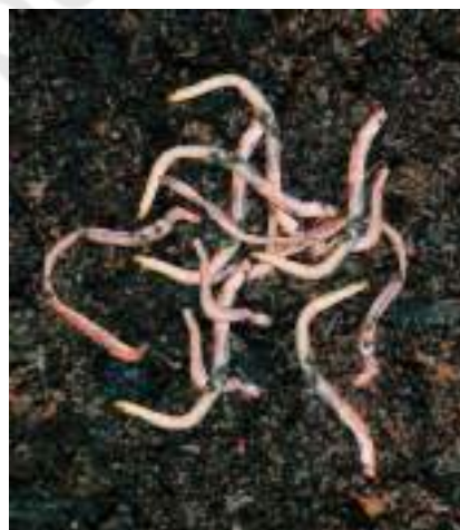
Fig. 16.4 Redworms

Now, your pit is ready to welcome the redworms. Buy some redworms and put them in your pit (Fig. 16.4). Cover them loosely with a gunny bag or an old sheet of cloth or a layer of grass.