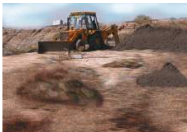
Fig. 16.1 A landfill

There the part of the garbage that can be reused is separated out from the one that cannot be used as such. Thus,