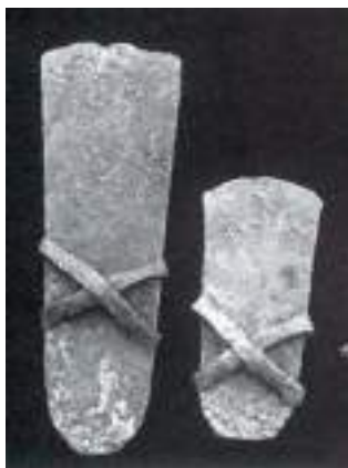
Left below : Axes.