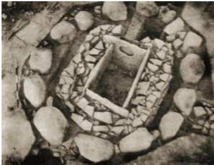
Top : This type of megalith is known as a cist. Some cists, like the one shown here, have port-holes which could be used as an entrance.

Some important megalithic sites are shown on Map 2 (page 13). While some megaliths can be seen on the surface, other megalithic burials are often underground.