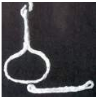
Iron equipment found from megalithic burials.