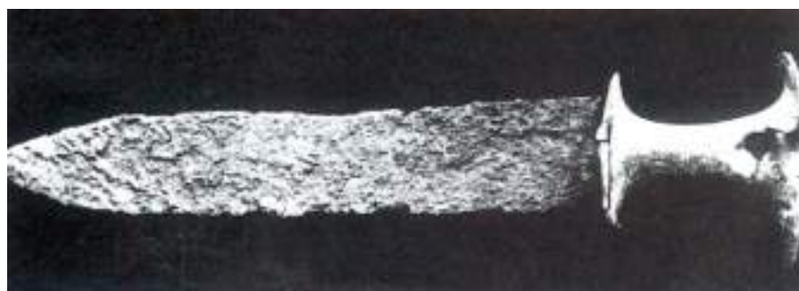
Below : A dagger.