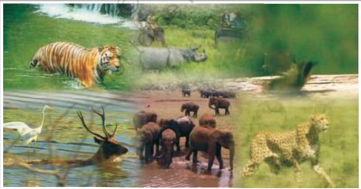
Figure 8.3 : Wildlife

In order to protect them many national parks, sanctuaries and biosphere reserves have been set up. The Government