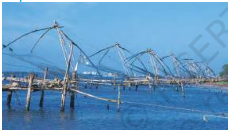
Chinese Fishing Nets

Even the utensil used for frying is called the cheenachatti , and it is believed that the word cheen could have come from China. The fertile land and climate are suited to growing rice and a majority of people here eat rice, fish and vegetables.