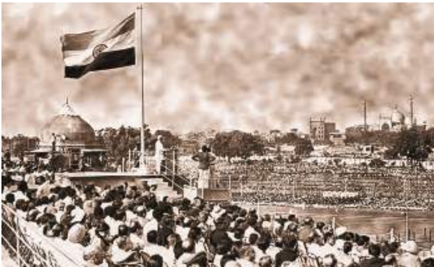
Pt. Nehru delivering an Independence Day speech

Songs and symbols that emerged during the freedom struggle serve as a constant reminder of our country's rich tradition of respect for diversity. Do you know the story of the Indian flag? It was used as a symbol of protest against the British by people everywhere.