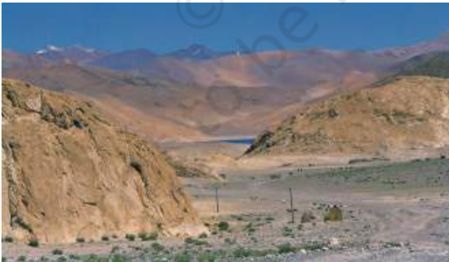
The dry barren landscape of the mountainous desert of Ladakh.

Ladakh is a desert in the mountains in the east of Jammu and Kashmir. Very little agriculture is possible here since this region does not receive any rain and is covered in snow for a large part of the year. There are very few trees that can grow in the region. For drinking water, people depend on the melting snow during the summer months.