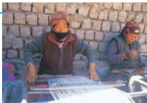
Woman weaving a pashmina shawl

Buddhism reached Tibet via Ladakh. Ladakh is also called Little Tibet. Islam was introduced in this region more than four hundred years ago and there is a significant Muslim population here. Ladakh has a very rich oral tradition of songs and poems. Local versions of the Tibetan national epic the Kesar Saga are performed and sung by both Muslims and Buddhists.