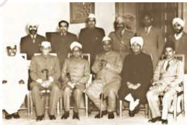
Some of the members who wrote the Constitution of India.

Therefore, India became a secular country where people of different religions and faiths have