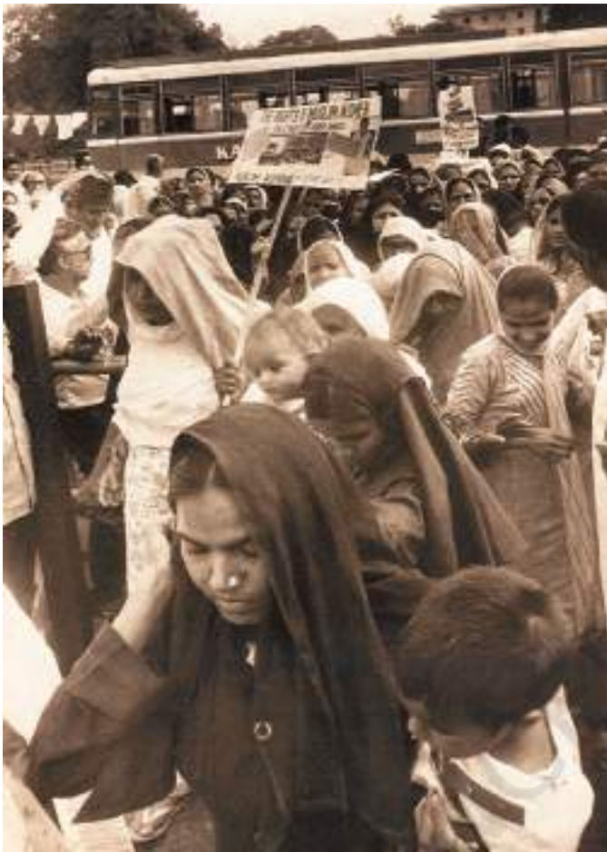
Women at a rally demanding their rights

discrimination had been practised in our society and how people had struggled against this. Many leaders of these struggles such as Dr Ambedkar had also fought for the rights of the Dalits.