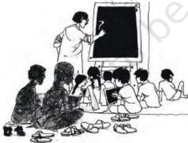
Being made to sit separately in the classroom because of one's background is a form of discrimination.

to take on work, other than what they were meant to do. For example, some groups were forced to pick garbage and remove dead animals from the village. But they were not allowed to enter the homes of the upper castes or take water from the village well, or even enter temples. Their children could not sit next to children of other castes in school. Thus upper castes