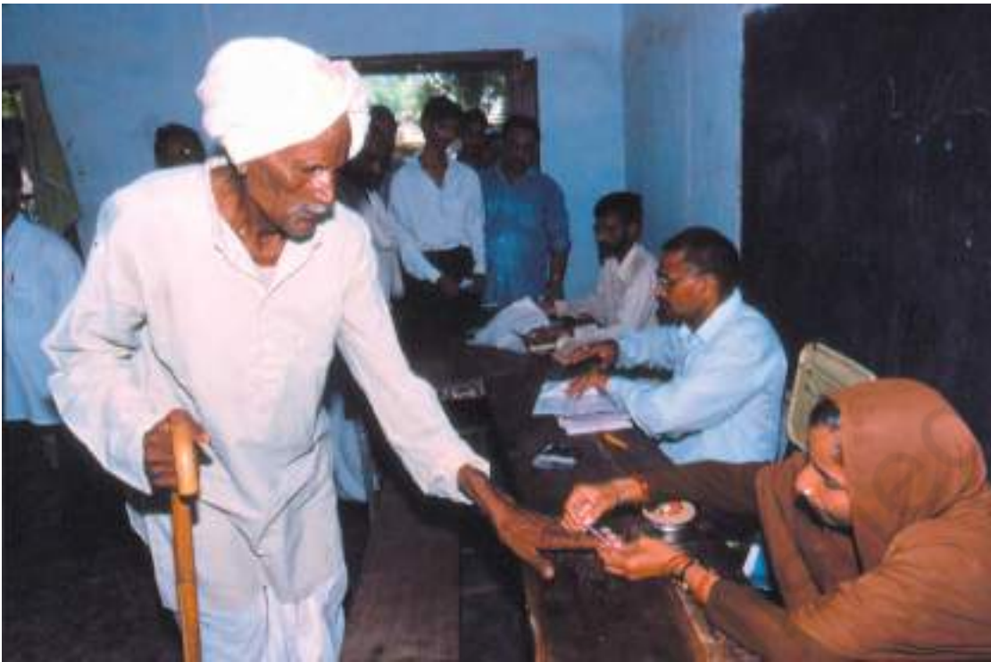
Voting in a rural area: A mark is put on the finger to make sure that a person casts only one vote.

decisions for the entire population. These days a government cannot call itself democratic unless it allows what is known as universal adult franchise. This means that all adults in the country are allowed to vote.