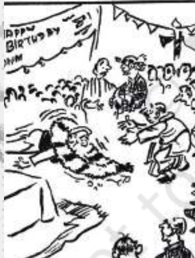
I told him to make the garland smaller... He is a frail old man and wouldn't be able to stand the weight of such a huge garland!