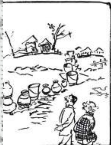
Not bad! One of the taps in the nearby village must be getting water!