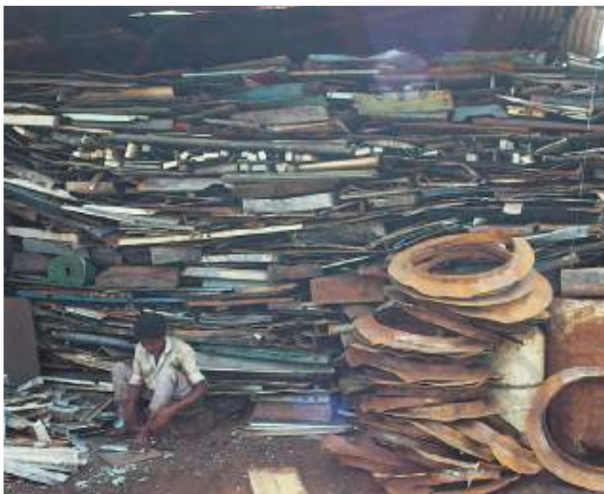
Recycling is not a new thing. People like the man in the photo above have been recycling paper, metal, glass and plastic for a long time. The kabadi wallah plays a major role in recycling household plastic and paper, including your note books.

Jehangir ate his kababs at top speed and as he wolfed them down he asked loudly from the kitchen, "Yasmin Khala where does the garbage that the Municipal Corporation collects go to?". The others were still eating when Yasmin Khala began to answer, "This question has an interesting answer. As you know you can usually find garbage lying all over the street. Earlier even our neighbourhood used to have garbage lying all over, and if this