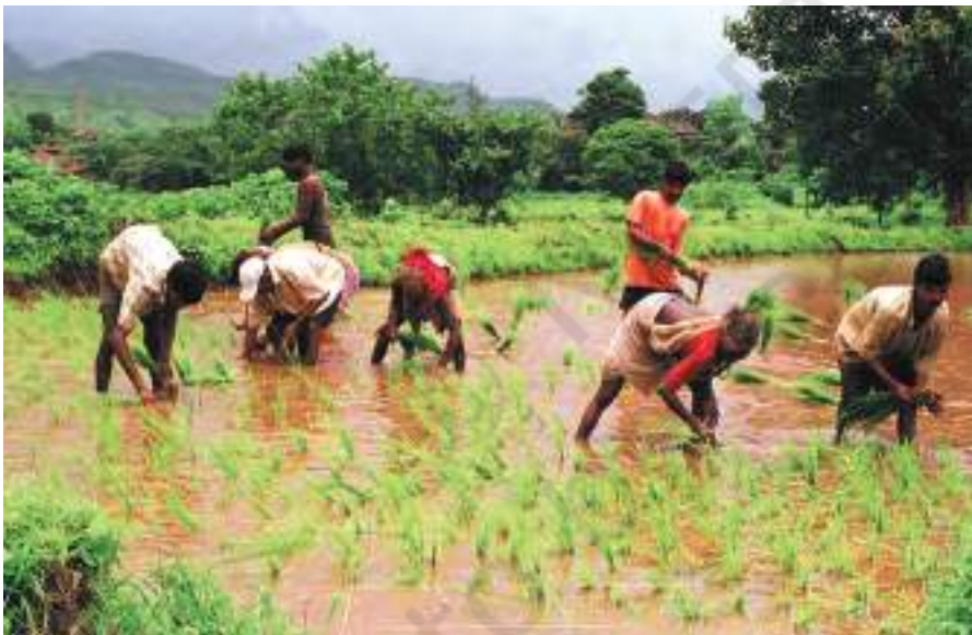
Transplanting paddy is back-breaking work.

The village is surrounded by low hills. Paddy is the main crop that is grown in irrigated lands. Most of the families earn a living through agriculture.