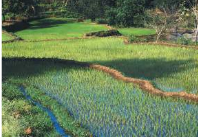
Transplanted paddy growing in a few of Ramalingam's 20 acres. A result of hard labour performed by agricultural workers like Thulasi.

This is when we can say they are caught in debt. In recent years this has become a major cause of distress among farmers. In some areas this has also resulted in many farmers committing suicide.