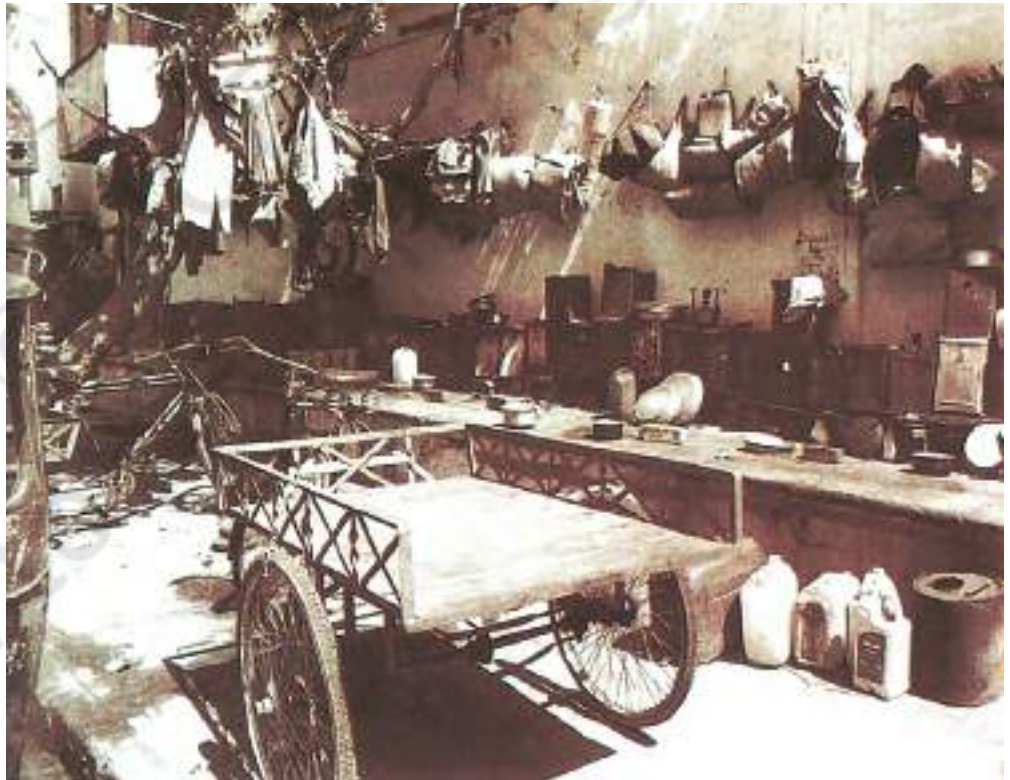
Often workers who make a living in the city are forced to set up their homes on the street as well. Below is a space where several workers leave their belongings during the day and cook their meals at night.

Vendors sell things that are often prepared at home by their families who purchase, clean, sort and make them ready to sell. For example, those who sell food or snacks on the street, prepare most of these at home.