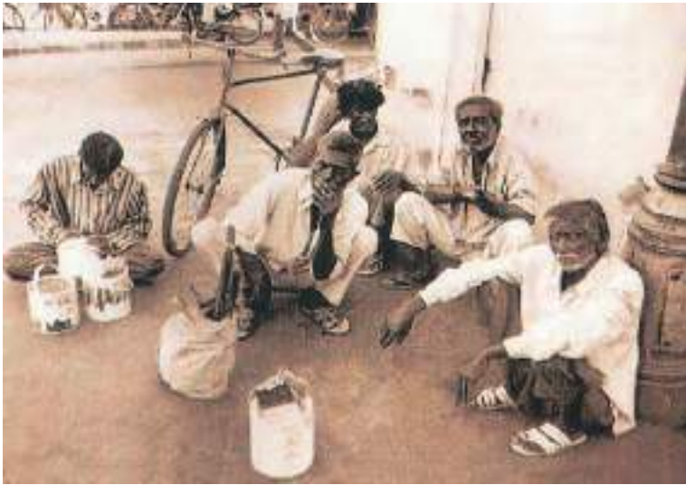
At labour chowk, daily wage workers wait with their tools for people to come and take them for work.

trucks in the market, dig pipelines and telephone cables and also build roads. There are thousands of such casual workers in the city.