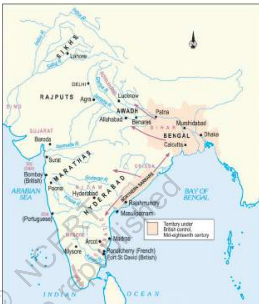
Map 2 British territories in the mid-eighteenth century.

In this chapter we will read about the emergence of new political groups in the subcontinent during the first half of the eighteenth century – roughly from 1707, when Aurangzeb died, till the third battle of Panipat in 1761.