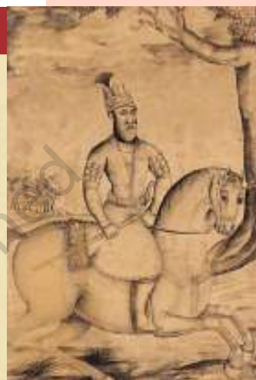
Fig. 1 A 1779 portrait of Nadir Shah.