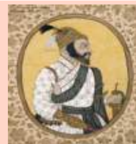
Fig. 7a Portrait of Shivaji

The Maratha kingdom was another powerful regional kingdom to arise out of a sustained opposition to Mughal rule. Shivaji (1627-1680) carved out a stable kingdom with the support of powerful warrior families ( deshmukhs ). Groups of highly mobile, peasant-pastoralists ( kunbis ) provided the backbone of the Maratha army. Shivaji used these forces to challenge the Mughals in the peninsula. After Shivaji’s death, effective power in the Maratha state was wielded by a family of Chitpavan Brahmanas who served Shivaji’s successors as Peshwa (or principal minister). Poona became the capital of the Maratha kingdom.