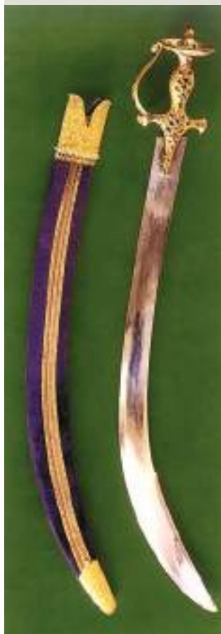
Fig. 7 Sword of Maharaja Ranjit Singh.

The organisation of the Sikhs into a political community during the seventeenth century (see Chapter 8) helped in regional state-building in the Punjab. Several battles were fought by Guru Gobind Singh against the Rajput and Mughal rulers, both before and after the institution of the Khalsa in 1699. After his death in 1708, the Khalsa rose in revolt against the Mughal authority under Banda Bahadur's leadership, declared their sovereign rule by striking coins in the name of Guru Nanak and Guru Gobind Singh, and established their own administration between the Sutlej and the Jamuna. Banda Bahadur was captured in 1715 and executed in 1716.