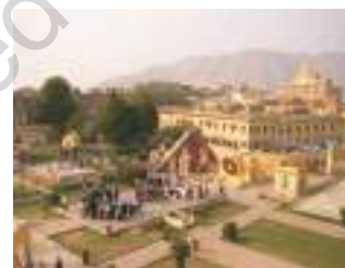
Fig. 4c Jantar Mantar in Jaipur

Raja Jai Singh was at the height of his power. He was the governor of Agra for 12 years and of Malwa for 5 or 6 years. He possessed a large army, artillery and great wealth. His sway extended from Delhi to the banks of the Narmada.