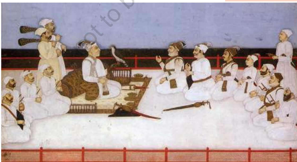
Fig. 4 Alivardi Khan holding court.

The formation of a regional state in eighteenth-century Bengal therefore led to considerable change amongst the zamindars. The close connection between the state and bankers – noticeable in