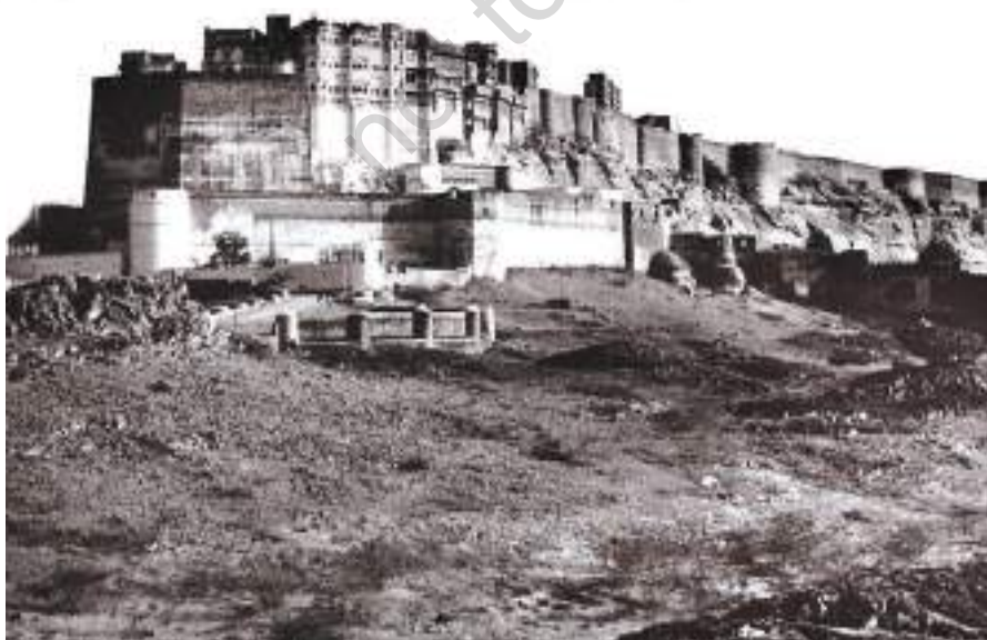
Fig. 5 Mehrangarh Fort, Jodhpur

Sawai Jai Singh, the ruler of Amber constructed five astronomical observatories, one each in Delhi, Jaipur, Ujjain, Mathura and Varanasi. Commonly known as Jantar Mantar, these observatories had various instruments to study heavenly bodies.