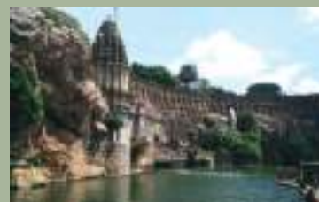
Fig. 4b. Chittorgarh Fort, Rajasthan

Many Rajput chieftains built a number of forts on hill tops which became centres of power. With extensive fortifications, these majestic structures housed urban centres, palaces, temples, trading centres, water harvesting structures and other buildings. The Chittorgarh fort contained many water bodies varying from talabs (ponds) to kundis (wells), baolis (stepwells), etc.