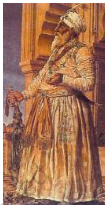
Fig. 3 Burhan-ul-Mulk Sa'adat Khan.

Burhan-ul-Mulk Sa'adat Khan was appointed subadar of Awadh in 1722 and founded a state which was one of the most important to emerge out of the break-up of the Mughal Empire. Awadh was a prosperous region, controlling the rich alluvial Ganga plain and the main trade route between north India and Bengal. Burhan-ul-Mulk also held the combined offices of subadari , diwani and faujdari . In other words, he was responsible for managing the political, financial and military affairs of the province of Awadh.