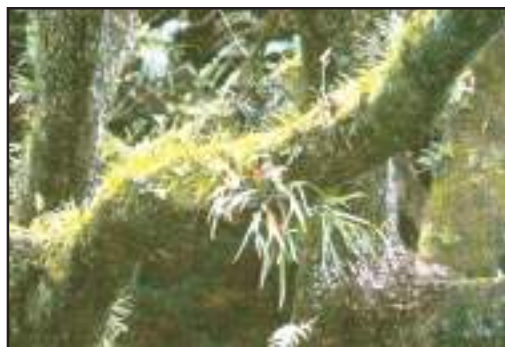
Fig. 8.3 : The Amazon Forest

As it rains heavily in this region, thick forests grow (Fig. 8.3). The forests are in fact so thick that the dense “roof” created by leaves and branches does not allow the sunlight to reach the ground. The ground remains dark and damp. Only shade tolerant vegetation may grow here. Orchids, bromeliads grow as plant parasites.