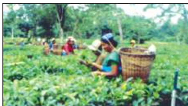
Fig. 8.10 : Tea Garden in Assam