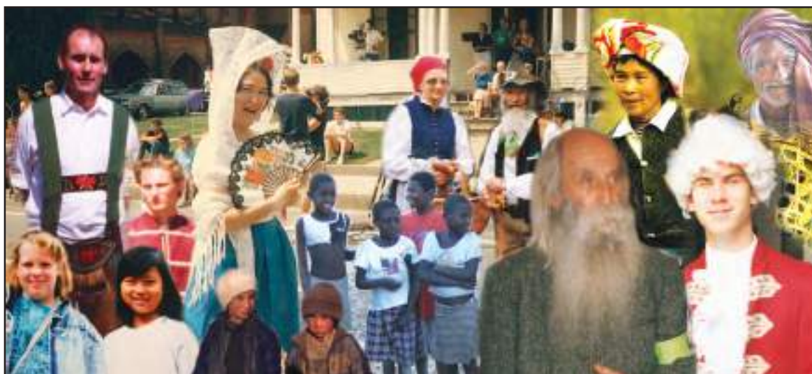
Fig. 8.1: People from various parts of the world