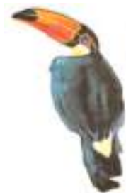
Fig. 8.4 : Toucans

The rainforest is rich in fauna. Birds such as toucans (Fig. 8.4), humming birds, bird of paradise with their brilliantly coloured plumage, oversized bills for eating make them different from birds we commonly see in India. These birds also make loud sounds in the forests. Animals like monkeys, sloth and ant-eating tapirs