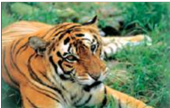
Fig. 8.14: Tiger in Manas Wildlife sanctuary

All the four ways of transport are well developed in the Ganga-Brahmaputra basin. In the plain areas the roadways and railways transport the people from one place to another. The waterways, is an effective means of transport particularly along the rivers. Kolkata is an important port on the River Hooghly. The plain area also has a large number of airports.