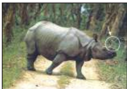
Fig. 8.11 : One horned rhinoceros

There is a variety of wildlife in the basin. Elephants, tigers, deer and monkeys are common. The one-horned rhinoceros is found in the Brahmaputra plain. In the delta area, Bengal tiger, crocodiles and alligator are found. Aquatic life abounds in the fresh river waters, the lakes and the Bay of Bengal Sea. The most popular varieties of the fish are the rohu, catla and hilsa. Fish and rice is the staple diet of the people living in the area.