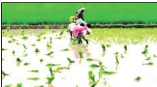
Fig. 8.9 : Paddy Cultivation

The vegetation cover of the area varies according to the type of landforms. In the Ganga and Brahmaputra plain tropical deciduous trees grow, along with teak, sal and peepal. Thick bamboo groves are common in the Brahmaputra plain. The delta area is covered with the