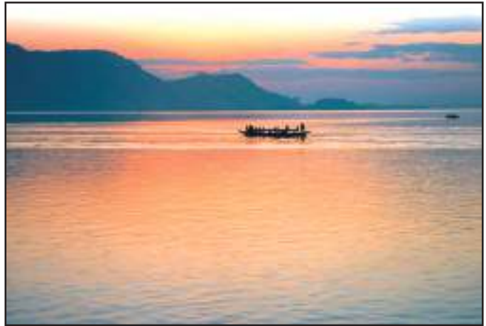
Fig. 8.7 Brahmaputra river

The plains of the Ganga and the Brahmaputra, the mountains and the foothills of the