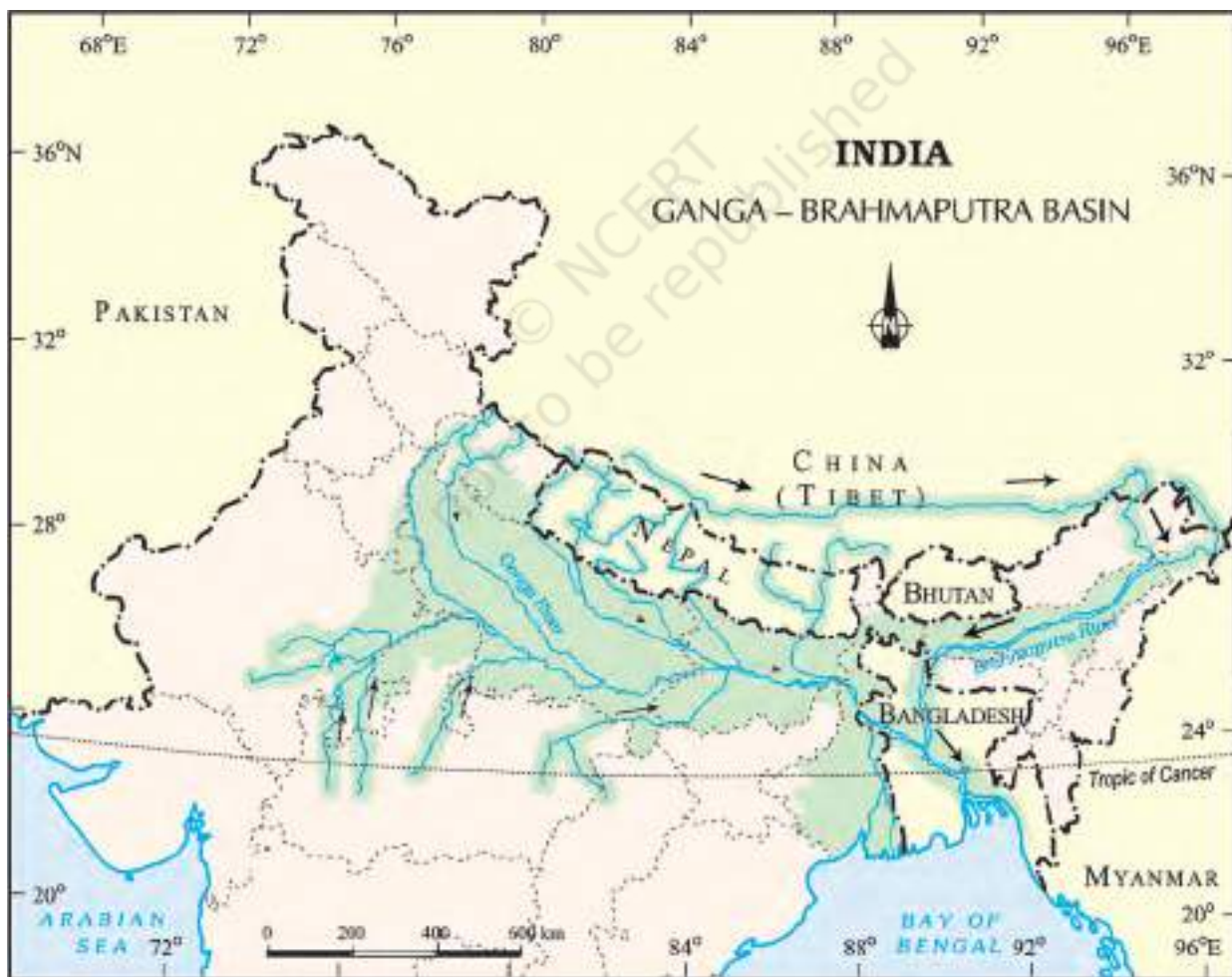
Fig. 8.8: Ganga-Brahmaputra Basin