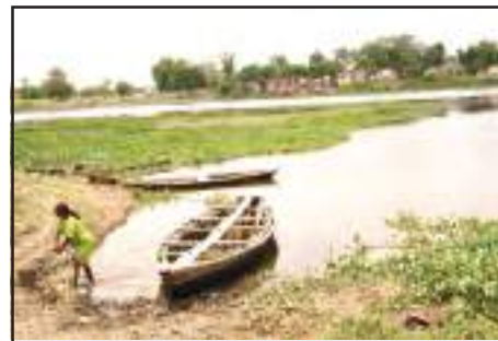
A Polluted Lake

to sell in the market. They have even begun supply to the neighbouring town. The community is living in harmony with nature. As long as the pollutants from nearby towns do not find their way into the lake waters, the fish cultivation will not face any threat.