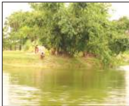
A clean lake

Binod is a fisherman living in the Matwali Maun village of Bihar. He is a happy man today. With the efforts of the fellow fishermen – Ravindar, Kishore, Rajiv and others, he cleaned the maun or the ox-bow lake to cultivate different varieties of fish. The local weed (vallisneria, hydrilla) that grows in the lake is the food of the fish. The land around the lake is fertile. He sows crops such as paddy, maize and pulses in these fields. The buffalo is used to plough the land. The community is satisfied. There is enough fish catch from the river – enough fish to eat and enough fish