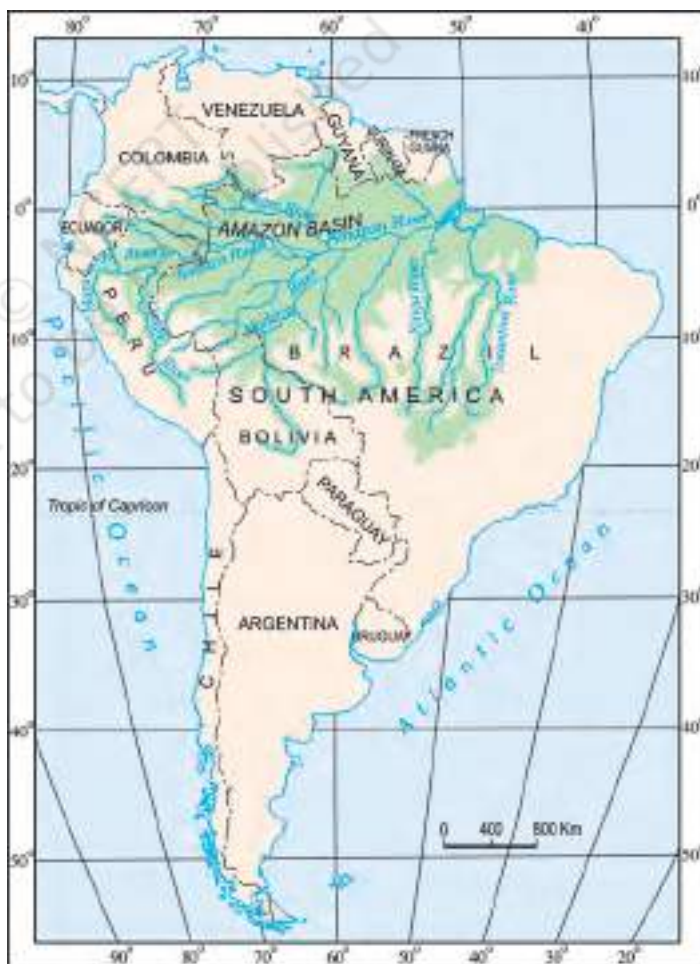
Fig. 8.2: The Amazon Basin in South America

Name the countries of the basin through which the equator passes.