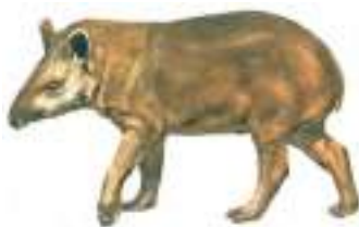
Fig. 8.5 : Tapir

are found here (Fig. 8.5). Various species of reptiles and snakes also thrive in these jungles. Crocodiles, snakes, pythons abound. Anaconda and boa constrictor are some of the species. Besides, the basin is home to thousands of species of insects. Several species of fishes including the flesh-eating Piranha fish is also found in the river. This basin is thus extraordinarily rich in the variety of life found there.