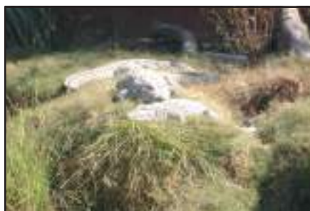
Fig. 8.12 : Crocodiles