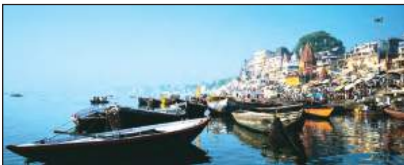
Fig. 8.13: Varanasi along the River Ganga

The Ganga-Brahmaputra plain has several big towns and cities. The cities of Allahabad, Kanpur, Varanasi, Lucknow, Patna and Kolkata all with the population of more than ten lakhs are located along the River Ganga (Fig. 8.13). The wastewater from these towns