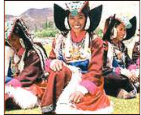
Fig. 9.6: Ladakhi Women in Traditional Dress

Life of people is undergoing change due to modernisation. But the people of Ladakh have over the centuries learned to live in balance and harmony with nature. Due to scarcity of resources like water and fuel, they are used with reverence and care. Nothing is discarded or wasted.