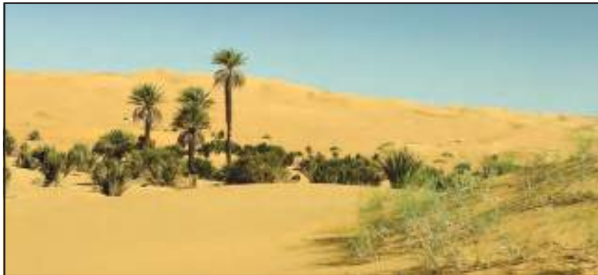
Fig. 9.3: Oasis in the Sahara Desert

snakes and lizards are the prominent animal species living there.