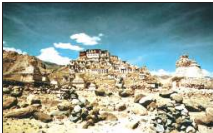
Fig. 9.5: Thiksey Monastery

The finest cricket bats are made from the wood of the willow trees.