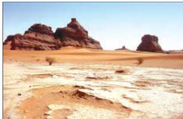
Fig. 9.1: The Sahara Desert

Look at the map of the world and the continent of Africa. Locate the Sahara desert covering a large part of North Africa. It is the world's largest desert. It has an area of around 8.54 million sq. km. Do you recall that India has an area of 3.2 million sq. km? The Sahara desert touches eleven countries. These are Algeria, Chad, Egypt, Libya, Mali, Mauritania, Morocco, Niger, Sudan, Tunisia and Western Sahara.