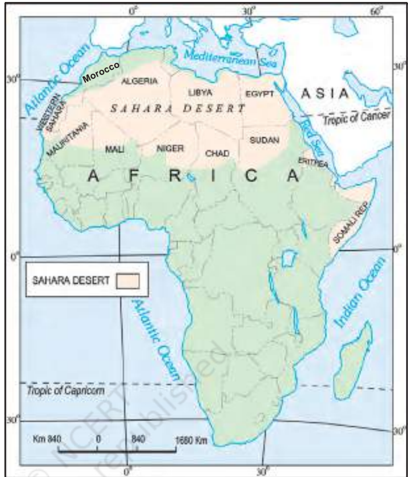
Fig. 9.2: Sahara in Africa

You will be surprised to know that present day Sahara once used to be a lush green plain. Cave paintings in Sahara desert show that there used to be rivers with crocodiles. Elephants, lions, giraffes, ostriches, sheep, cattle and goats were common animals. But the change in climate has changed it to a very hot and dry region.