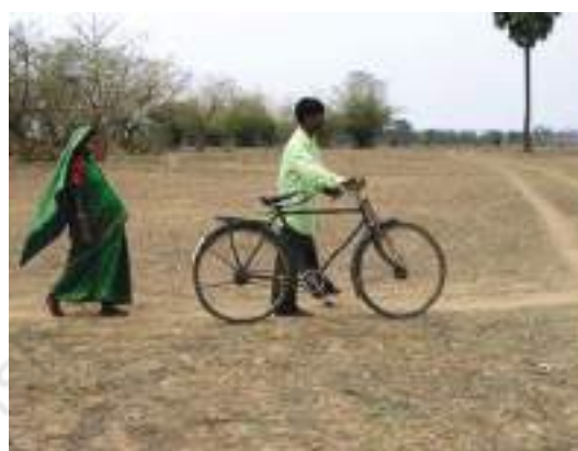
This pregnant lady has to travel many kilometres to see a qualified doctor.