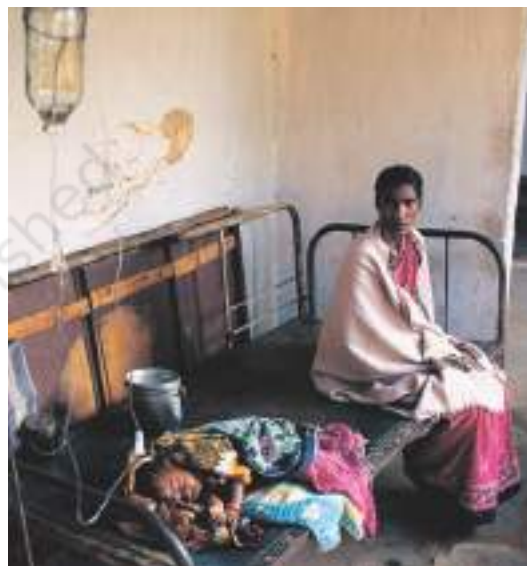
A woman and her sick child at a government hospital. According to UNICEF, more than a million children die every year in India from preventable infections.

In what ways is the public health system meant for everyone?