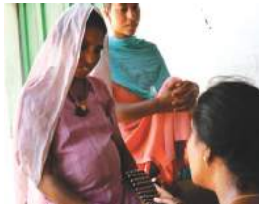
A doctor in a rural health care centre giving medicines to a patient.

There is a wide range of private health facilities that exist in our country. A large number of doctors run their own private clinics. In the rural areas, one finds Registered Medical Practitioners (RMPs). Urban areas have a large number of doctors, many of them providing specialised services. There are hospitals and nursing homes that are privately owned. There are many laboratories that do tests and offer special facilities such as X-ray, ultrasound, etc. There are also shops from where we buy medicines.