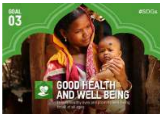
Sustainable Development Goal (SDG) www.in.undp.org