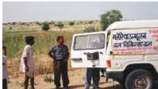
In rural areas, a jeep is often used to serve as a mobile clinic for patients.

There is little doubt that the health situation of most people in our country is not good. It is the responsibility of the government to provide quality healthcare services to all its citizens, especially the poor and the disadvantaged. However, health is as much dependent on basic amenities and social conditions of the people, as it is on healthcare services. Hence, it is important to work on both in order to improve the health situation of our people. And this can be done. Look at the following example.