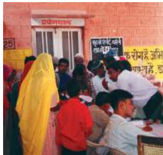
Patients usually have to wait in long queues in government hospitals, like this one.

However, the second column points out how poor the health situation in our country is. With all the above positive developments we are not able to provide proper healthcare facilities to people. This is the paradox – something that is contrary to what we would expect. Our country has the money, knowledge and people with experience but cannot make the necessary healthcare available to all. In this chapter, we will look at some of the reasons for this.