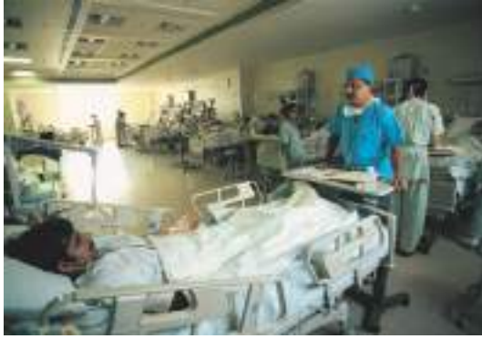
A post-operative room in a leading private hospital in Delhi.

Private health facilities can mean many things. Explain with the help of some examples from your area.