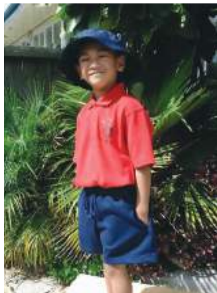
A Class VII Samoan child in his school uniform.

From Class VI onwards, boys and girls went to separate schools. The girls' school was designed very differently from the boys' school. They had a central courtyard where they played in total seclusion and