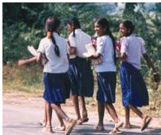
Why do girls like to go to school together in groups?

In what ways do the experiences of Samoan children and teenagers differ from your own experiences of growing up? Is there anything in this experience that you wish was part of your growing up?