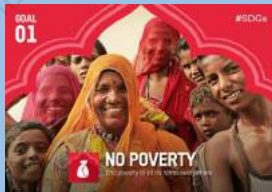
Sustainable Development Goal (SDG) www.in.undp.org

What do you think is meant by the expression 'power over the ballot box'? Discuss.