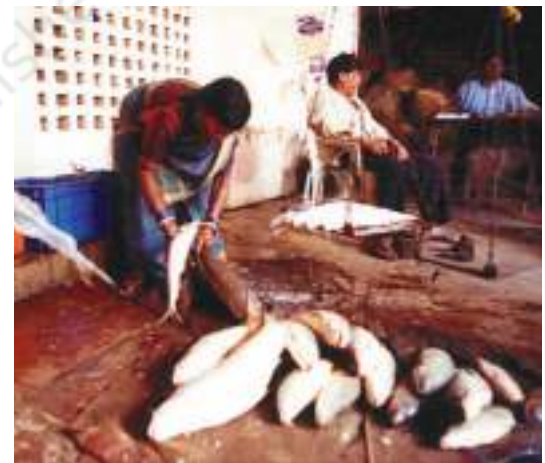
Top: Members of the TMS protesting at a rally. Above: A member of the cooperative weighing the fish.

With the TMS taking over the fishworkers were able to increase their earnings substantially. This was because they set up the cooperative which would buy the catch from them at a fair price. The cooperative would then arrange to transport and sell this in markets where they would get a good price. They have now begun to earn three times more than they earned earlier. The TMS has also begun giving the fishworkers loans for repair and the buying of new nets. By managing to earn a higher wage as well as preserving the fish in the reservoir, the TMS has shown that when people's organisations get their rights to livelihood, they can be good managers.