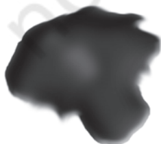
Fig. 5.3: Coal tar

It is a black, thick liquid (Fig. 5.3) with an unpleasant smell. It is a mixture of