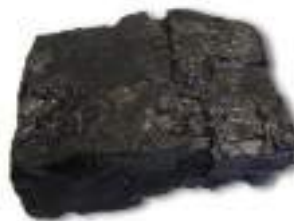
Fig. 5.1: Coal

You may have seen coal or heard about it (Fig. 5.1). It is as hard as stone and is black in colour.