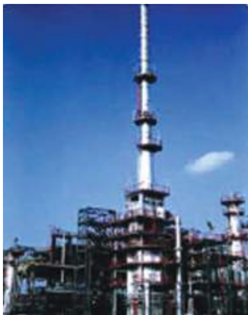
Fig. 5.5: A petroleum refinery

separating the various constituents/fractions of petroleum is known as refining. It is carried out in a petroleum refinery (Fig. 5.5).