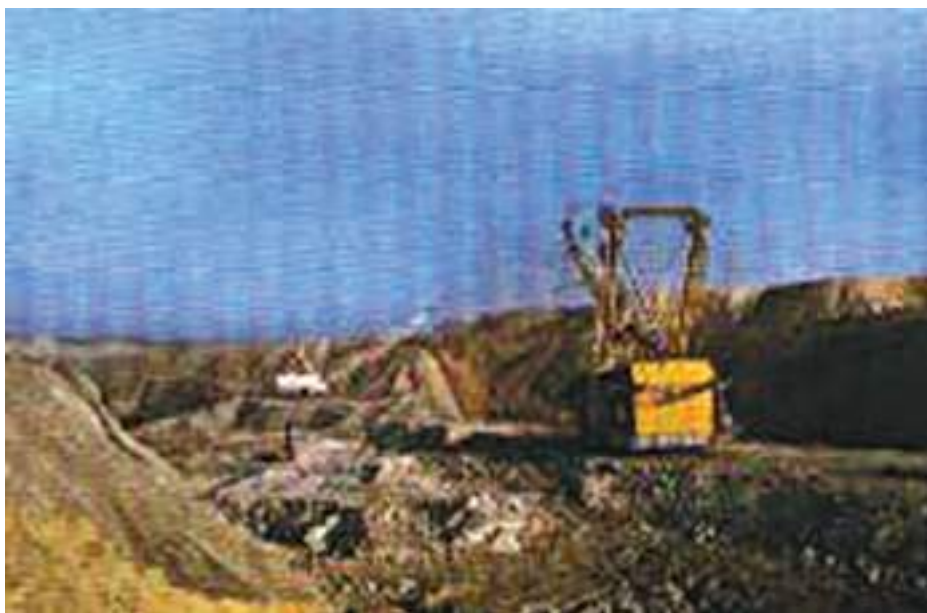
Fig. 5.2: A coal mine

When heated in air, coal burns and produces mainly carbon dioxide gas.