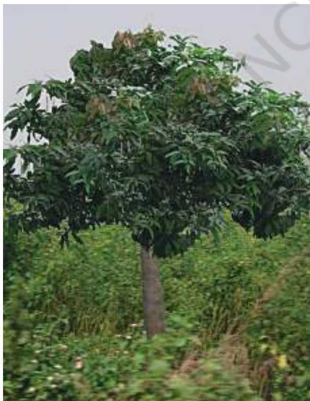
Fig. 7.3 (a) : Wild Mango

Madhavji shows sal and wild mango (Fig. 7.3 (a)) as two examples of the