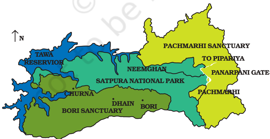
Fig. 7.1 : Pachmarhi Biosphere Reserve