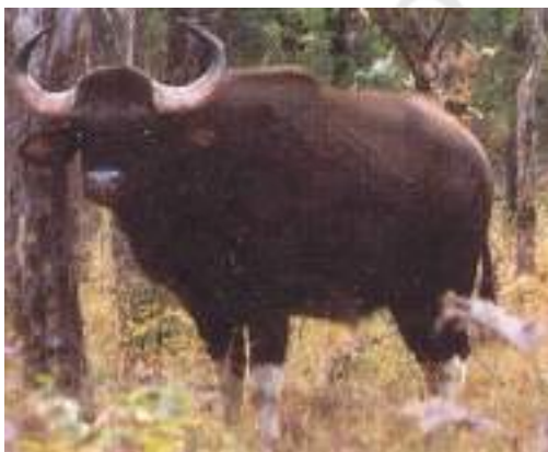
Fig. 7.5 : Wild buffalo

buffaloes (Fig. 7.5) and barasingha (Fig. 7.6) were also found in the Satpura National Park. Animals whose numbers are diminishing to a level that they might face extinction are known as the endangered animals . Boojho is reminded of the dinosaurs which became extinct a long time ago. Survival of some