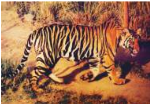
Fig. 7.4 : Tiger

Tiger (Fig. 7.4) is one of the many species which are slowly disappearing from our forests. But, the Satpura Tiger Reserve is unique in the sense that a significant increase in the population of tigers has been seen here. Once upon a time, animals like lions, elephants, wild