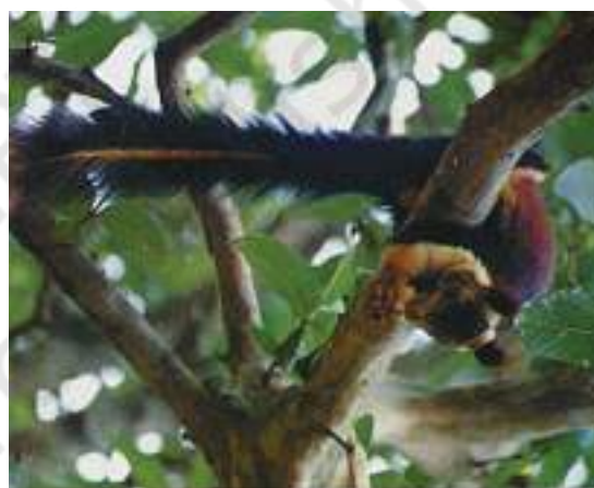
Fig. 7.3 (b) : Giant squirrel

endemic flora of the Pachmarhi Biosphere Reserve. Bison, Indian giant squirrel [Fig. 7.3 (b)] and flying squirrel are endemic fauna of this area. Professor Ahmad explains that the destruction of their habitat, increasing population and introduction of new species may affect the natural habitat of endemic species and endanger their existence.