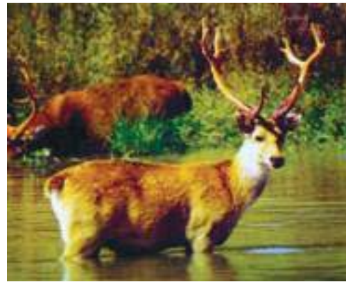
Fig. 7.6 : Barasingha

animals has become difficult because of disturbances in their natural habitat. Professor Ahmad tells them that in order to protect plants and animals strict rules are imposed in all National Parks. Human activities such as grazing, poaching, hunting, capturing of animals or collection of firewood, medicinal plants, etc. are not allowed