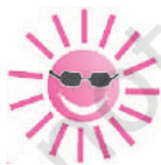
Delhi ( 43^{\circ} )