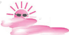
Chennai ( 39^{\circ} )