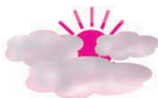
Gangtok ( 6^{\circ} )