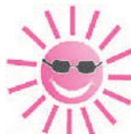
Nagpur ( 43^{\circ} )