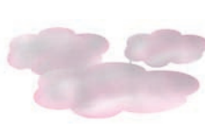
Srinagar ( 2^{\circ} )