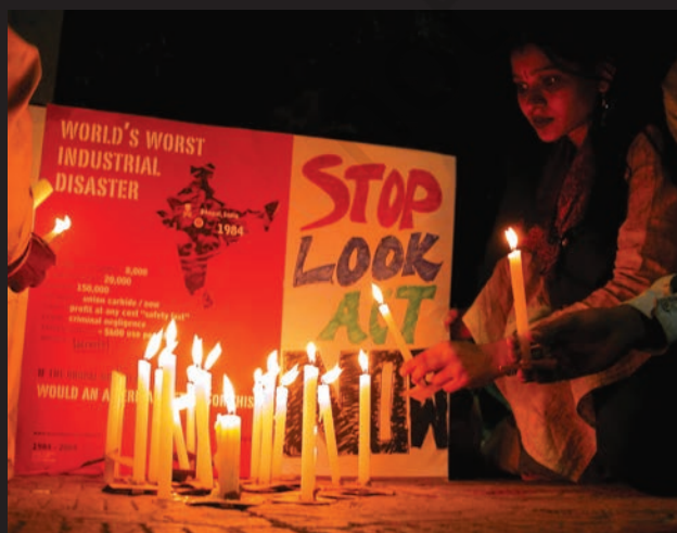
The struggle for justice goes on...