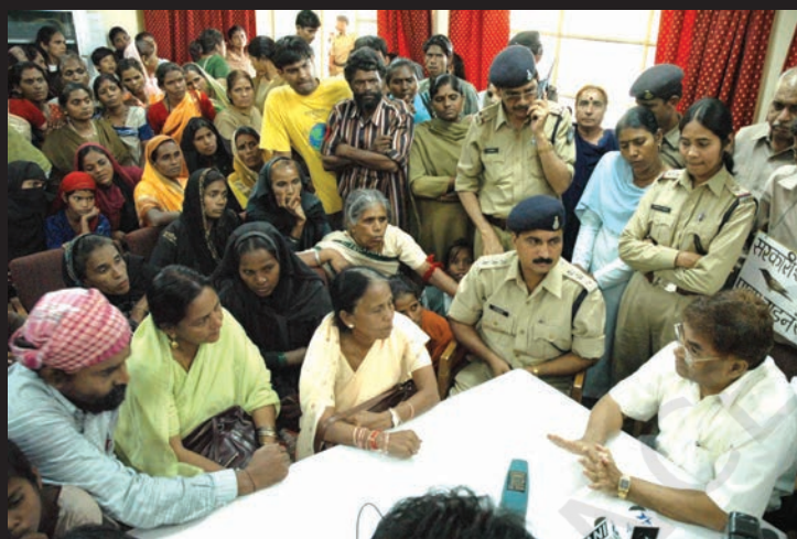
Gas victims with the Gas Relief Minister

Despite the overwhelming evidence pointing to UC as responsible for the disaster, it refused to accept responsibility.