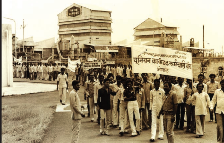
Members of UC Employees Union protesting

The disaster was not an accident. UC had deliberately ignored the essential safety measures in order to cut costs. Much before the Bhopal disaster, there had been incidents of gas leak killing a worker and injuring several.