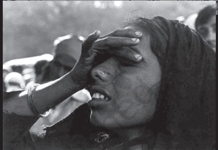
The next morning