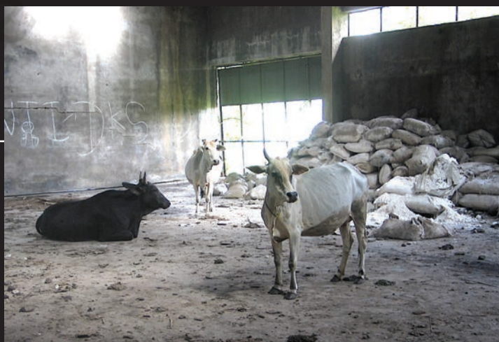
Bags of chemicals lie strewn around the UC plant

UC stopped its operations, but left behind tons of toxic chemicals. These have seeped into the ground, contaminating water. Dow Chemical, the company who now owns the plant, refuses to take responsibility for clean up.