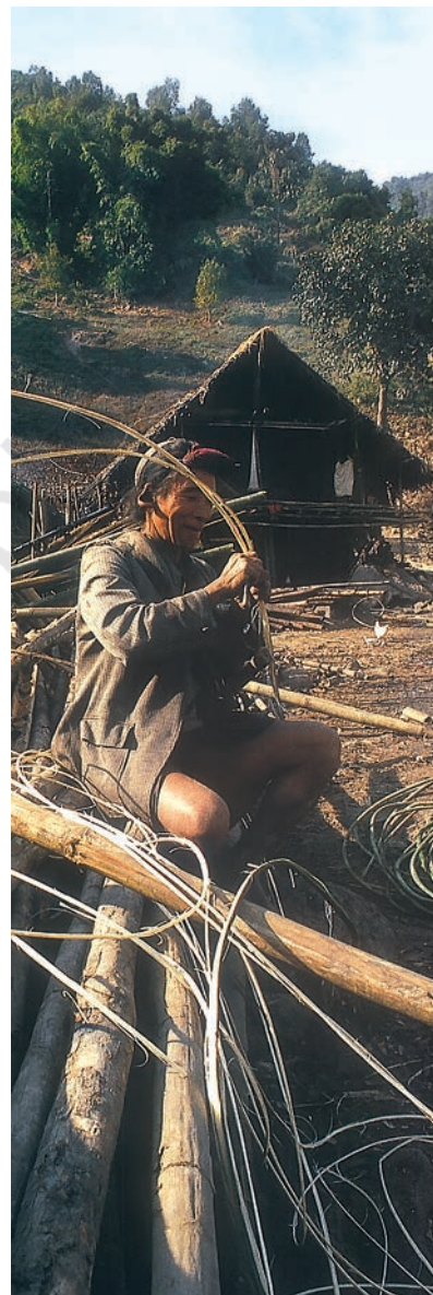
Fig. 5 – A log house being built in a village of the Nyishi tribes of Arunachal Pradesh.

Bewar – A term used in Madhya Pradesh for shifting cultivation