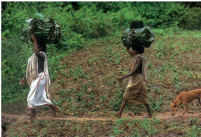
Fig. 2 – Dongria Kandha women in Orissa take home pandanus leaves from the forest to make plates

Mahua – A flower that is eaten or used to make alcohol