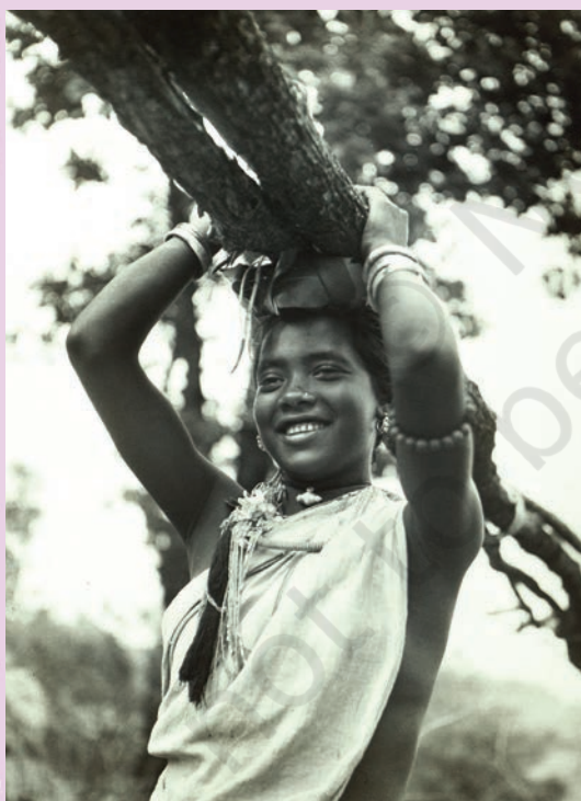
Fig. 4 – A Santhal girl carrying firewood, Bihar, 1946