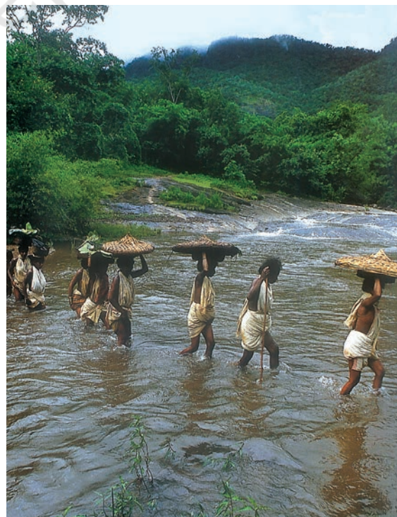
Fig. 1 – Women of the Dongria Kandha tribe in Orissa wade through the river on the way to the market

You have read about tribal societies last year. Most tribes had customs and rituals that were very different from those laid down by Brahmans. These societies also did not have the sharp social divisions that were characteristic of caste societies. All those who belonged to the same tribe thought of themselves as sharing common ties of kinship. However, this did not mean that there were no social and economic differences within tribes.