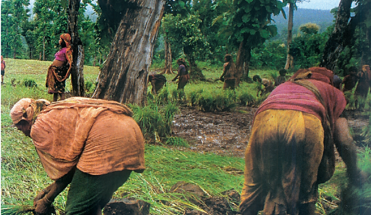
Fig. 6 – Bhil women cultivating in a forest in Gujarat

Shifting cultivation continues in many forest areas of Gujarat. You can see that trees have been cut and land cleared to create patches for cultivation.