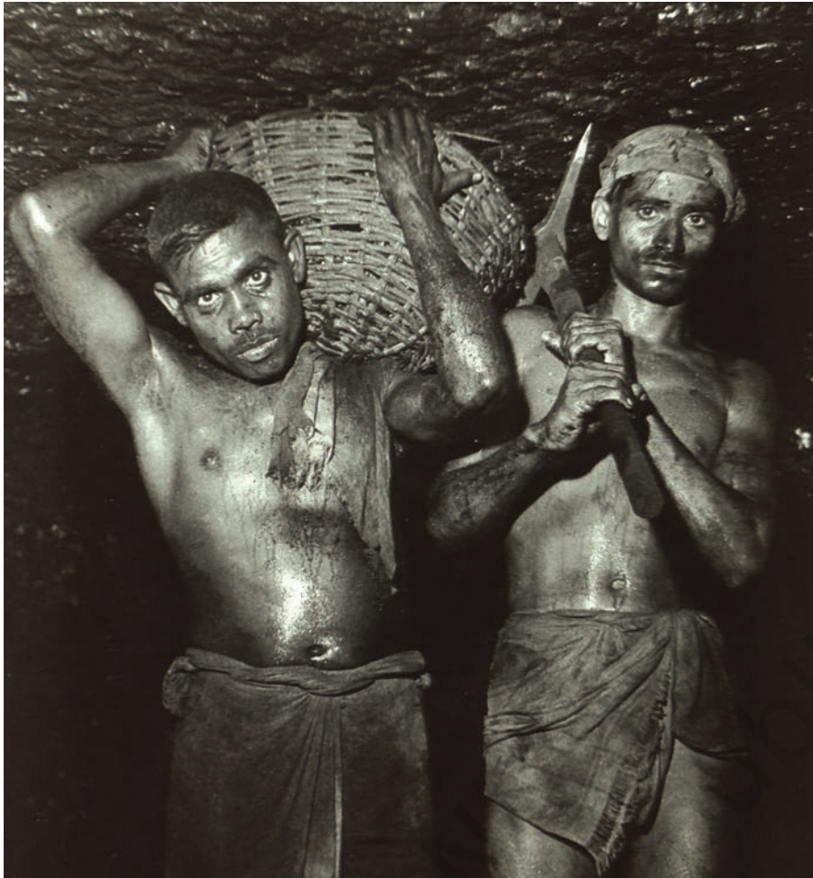
Fig. 10 – Coal miners of Bihar, 1948

In the 1920s, about 50 per cent of the miners in the Jharia and Raniganj coal mines of Bihar were tribals. Work deep down in the dark and suffocating mines was not only back-breaking and dangerous, it was often literally killing. In the 1920s, over 2,000 workers died every year in the coal mines in India.