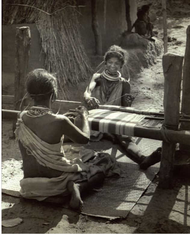
Fig. 8 – Godara women weaving

Many tribal groups reacted against the colonial forest laws. They disobeyed the new rules, continued with practices that were declared illegal, and at times rose in open rebellion. Such was the revolt of Songram Sangma in 1906 in Assam, and the forest satyagraha of the 1930s in the Central Provinces.