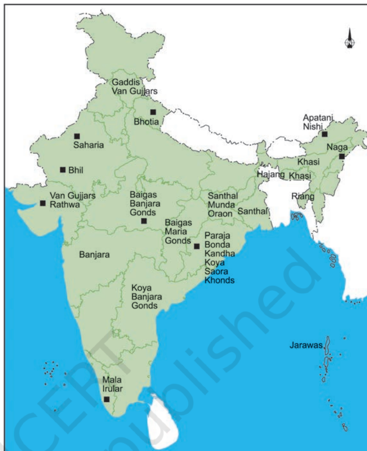
Fig. 3 – Location of some tribal groups in India

Many tribal groups lived by herding and rearing animals. They were pastoralists who moved with their herds of cattle or sheep according to the seasons. When the grass in one place was exhausted, they moved to another area. The Van Gujjars of the Punjab hills and the Labadis of Andhra Pradesh were cattle herders, the Gaddis of Kulu were shepherds, and the Bakarwals of Kashmir reared goats. You will read more about them in your history book next year.