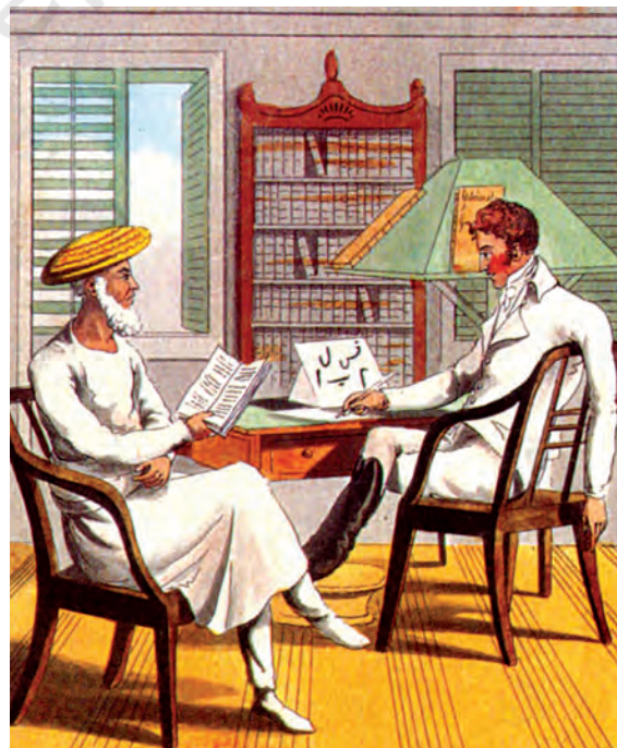
Fig. 1 – William Jones learning Persian

In 1783, a person named William Jones arrived in Calcutta. He had an appointment as a junior judge at the Supreme Court that the Company had set up. In addition to being an expert in law, Jones was a linguist . He had studied Greek and Latin at Oxford, knew French and English, had picked up Arabic from a friend, and had also learnt Persian. At Calcutta, he began spending many hours a day with pandits who taught him the subtleties of Sanskrit language, grammar and