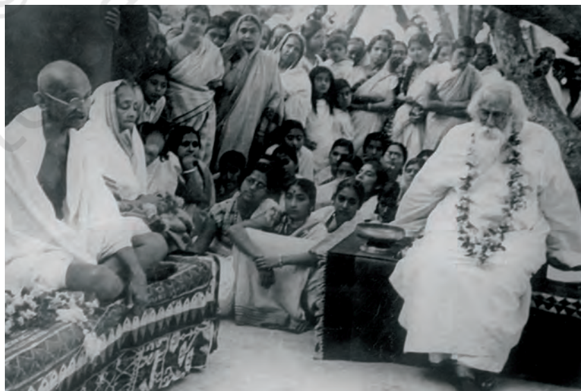
Fig. 10 – Mahatma Gandhi along with Kasturba Gandhi sitting with Rabindranath Tagore and a group of girls at Santiniketan, 1940

Western education, Mahatma Gandhi said, focused on reading and writing rather than oral knowledge; it valued textbooks rather than lived experience and practical knowledge. He argued that education ought to develop a person’s mind and soul. Literacy – or simply learning to read and write – by itself did not count as education. People had to work with their hands, learn a craft, and know how different things operated. This would develop their mind and their capacity to understand.