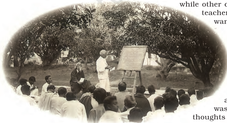
Fig. 11 – A class in progress in Santiniketan in the 1930s Notice the surroundings – the trees and the open spaces.

The experience of his schooldays in Calcutta shaped Tagore’s ideas of education. On growing up, he wanted to set up a school where the child was happy, where she could be free and creative, where she was able to explore her own thoughts and desires. Tagore felt