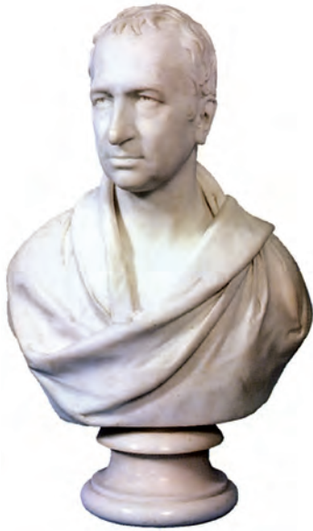
Fig. 2 – Henry Thomas Colebrooke

He was a scholar of Sanskrit and ancient sacred writings of Hinduism.