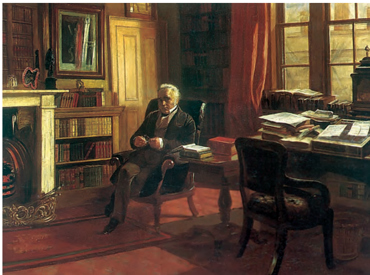
Fig. 4 – Thomas Babington Macaulay in his study

“a single shelf of a good European library was worth the whole native literature of India and Arabia”. He urged that the British government in India stop wasting public money in promoting Oriental learning, for it was of no practical use.