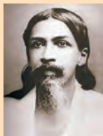
Fig. 9 – Sri Aurobindo Ghose

In a speech delivered on January 15, 1908 in Bombay, Aurobindo Ghose stated that the goal of national education was to awaken the spirit of nationality among the students. This required a contemplation of the heroic deeds of our ancestors. The education should be imparted in the vernacular so as to reach the largest number of people. Aurobindo Ghose emphasised that although the students should remain connected to their own roots, they should also take the fullest advantage of modern scientific discoveries and Western experiments in popular governments. Moreover, the students should also learn some useful crafts so that they could be able to find some moderately remunerative employment after leaving their schools.