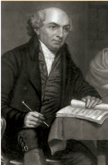
Fig. 6 – William Carey was a Scottish missionary who helped establish the Serampore Mission

The argument for practical education was strongly criticised by the Christian missionaries in India in the nineteenth century. The missionaries felt that education should attempt to improve the moral character of the people, and morality could be improved only through Christian education.