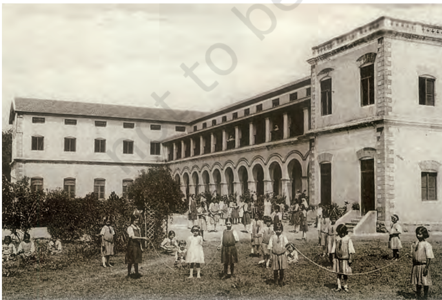
Fig. 12 – Children playing in a missionary school in Coimbatore, early twentieth century

Many individuals and thinkers were thus thinking about the way a national educational system could be fashioned. Some wanted changes within the system set up by the British, and felt that the system could be extended so as to include wider sections of people. Others urged that alternative systems be created so that people were educated into a culture that was truly national. Who was to define what was truly national? The debate about what this “national education” ought to be continued till after independence.