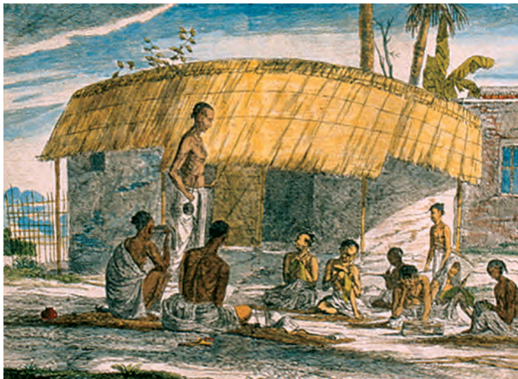
Fig. 8 – A village pathshala

Adam discovered that this flexible system was suited to local needs. For instance, classes were not held during harvest time when rural children often worked in the fields. The pathshala started once again when the crops had been cut and stored. This meant that even children of peasant families could study.