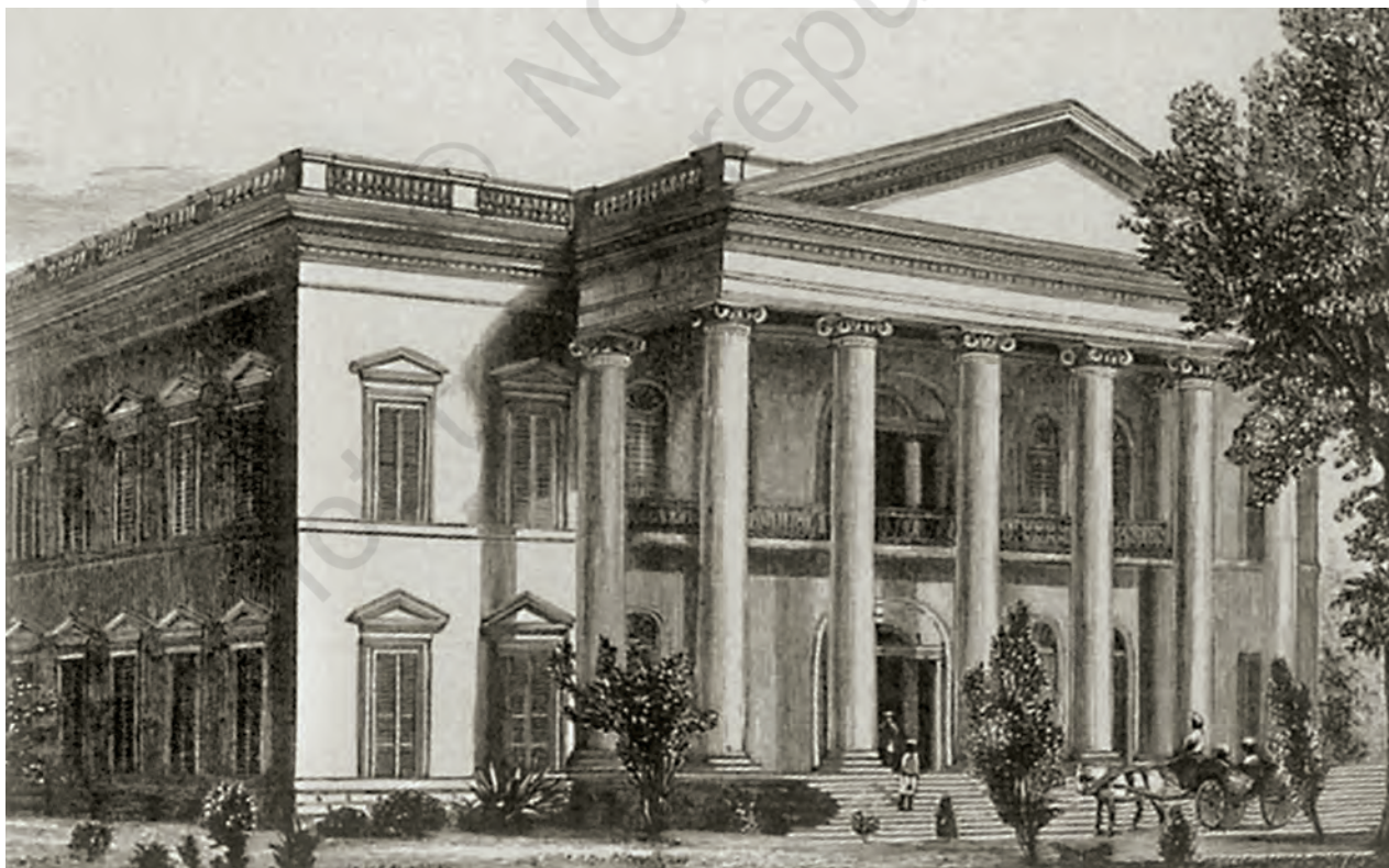
Fig. 7 – Serampore College on the banks of the river Hooghly near Calcutta

Over the nineteenth century, missionary schools were set up all over India. After 1857, however, the British government in India was reluctant to directly support missionary education. There was a feeling that any strong attack on local customs, practices, beliefs and religious ideas might enrage “native” opinion.