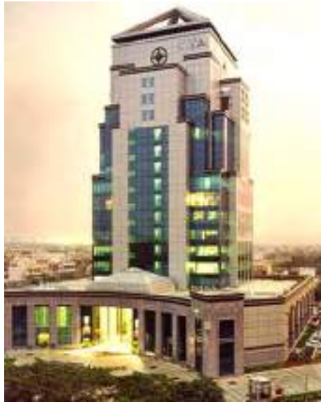
Complex designed by Hafeez Contractor

defied: broke instinctively: naturally (not coming from training or based on reasoning)