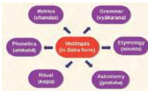
Visual mapping of the various disciplines encompassed in the Vedas

between Shastras (learned disciplines) and Kavyas (imaginative and creative literature). Sources of learning were drawn from various disciplines such as Itihas (history), Anviksiki (logic), Mimamsa (interpretation) Shilpashastra (architecture), Arthashastra (polity), Varta (agriculture, trade, commerce, animal husbandry) and Dhanurvediya (archery).