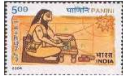
Postage stamp of Indian grammarian, Panini

Takshashila became famous as a place of learning due to its teachers' expertise. Among its noted pupils were the legendary Indian grammarian, Panini. He was an expert in language and grammar and authored one of the greatest works on grammar called Ashtadhyayi . Jivaka, one of the most renowned physicians in ancient India, and Chanakya (also known as Kautilya), a skilled exponent of statecraft, both studied here. Students came to Takshashila from Kashi, Kosala, Magadha and also from other countries in spite of the long and arduous journey they had to undertake.