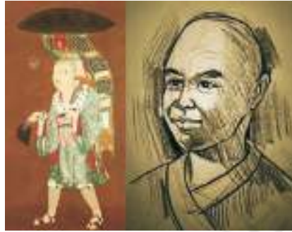
Xuan Zang I-Qing

Nalanda, when Xuan Zang visited it, was called Nala and was a centre of higher learning in various subjects. The University attracted scholars from the different parts of the country as well as world. The Chinese scholars I-Qing and Xuan Zang visited Nalanda in the 7th century CE. They have given vivid accounts of Nalanda. They have noted that as many as one hundred