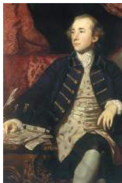
Fig. 3 – Warren Hastings became the first Governor-General of India in 1773

Mill thought that all Asian societies were at a lower level of civilisation than Europe. According to his telling of history, before the British came to India, Hindu and Muslim despots ruled the country. Religious intolerance, caste taboos and superstitious practices dominated