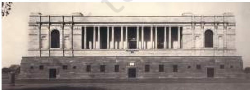
Fig. 4 – The National Archives of India came up in the 1920s

In the early years of the nineteenth century these documents were carefully copied out and beautifully written by calligraphists – that is, by those who specialised in the art of beautiful writing. By the middle of the nineteenth century, with the spread of printing, multiple copies of these records were printed as proceedings of each government department.