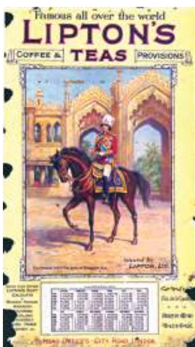
Fig. 2 – Advertisements help create taste

Consider an example. In the histories written by British historians in India, the rule of each Governor-General was important. These histories began with the rule of the first Governor-General, Warren Hastings, and ended with the last Viceroy, Lord Mountbatten. In separate chapters we read about the deeds of others –