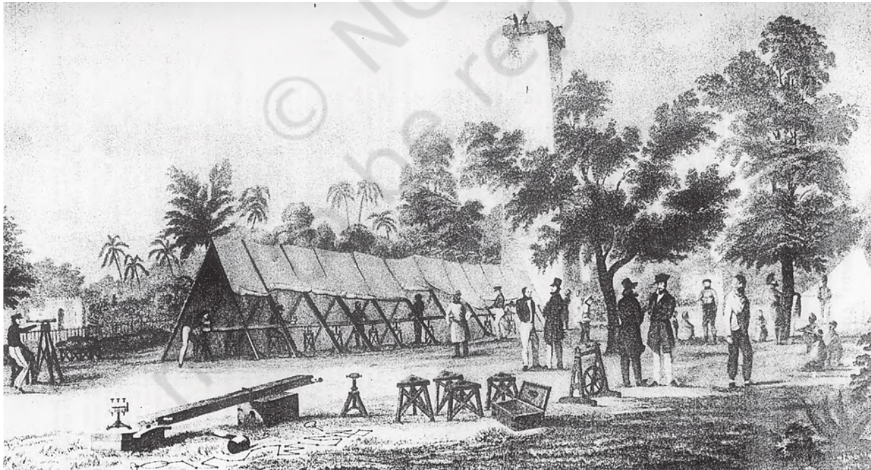
Fig. 6 – Mapping and survey operations in progress in Bengal, a drawing by James Prinsep, 1832 Note how all the instruments that were used in surveys are placed in the foreground to emphasise the scientific nature of the project.

From this vast corpus of records we can get to know a lot, but we must remember that these are official records. They tell us what the officials thought, what