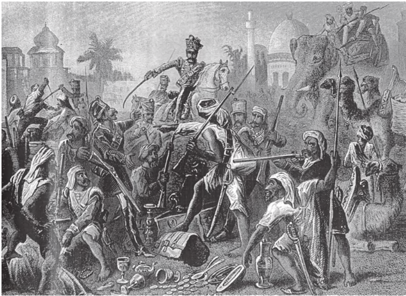
Fig. 7 – The rebels of 1857

Images need to be carefully studied for they project the viewpoint of those who create them. This image can be found in several illustrated books produced by the British after the 1857 rebellion. The caption at the bottom says: “Mutinous sepoy share the loot”. In British representations the rebels appear as greedy, vicious and brutal. You will read about the rebellion in Chapter 5.