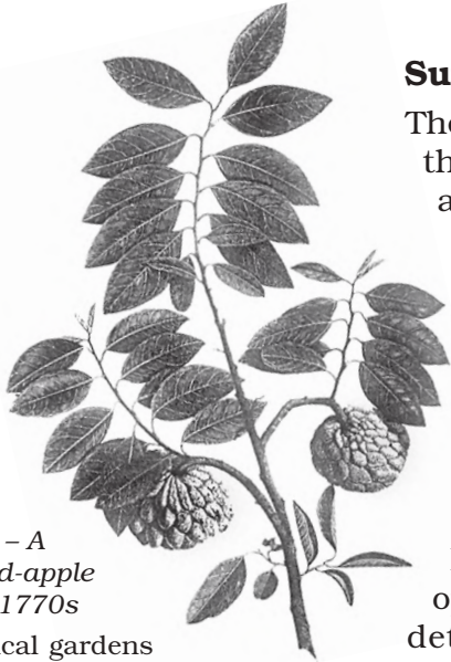
Fig. 5 – A custard-apple plant, 1770s

Botanical gardens and natural history museums established by the British collected plant specimens and information about their uses. Local artists were asked to draw pictures of these specimens. Historians are now looking at the way such information was gathered and what this information reveals about the nature of colonialism.