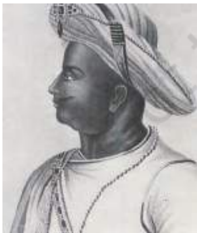
Fig. 8 – Tipu Sultan

had to pay for the “subsidiary forces” that the Company was supposed to maintain for the purpose of this protection. If the Indian rulers failed to make the payment, then part of their territory was taken away as penalty. For example, when Richard Wellesley was Governor-General (1798-1805), the Nawab of Awadh was forced to give over half of his territory to the Company in 1801, as he failed to pay for the “subsidiary forces”. Hyderabad was also forced to cede territories on similar grounds.