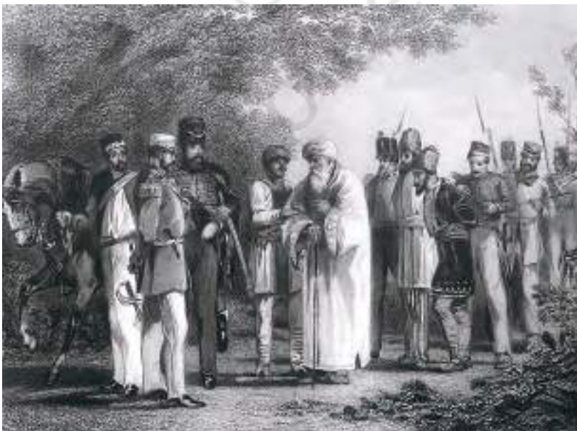
Fig. 1 – Bahadur Shah Zafar and his sons being arrested by Captain Hodson

By the second half of the eighteenth century, however, a new power was emerging on the political horizon – the British. Did you know that the British originally came as a small trading company and were reluctant to acquire territories? How then did they come to be masters of a vast empire? In this chapter you will see how this came about.