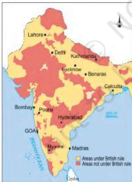
Fig. 14 c – India, 1857