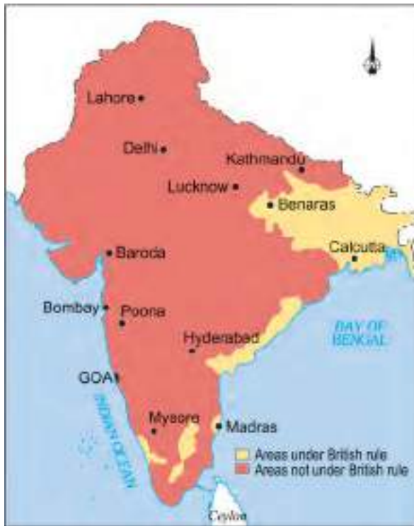
Fig. 14 a – India, 1797