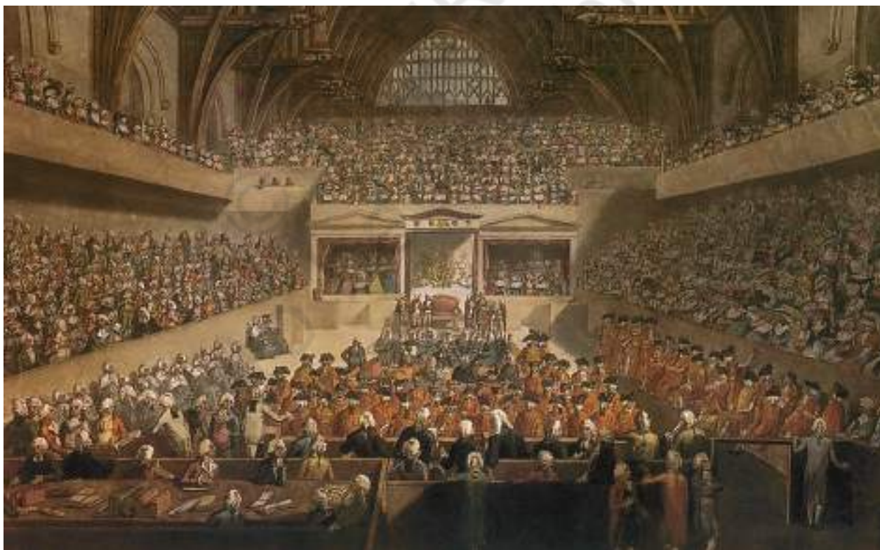
Fig. 15 – The trial of Warren Hastings, painted by R.G. Pollard, 1789

Impeachment – A trial by the House of Lords in England for charges of misconduct brought against a person in the House of Commons