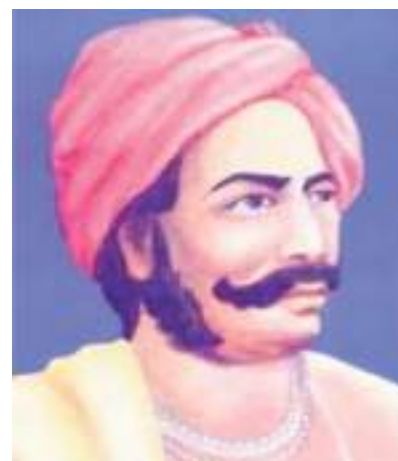
Fig. 14 – A portrait of Veer Surendra Sai