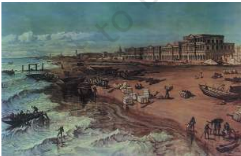
Fig. 3 – Local boats bring goods from ships in Madras, painted by William Simpson, 1867