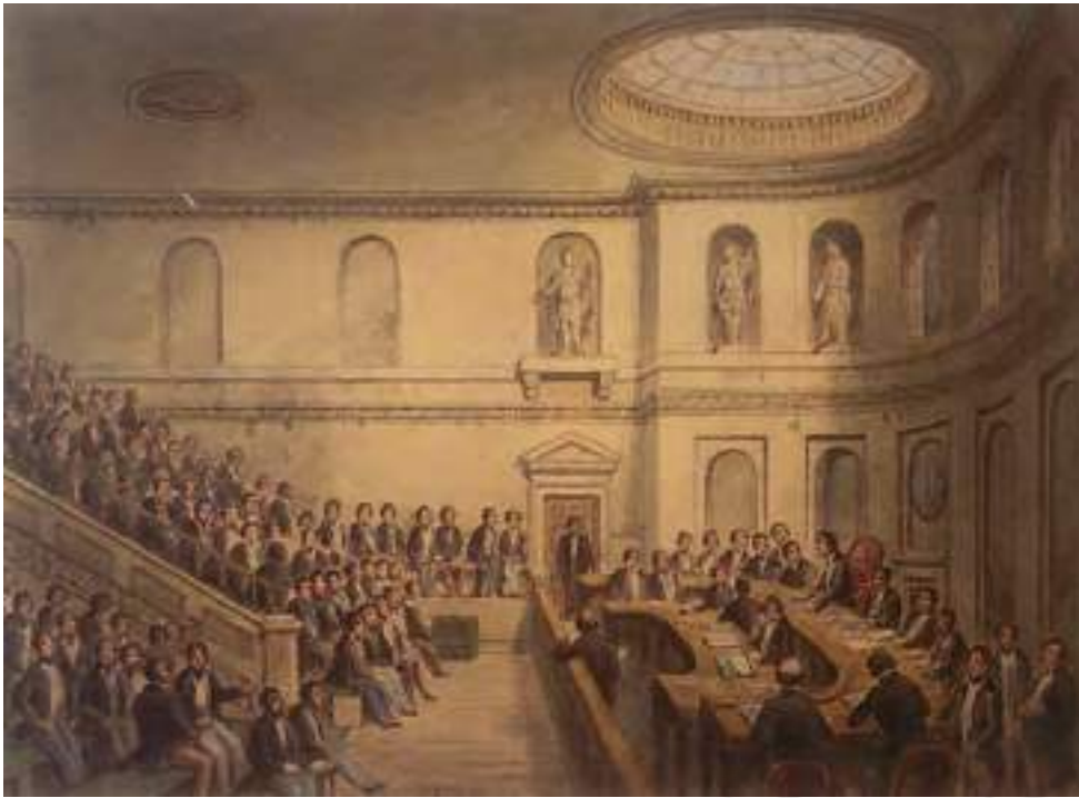
Fig. 5 – The General Court Room, East India House, Leadenhall Street

The Court of Proprietors of the East India Company had their meetings in the East India House on Leadenhall Street in London. This is a picture of one of their meetings in progress.