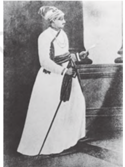
Fig. 6 – Sirajuddaulah