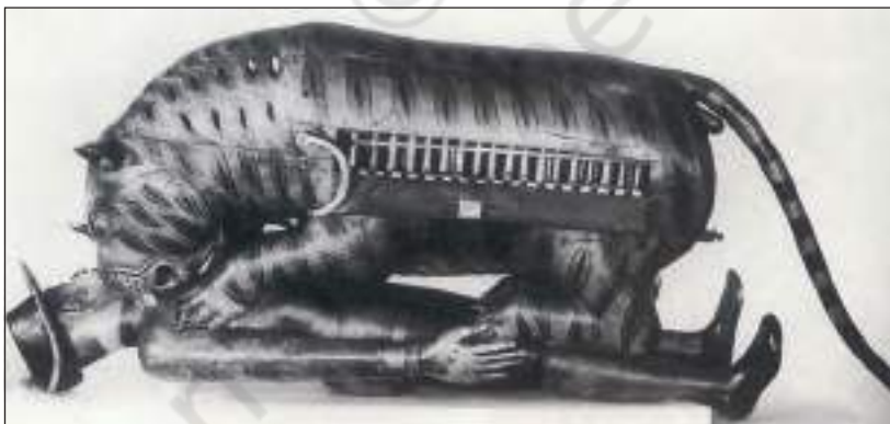
Fig. 10 – Tipu's toy tiger

Kings are often surrounded by legend and their powers glorified through folklore. Here is a legend about Tipu Sultan who became the ruler of Mysore in 1782. It is said that once he went hunting in the forest with a French friend. There he came face to face with a tiger. His gun did not work and his dagger fell to the ground. He battled with the tiger unarmed until he managed to reach down and pick up the dagger. Finally he was able to kill the tiger in the battle. After this he came to be known as the “Tiger of Mysore”. He had the image of the tiger on his flag.