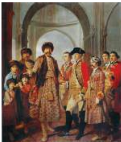
Fig. 7 – Nawab Shujauddaulah of Awadh, with his sons and the British Resident, painted by Tilly Kettle (oil, 1772)

The treaties that followed the Battle of Buxar forced Nawab Shujauddaulah to give up much of his authority. Here, however, he poses in regal splendour, towering over the Resident.