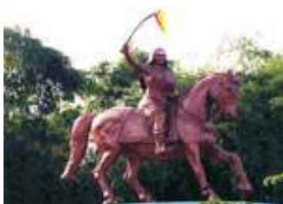
Fig. 12 – A Statue of the Queen of Kitoor (Karnataka)