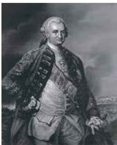
Fig. 4 – Robert Clive

Puppet – Literally, a toy that you can move with strings. The term is used disapprovingly to refer to a person who is controlled by someone else.