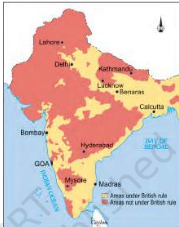
Fig. 14 b – India, 1840