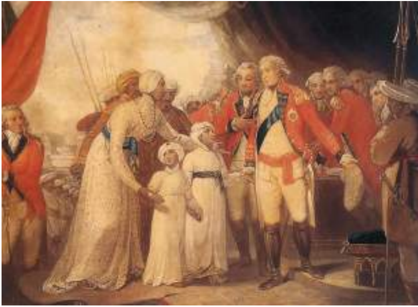
Fig. 9 – Cornwallis receiving the sons of Tipu Sultan as hostages, painted by Daniel Orme, 1793

The Company forces were defeated by Haidar Ali and Tipu Sultan in several battles. But in 1792, attacked by the combined forces of the Marathas, the Nizam of Hyderabad and the Company, Tipu was forced to sign a treaty with the British by which two of his sons were taken away as hostages. British painters always liked painting scenes that showed the triumph of British power.