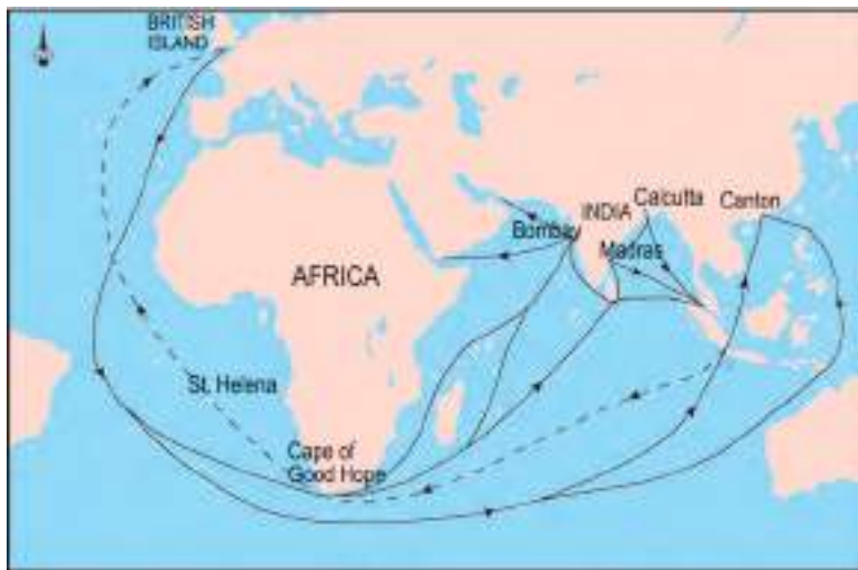
Fig. 2 – Routes to India in the eighteenth century