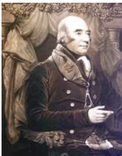
Fig. 11 – Lord Hastings