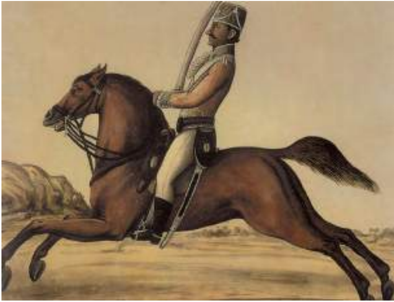
Fig. 16 – A sawar of Bengal in the service of the Company, painted by an unknown Indian artist, 1780

After the battles with the Marathas and the Mysore rulers, the Company realised the importance of strengthening its cavalry force.