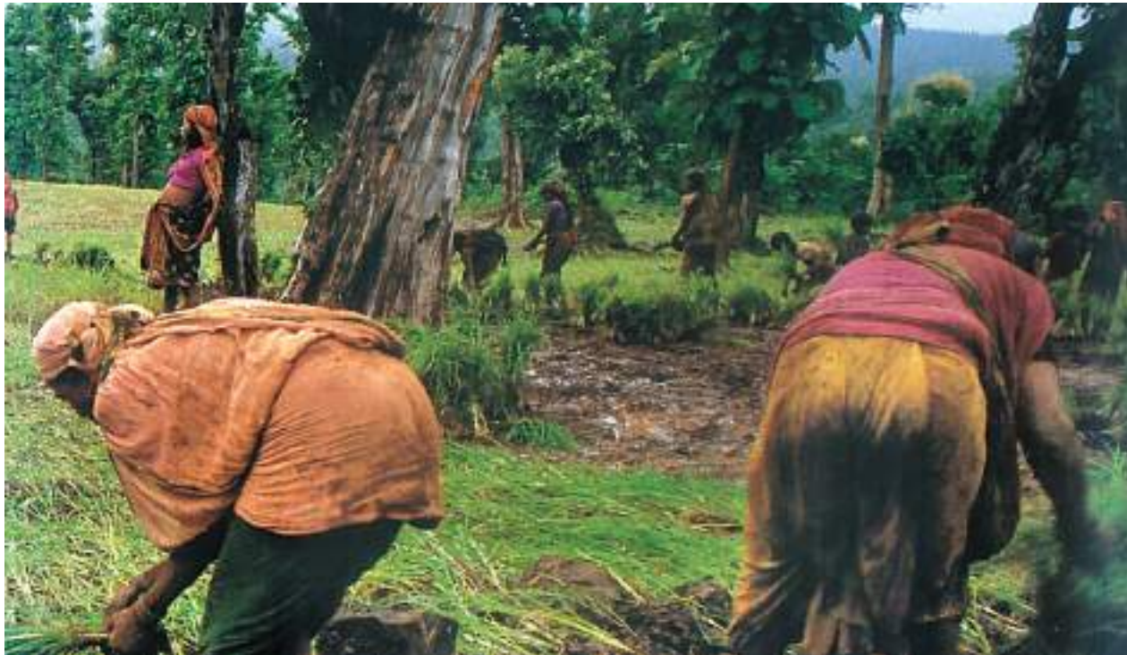
Fig. 6 – Bhil women cultivating in a forest in Gujarat

Shifting cultivation continues in many forest areas of Gujarat. You can see that trees have been cut and land cleared to create patches for cultivation.