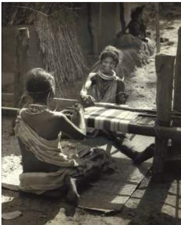
Fig. 8 – Godara women weaving

Many tribal groups reacted against the colonial forest laws. They disobeyed the new rules, continued with practices that were declared illegal, and at times rose in open rebellion. Such was the revolt of Songram Sangma in 1906 in Assam, and the forest satyagraha of the 1930s in the Central Provinces.