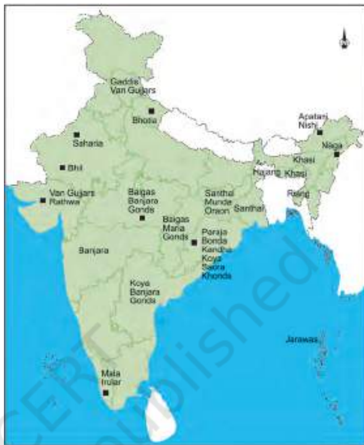
Fig. 3 – Location of some tribal groups in India

Many tribal groups lived by herding and rearing animals. They were pastoralists who moved with their herds of cattle or sheep according to the seasons. When the grass in one place was exhausted, they moved to another area. The Van Gujjars of the Punjab hills and the Labadis of Andhra Pradesh were cattle herders, the Gaddis of Kulu were shepherds, and the Bakarwals of Kashmir reared goats. You will read more about them in your history book next year.