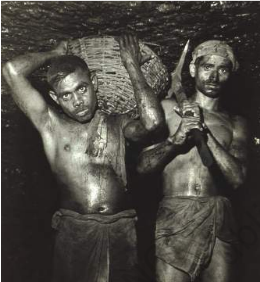
Fig. 10 – Coal miners of Bihar, 1948

In the 1920s about 50 per cent of the miners in the Jharia and Raniganj coal mines of Bihar were tribals. Work deep down in the dark and suffocating mines was not only back-breaking and dangerous, it was often literally killing. In the 1920s over 2,000 workers died every year in the coal mines in India.