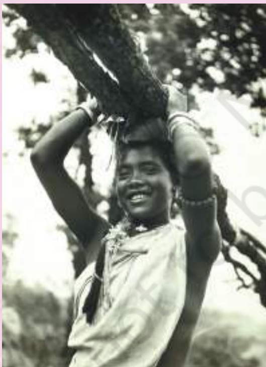
Fig. 4 – A Santhal girl carrying firewood, Bihar, 1946

Adapted from Verrier Elwin, Baiga (1939) and Elwin's unpublished 'Notes on the Khonds' (Verrier Elwin Papers, Nehru Memorial Museum and Library)