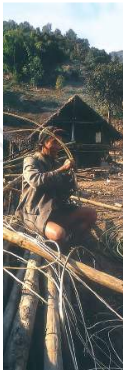
Fig. 5 – A log house being built in a village of the Nishi tribes of Arunachal Pradesh.

Bewar – A term used in Madhya Pradesh for shifting cultivation