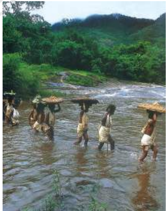
Fig. 1 – Women of the Dongria Kandha tribe in Orissa wade through the river on the way to the market

You have read about tribal societies last year. Most tribes had customs and rituals that were very different from those laid down by Brahmans. These societies also did not have the sharp social divisions that were characteristic of caste societies. All those who belonged to the same tribe thought of themselves as sharing common ties of kinship. However, this did not mean that there were no social and economic differences within tribes.