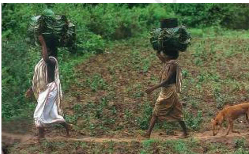
Fig. 2 – Dongria Kandha women in Orissa take home pandanus leaves from the forest to make plates

Mahua – A flower that is eaten or used to make alcohol