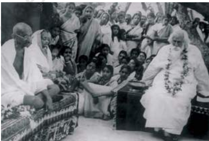
Fig. 10 – Mahatma Gandhi along with Kasturba Gandhi sitting with Rabindranath Tagore and a group of girls at Santiniketan, 1940

Western education, Mahatma Gandhi said, focused on reading and writing rather than oral knowledge; it valued textbooks rather than lived experience and practical knowledge. He argued that education ought to develop a person’s mind and soul. Literacy – or simply learning to read and write – by itself did not count as education. People had to work with their hands, learn a craft, and know how different things operated. This would develop their mind and their capacity to understand.