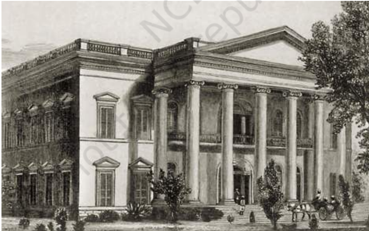
Fig. 7 – Serampore College on the banks of the river Hooghly near Calcutta

Over the nineteenth century, missionary schools were set up all over India. After 1857, however, the British government in India was reluctant to directly support missionary education. There was a feeling that any strong attack on local customs, practices, beliefs and religious ideas might enrage “native” opinion.