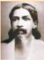
Fig. 9 – Sri Aurobindo Ghose

In a speech delivered on January 15, 1908 in Bombay, Aurobindo Ghose stated that the goal of national education was to awaken the spirit of nationality among the students. This required a contemplation of the heroic deeds of our ancestors. The education should be imparted in the vernacular so as to reach the largest number of people. Aurobindo Ghose emphasised that although the students should remain connected to their own roots, they should also take the fullest advantage of modern scientific discoveries and Western experiments in popular governments. Moreover, the students should also learn some useful crafts so that they could be able to find some moderately remunerative employment after leaving their schools.