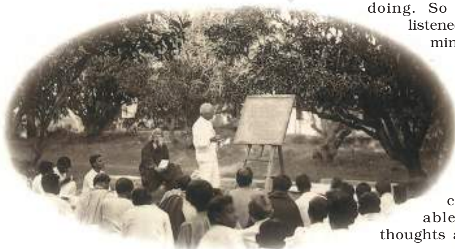
Fig. 11 – A class in progress in Santiniketan in the 1930s Notice the surroundings – the trees and the open spaces.

The experience of his schooldays in Calcutta shaped Tagore’s ideas of education. On growing up, he wanted to set up a school where the child was happy, where she could be free and creative, where she was able to explore her own thoughts and desires. Tagore felt