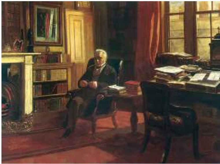
Fig. 4 – Thomas Babington Macaulay in his study

“a single shelf of a good European library was worth the whole native literature of India and Arabia”. He urged that the British government in India stop wasting public money in promoting Oriental learning, for it was of no practical use.