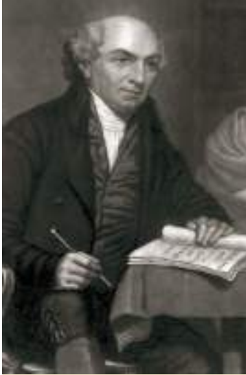
Fig. 6 – William Carey was a Scottish missionary who helped establish the Serampore Mission

The argument for practical education was strongly criticised by the Christian missionaries in India in the nineteenth century. The missionaries felt that education should attempt to improve the moral character of the people, and morality could be improved only through Christian education.