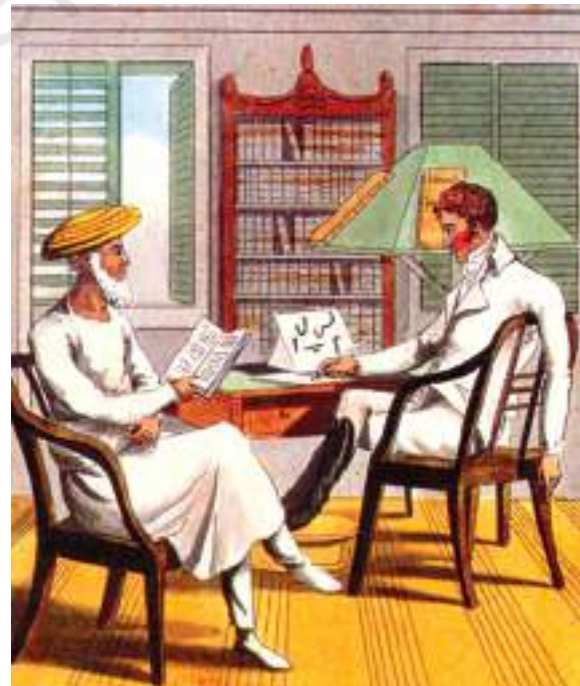
Fig. 1 – William Jones learning Persian

In 1783, a person named William Jones arrived in Calcutta. He had an appointment as a junior judge at the Supreme Court that the Company had set up. In addition to being an expert in law, Jones was a linguist . He had studied Greek and Latin at Oxford, knew French and English, had picked up Arabic from a friend, and had also learnt Persian. At Calcutta, he began spending many hours a day with pandits who taught him the subtleties of Sanskrit language, grammar and