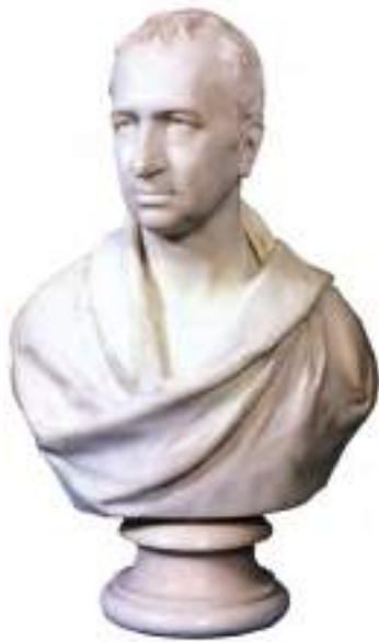
Fig. 2 – Henry Thomas Colebrooke

He was a scholar of Sanskrit and ancient sacred writings of Hinduism.