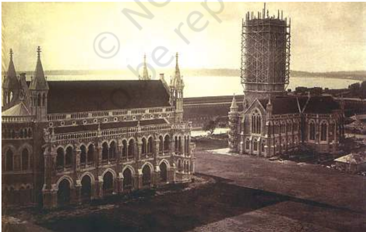
Fig. 5 – Bombay University in the nineteenth century

We must emphatically declare that the education which we desire to see extended in India is that which has for its object the diffusion of the improved arts, services, philosophy, and literature of Europe, in short, European knowledge.