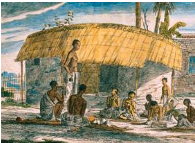
Fig. 8 – A village pathshala This is a painting by a Dutch painter, Francois Solvyn, who came to India in the late eighteenth century. He tried to depict the everyday life of people in his paintings.

Adam discovered that this flexible system was suited to local needs. For instance, classes were not held during harvest time when rural children often worked in the fields. The pathshala started once again when the crops had been cut and stored. This meant that even children of peasant families could study.