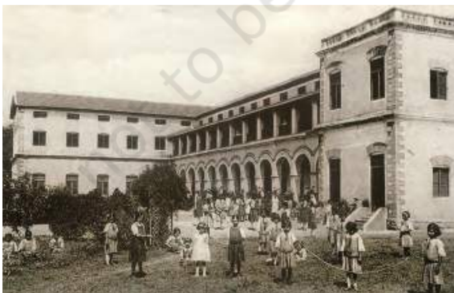
Fig. 12 – Children playing in a missionary school in Coimbatore, early twentieth century

Many individuals and thinkers were thus thinking about the way a national educational system could be fashioned. Some wanted changes within the system set up by the British, and felt that the system could be extended so as to include wider sections of people. Others urged that alternative systems be created so that people were educated into a culture that was truly national. Who was to define what was truly national? The debate about what this “national education” ought to be continued till after independence.