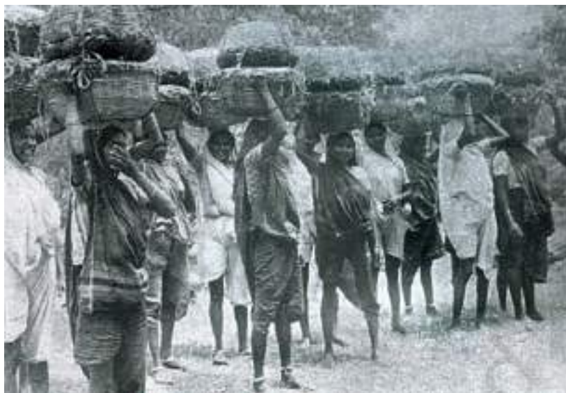
Fig. 11 – Dublas of Gujarat carrying mangoes to the market.

Dublas laboured for upper-caste landowners, cultivating their fields, and working at a variety of odd jobs at the landlord’s house.