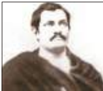
Fig. 16 – Keshub Chunder Sen – one of the main leaders of the Brahmo Samaj