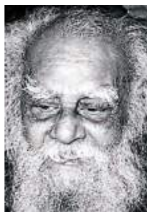
Fig. 15 – E.V. Ramaswamy Naicker (Periyar)

These assertions did not go unchallenged. The forceful speeches, writings and movements of lower-caste leaders did lead to rethinking and some self-criticism among upper-caste nationalist leaders. But orthodox Hindu society also reacted by founding Sanatan Dharma Sabhas and the Bharat Dharma Mahamandal in the north, and associations like the Brahman Sabha in Bengal. The object of these associations was to uphold caste distinctions as a cornerstone of Hinduism, and show how this was sanctified by scriptures. Debates and struggles over caste continued beyond the colonial period and are still going on in our own times.