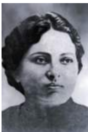
Fig. 7 Pandita Ramabai

By the 1880s, Indian women began to enter universities. Some of them trained to be doctors, some became teachers. Many women began to write and publish their critical views on the place of women in society. Tarabai Shinde, a woman educated at home at Poona, published a book, Stripurushtulna , (A Comparison between Women and Men), criticising the social differences between men and women.