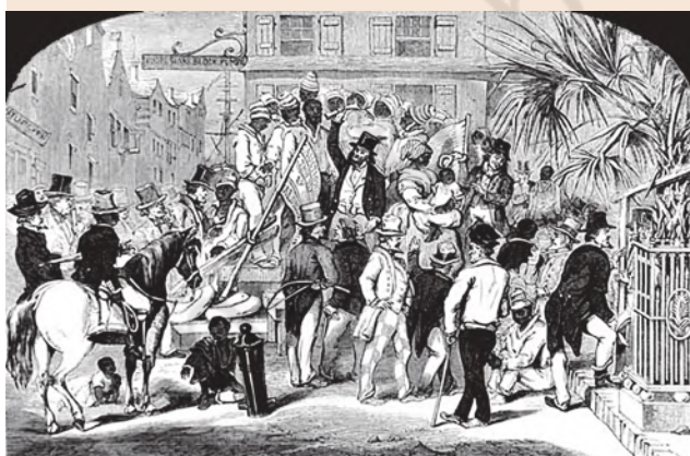
Fig. 21 – Slave Sale, South Carolina, USA, 1856

From the time that European explorers and traders landed in Africa in the seventeenth century, a trade in slaves began. Black people were captured and brought from Africa to America, sold to white planters, and made to work on cotton and other plantations – most of them in the southern United States. In the plantations they had to work long hours, typically from dawn to dusk, punished for “inefficient work”, and whipped and tortured.