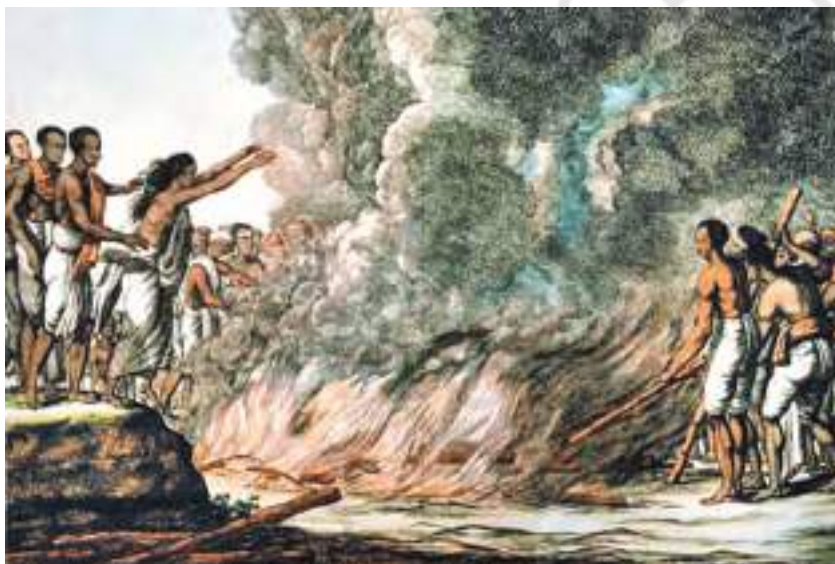
Fig. 1 – Sati, painted by Balthazar Solvyn, 1813

Two hundred years ago things were very different. Most children were married off at an early age. Both Hindu and Muslim men could marry more than one wife. In some parts of the country, widows were praised if they