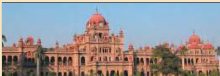
Fig. 20 – Khalsa College, Amritsar, established in 1892 by the leaders of the Singh Sabha movement

Reform organisations of the Sikhs, the first Singh Sabhas were formed at Amritsar in 1873 and at Lahore in 1879. The Sabhas sought to rid Sikhism of superstitions, caste distinctions and practices seen by them as non-Sikh. They promoted education among the Sikhs, often combining modern instruction with Sikh teachings.