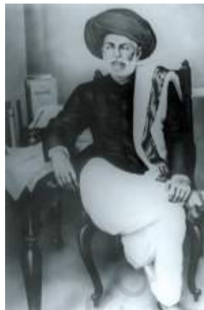
Fig. 13 – Jyotirao Phule

Phule claimed that before Aryan rule there existed a golden age when warrior-peasants tilled the land and ruled the Maratha countryside in just and fair ways. He proposed that Shudras (labouring castes) and Ati Shudras (untouchables) should unite to challenge caste discrimination. The Satyashodhak Samaj, an association Phule founded, propagated caste equality.