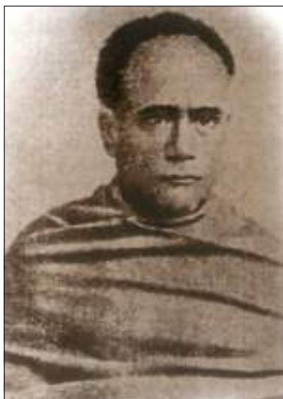
Fig. 5 Ishwarchandra Vidyasagar