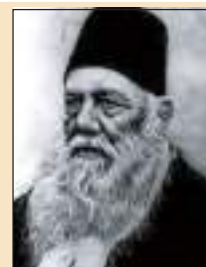
Fig. 19 Sayyid Ahmed Khan

The Mohammedan Anglo-Oriental College, founded by Sayyid Ahmed Khan in 1875 at Aligarh, later became the Aligarh Muslim University. The institution offered modern education, including Western science, to Muslims. The Aligarh Movement, as it was known, had an enormous impact in the area of educational reform.