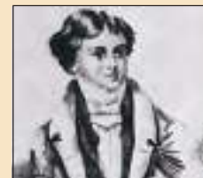
Fig. 17 Henry Derozio

Henry Louis Vivian Derozio, a teacher at Hindu College, Calcutta, in the 1820s, promoted radical ideas and encouraged his pupils to question all authority. Referred to as the Young Bengal Movement, his students attacked tradition and custom, demanded education for women and campaigned for the freedom of thought and expression.