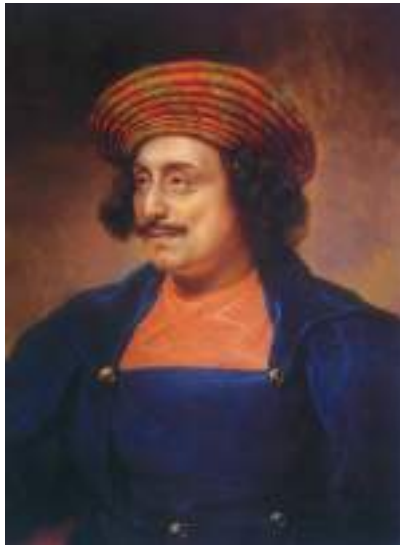
Fig. 2 – Raja Rammohun Roy, painted by Rembrandt Peale, 1833

Rammohun Roy was keen to spread the knowledge of Western education in the country and bring about greater freedom and equality for women. He wrote about the way women were forced to bear the burden of domestic work, confined to the home and the kitchen, and not allowed to move out and become educated.