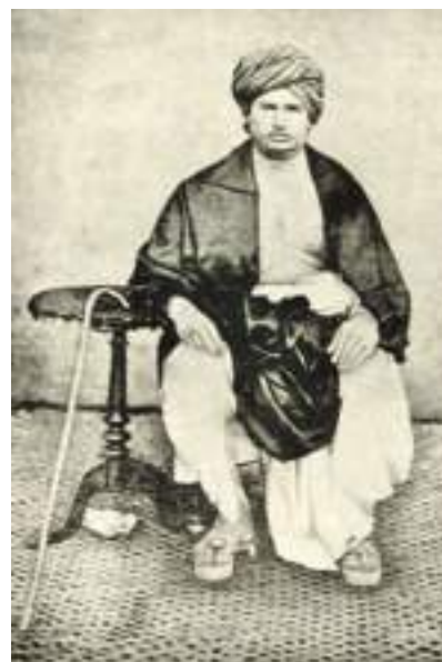
Fig. 4 – Swami Dayanand Saraswati

Yet, the number of widows who actually remarried remained low. Those who married were not easily accepted in society and conservative groups continued to oppose the new law.