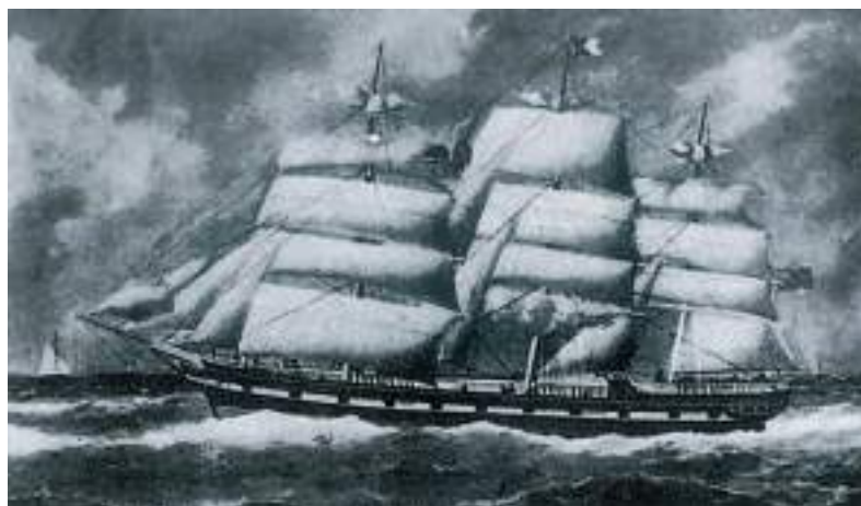
Fig. 9 – A coolie ship, nineteenth century

the expansion of cities in Chapter 6. Think of the new demands of labour this created. Drains had to be dug, roads laid, buildings constructed, and cities cleaned. This required coolies, diggers, carriers, bricklayers, sewage cleaners, sweepers, palanquin bearers, rickshaw pullers. Where did this labour come from? The poor from the villages and small towns, many of them from low castes, began moving to the cities where there was a new demand for labour. Some also went to work in plantations in Assam, Mauritius, Trinidad and Indonesia. Work in the new locations was often very hard. But the poor, the people from low castes, saw this as an opportunity to get away from the oppressive hold that upper-caste landowners exercised over their lives and the daily humiliation they suffered.