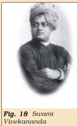
Fig. 18 Swami Vivekananda