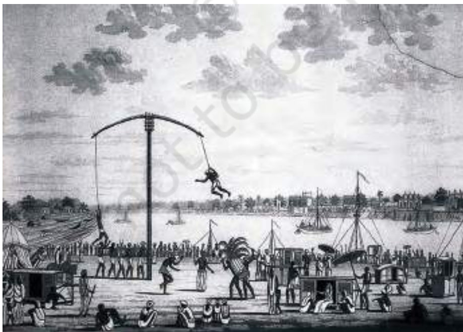
Fig. 3 – Hook swinging festival

The strategy adopted by Rammohun was used by later reformers as well. Whenever they wished to challenge a practice that seemed harmful, they tried to find a verse or sentence in the ancient sacred texts that supported their point of view. They then suggested that the practice as it existed at present was against early tradition.