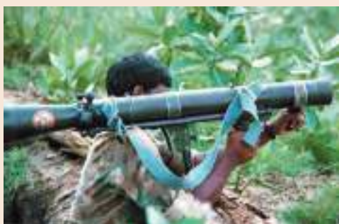
Fig. 12 – Gun-carrying Tamil militant – a symbol of the civil war in Sri Lanka

In 1956, the year the states of India were reorganised on the basis of language, the Parliament of Sri Lanka (then Ceylon) introduced an Act recognising Sinhala as the sole official language of the country. This made Sinhala the medium of instruction in all state schools and colleges, in public examinations, and in the courts. The new Act was opposed by the Tamil-speaking minority who lived in the north of the island. "When you deny me my language," said one Tamil MP, "you deny me everything." "You are hoping for a divided Ceylon," warned another, adding: "Do not fear, I assure you [that you] will have a divided Ceylon." An Opposition member, himself Sinhala speaking, predicted that if the government did not change its mind and insisted on the Act being passed, "two torn little bleeding states might yet arise out of one little state".