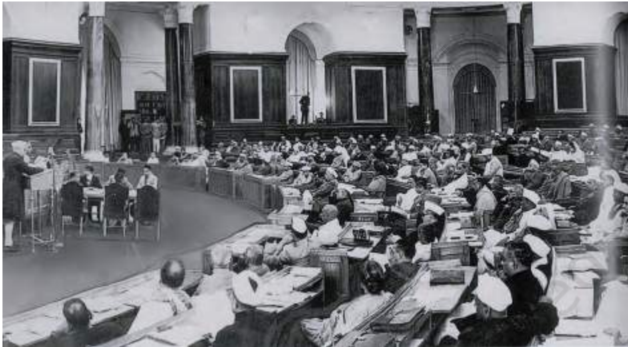
Fig. 2 – Jawaharlal Nehru introducing the resolution that outlined the objectives of the Constitution

the United States, this right had been granted in stages. First only men of property had the vote. Then men who were educated were also added on. Working-class men got the vote only after a long struggle. Finally, after a bitter struggle of their own, American and British women were granted the vote. On the other hand, soon after Independence, India chose to grant this right to all its citizens regardless of gender, class or education.