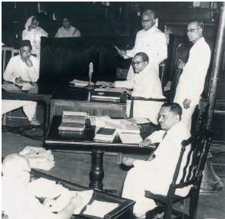
Fig. 3 – Dr B.R. Ambedkar Dr. B.R. Ambedkar (1891-1956), respectfully referred to as Babasaheb, belonged to a Marathi-speaking dalit family. A lawyer and economist, he is best known as a revered leader of the Dalits and the father of the Indian Constitution

“the initial responsibility for the well-being of the people of the provinces should rest with the Provincial Governments”.