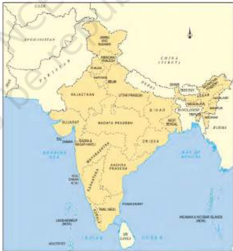
Fig. 5 (c) – Indian States in 1975

Activity Look at Figs. 5 (a), 5 (b) and 5 (c). Notice how the Princely States disappear in 5 (b). Identify the new states that were formed in 1956 and later and the languages of these states.