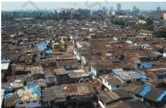
Fig. 11 – Dharavi in Bombay is one of the world's largest slums. Notice the high-rise buildings in the background.

The Constitution recognises equality before the law, but in real life some Indians are more equal than others. Judged by the standards it set itself at Independence, the Republic of India has not been a great success. But it has not been a failure either.