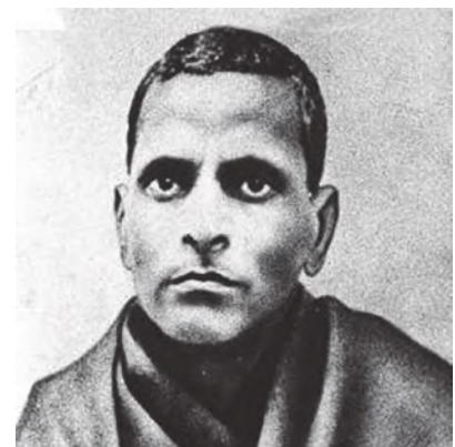
Fig. 4 – Potti Sriramulu, the Gandhian leader who died fasting for a separate state for Telugu speakers