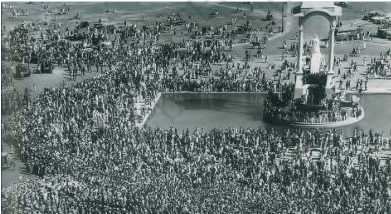
Fig. 1 – Mahatma Gandhi's ashes being immersed in Allahabad, February 1948

When India became independent in August 1947, it faced a series of very great challenges. As a result of Partition, 8 million refugees had come into the country from what was now Pakistan. These people had to be found homes and jobs. Then there was the problem of the princely states, almost 500 of them, each ruled by a maharaja or a nawab, each of whom had to be persuaded to join the new nation. The problems of the refugees and of the princely states had to be addressed immediately. In the longer term, the new nation had to adopt a political system that would best serve the hopes and expectations of its population.