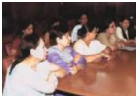
The above photo shows a few women Members of Parliament.

Why do you think there are so few women in Parliament? Discuss.