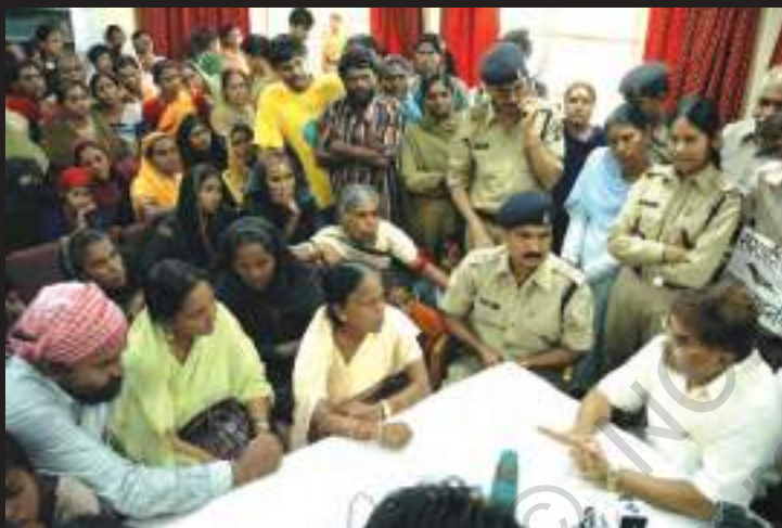
Gas victims with the Gas Relief Minister

Despite the overwhelming evidence pointing to UC as responsible for the disaster, it refused to accept responsibility.