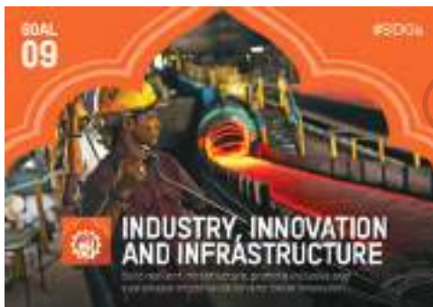
Sustainable Development Goal (SDG) www.in.undp.org

In 1984, there were very few laws protecting the environment in India, and there was hardly any enforcement of these laws. The environment was treated as a 'free' entity and any industry could pollute the air and water without any restrictions. Whether it was our rivers, air, groundwater - the environment was being polluted and the health of people disregarded.