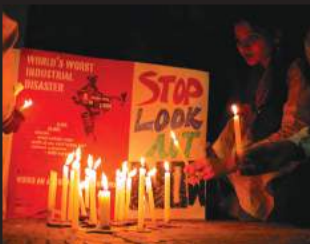
The struggle for justice goes on...

24 years later, people are still fighting for justice: for safe drinking water, for health-care facilities and jobs for the people poisoned by UC. They also demand that Anderson, the UC chairman who faces criminal charges, be prosecuted.