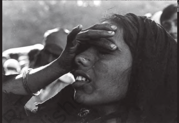
The next morning