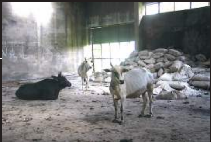
Bags of chemicals lie strewn around the UC plant

UC stopped its operations, but left behind tons of toxic chemicals. These have seeped into the ground, contaminating water. Dow Chemical, the company who now owns the plant, refuses to take responsibility for clean up.