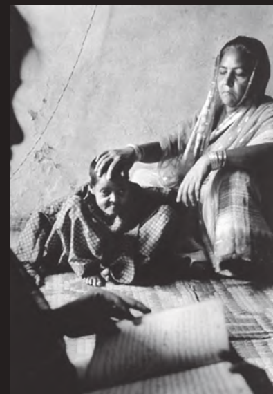
A child severely affected by the gas

Within three days, more than 8,000 people were dead. Hundreds of thousands were maimed.