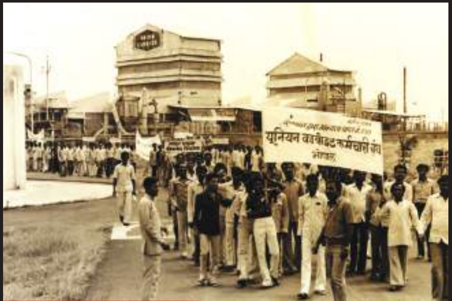
Members of UC Employees Union protesting

The disaster was not an accident. UC had deliberately ignored the essential safety measures in order to cut costs. Much before the Bhopal disaster, there had been incidents of gas leak killing a worker and injuring several.