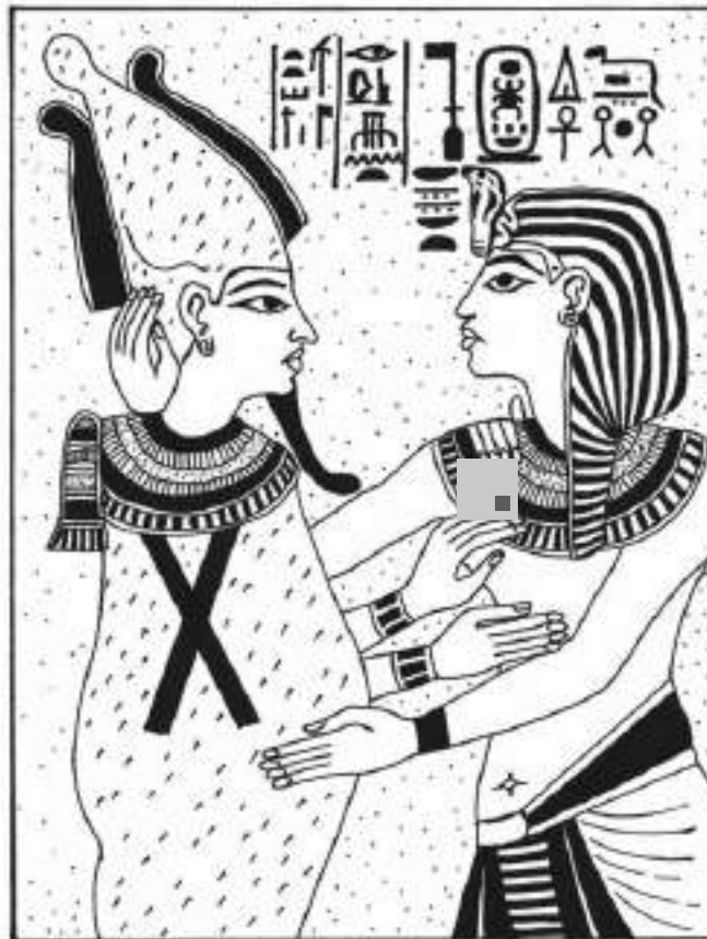
Mural in King Tut's tomb showing King Tut with Osiris, the god of the afterlife

Back in the trailer a technician pulled up astonishing images of Tut on a computer screen. A grey head took shape from a scattering of pixels, and the technician spun and tilted it in every direction. Neck vertebrae appeared as clearly as in an anatomy class. Other images revealed a hand, several views of the rib cage, and a transection of the skull. But for now the pressure was off. Sitting back in his chair, Zahi Hawass smiled, visibly relieved that nothing had gone seriously wrong. "I didn't sleep last night, not for a second," he said. "I was so worried. But now I think I will go and sleep."