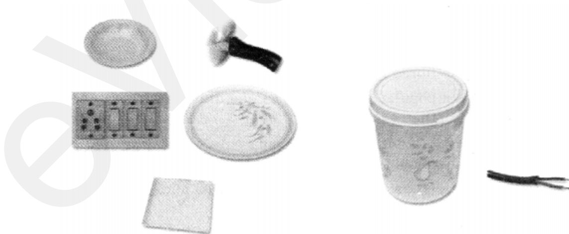
Articles made of thermosetting plastics