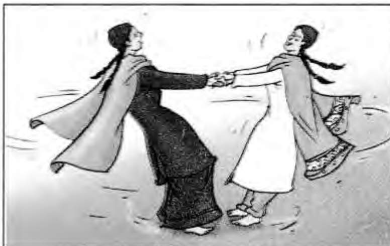
Two girls pulling each other