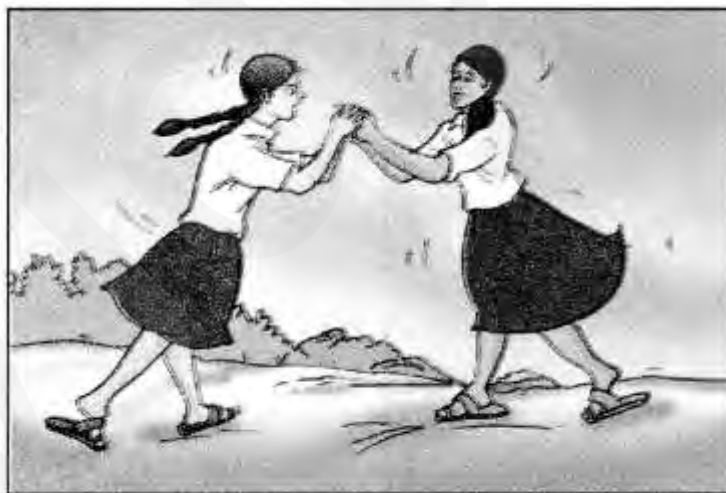
Two girls pushing each other