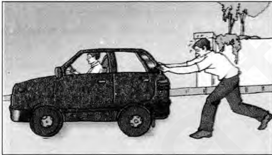
A car being pushed by a man

Force arises due to the interaction between at least two objects.