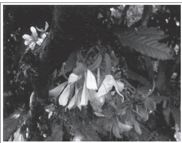
Figure 14.3 : Humboldtia decurrens Bedd — highly rare endemic tree of Southern Western Ghats (India)

There is an urgent need to educate people to adopt environment-friendly practices and reorient their activities in such a way that our development is harmonious with other life forms and is sustainable. There is an increasing consciousness of the fact that such conservation with sustainable use is possible only with the involvement and cooperation of local communities and individuals. For this, the development of institutional structures at local levels is necessary. The critical problem is not merely the conservation of species nor the habitat but the continuation of process of conservation.