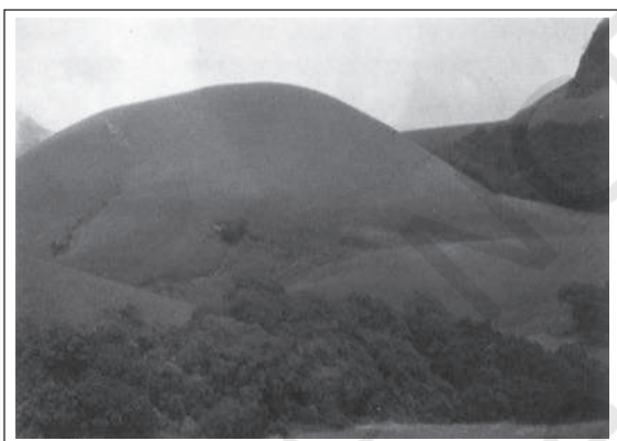
Figure 14.1 : Grasslands and sholas in Indira Gandhi National Park, Annamalai, Western Ghats — an example of ecosystem diversity

You have studied about the ecosystem in the earlier chapter. The broad differences between ecosystem types and the diversity of habitats and ecological processes occurring within each ecosystem type constitute the ecosystem diversity. The 'boundaries' of communities (associations of species) and ecosystems are not very rigidly defined. Thus, the demarcation of ecosystem boundaries is difficult and complex.