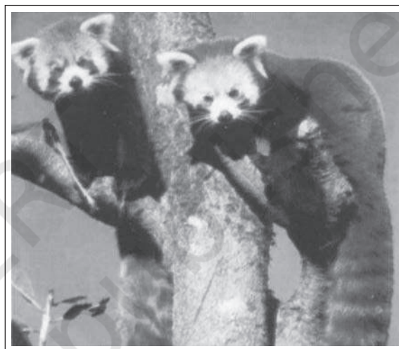
Figure 14.2 : Red Panda — an endangered species

It includes those species which are in danger of extinction. The IUCN publishes information about endangered species world-wide as the Red List of threatened species.