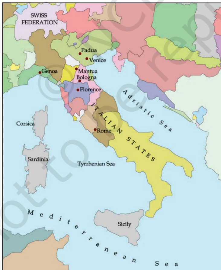
MAP 1: The Italian States

With the expansion of trade between the Byzantine Empire and the Islamic countries, the ports on the Italian coast revived. From the twelfth century, as the Mongols opened up trade with China via the Silk Route (see Theme 5) and as trade with western European countries