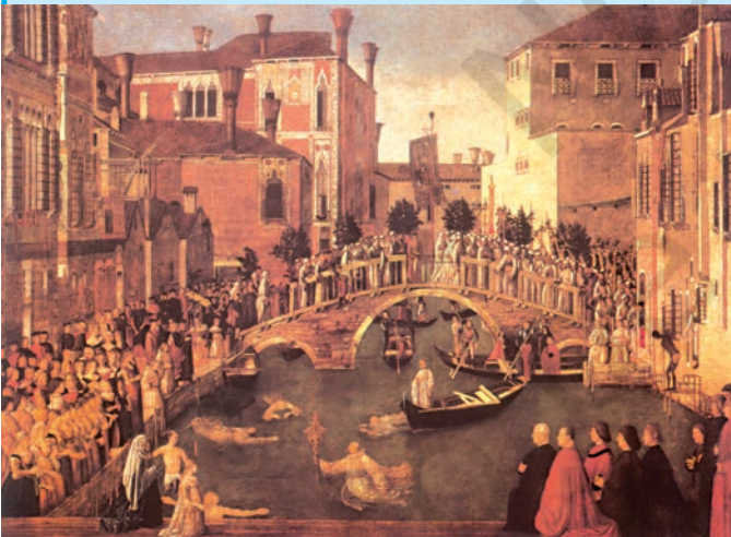
G. Bellini's The Recovery of the Relic of the Holy Cross was painted in 1500, to recall an event of 1370, and is set in fifteenth-century Venice.

Now first I am to yield you a reckoning how and with what wisdom it was ordained by our ancestors, that the common people should not be admitted into