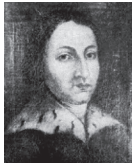
Self-portrait by Copernicus.

Celestial means divine or heavenly, while terrestrial implies having a worldly quality.