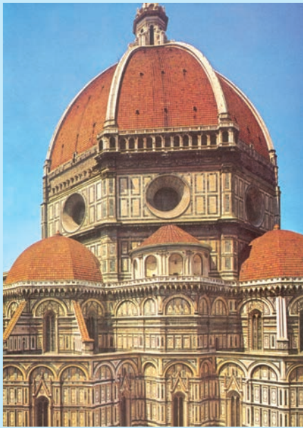
The Duomo, the dome of Florence cathedral designed by Brunelleschi.

Another remarkable change was that from this time, artists were known individually, by name, not as members of a group or a guild, as earlier.