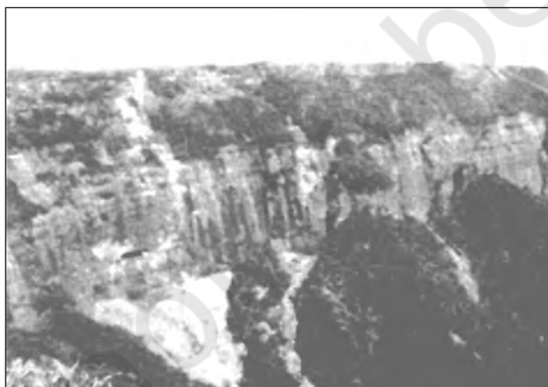
Figure 2.5 : A Part of Peninsular Plateau

Rising from the height of 150 m above the river plains up to an elevation of 600-900 m is the irregular triangle known as the Peninsular plateau. Delhi ridge in the northwest, (extension of Aravalis), the Rajmahal hills in the east, Gir range in the west and the Cardamom hills in the south constitute the outer extent of the Peninsular plateau. However, an extension of this is also seen in the northeast, in the form of Shillong and Karbi-Anglong plateau. The Peninsular India is made up of a series of patland plateaus such as the Hazaribagh