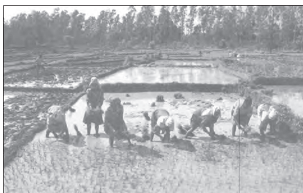
Figure 2.4 : Northern Plain

The south of Tarai is a belt consisting of old and new alluvial deposits known as the Bhangar and Khadar respectively. These plains have characteristic features of mature stage of fluvial erosional and depositional landforms such as sand bars, meanders, oxbow lakes and braided channels. The Brahmaputra plains are known for their riverine islands and sand bars. Most of these areas are subjected to periodic floods