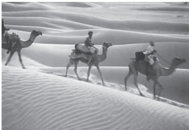
Figure 2.6 : The Indian Desert

Can you identify the type of sand dunes shown in this picture?