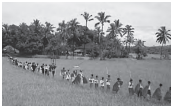
Figure 2.7 : Coastal Plains

As compared to the western coastal plain, the eastern coastal plain is broader and is an example of an emergent coast. There are well-developed deltas here, formed by the rivers flowing eastward in to the Bay of Bengal. These include the deltas of the Mahanadi, the Godavari, the Krishna and the Kaveri. Because of its emergent nature, it has less number of ports and harbours. The continental shelf extends up to 500 km into the sea, which makes it difficult for the development of good ports and harbours. Name some ports on the eastern coast.