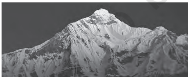
Figure 2.3 : The Himalayas

Himalayas are not only the physical barrier, they are also a climatic, drainage and cultural divide. Can you identify the impact of Himalayas on the geoenvironment of the countries of South Asia? Can you find some other examples of similar geoenvironmental divide in the world?