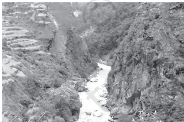
Figure 2.1 : A Gorge

The Himalayas along with other Peninsular mountains are young, weak and flexible in their geological structure unlike the rigid and stable Peninsular Block. Consequently, they are still subjected to the interplay of exogenic and endogenic forces, resulting in the development of faults, folds and thrust plains. These