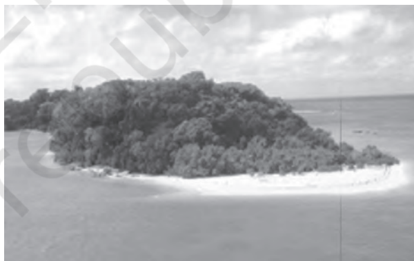
Figure 2.8 : An Island

The islands of the Arabian sea include Lakshadweep and Minicoy. These are scattered between 8° N-12° N and 71° E -74° E longitude. These islands are located at a distance of 280 km-480 km off the Kerala coast. The entire island group is built of coral deposits. There are approximately 36 islands of which 11 are inhabited. Minicoy is the largest island with an area of 453 sq. km. The entire group of islands is broadly divided by the Ten degree channel, north of which is the Amini Island and to the south of the Canannore Island. The Islands of this archipelago have storm beaches consisting of unconsolidated pebbles, shingles, cobbles and boulders on the eastern seaboard.