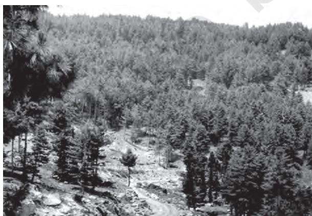
Figure 5.5 : Montane Forests

The Himalayan ranges show a succession of vegetation from the tropical to the tundra, which change in with the altitude. Deciduous forests are found in the foothills of the Himalayas. It is succeeded by the wet temperate type of forests between an altitude of 1,000-2,000 m. In the higher hill ranges of northeastern India, hilly areas of West Bengal and Uttaranchal, evergreen broad leaf trees such as oak and chestnut are predominant. Between 1,500-1,750 m, pine forests are also well-developed in this zone, with Chir Pine as a very useful commercial tree. Deodar, a highly valued endemic species grows mainly in the western part of the Himalayan range. Deodar is a durable wood mainly used in construction activity. Similarly, the chinar and the walnut, which sustain the famous Kashmir handicrafts, belong to this zone. Blue pine and spruce appear at altitudes of 2,225-3,048 m. At many places in this zone, temperate grasslands are also found. But in the higher reaches there is a transition to Alpine forests and pastures. Silver firs, junipers, pines, birch and rhododendrons, etc. occur between 3,000-4,000 m. However, these pastures are used extensively for transhumance by tribes like the Gujjars, the Bakarwals, the Bhotiyas and the Gaddis. The southern slopes of the Himalayas carry a thicker vegetation cover because of relatively higher precipitation than the drier north-facing slopes. At higher altitudes, mosses and lichens form part of the tundra vegetation.