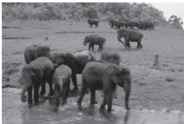
Figure 5.7 : Elephants in their Natural Habitat

For the purpose of effective conservation of flora and fauna, special steps have been initiated by the Government of India in