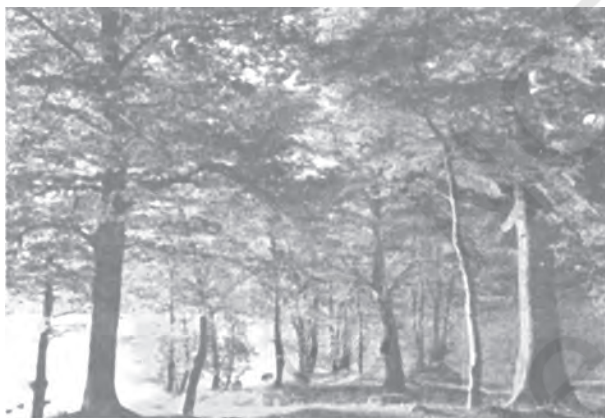
Figure 5.3 : Deciduous Forests

These are the most widespread forests in India. They are also called the monsoon forests. They spread over regions which receive rainfall between 70-200 cm. On the basis of the availability of water, these forests are further divided into moist and dry deciduous.