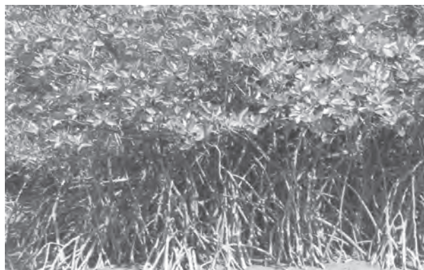
Figure 5.6 : Mangrove Forests

They consist of a number of salt-tolerant species of plants. Crisscrossed by creeks of stagnant water and tidal flows, these forests give shelter to a wide variety of birds.