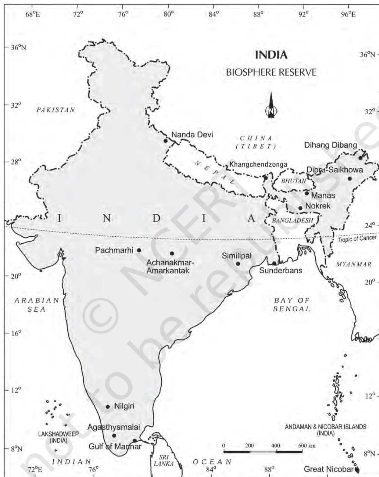
Figure 5.8 : India : Biosphere Reserves