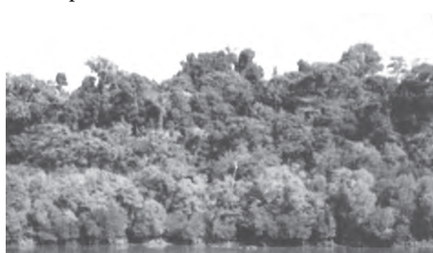
Figure 5.1 : Evergreen Forest

The semi evergreen forests are found in the less rainy parts of these regions. Such forests have a mixture of evergreen and moist deciduous trees. The undergrowing climbers provide an evergreen character to these forests. Main species are white cedar, hollock and kail.