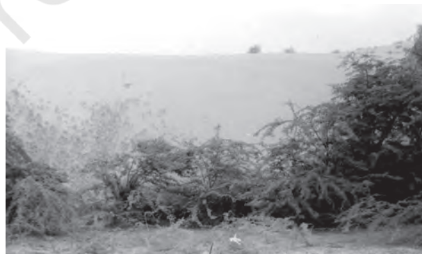
Figure 5.4 : Tropical Thorn Forests

Tropical thorn forests occur in the areas which receive rainfall less than 50 cm. These consist of a variety of grasses and shrubs. It includes semi-arid areas of south west Punjab, Haryana, Rajasthan, Gujarat, Madhya Pradesh and Uttar Pradesh. In these forests, plants remain leafless for most part of the year and give an expression of scrub vegetation. Important species found are babool , ber , and wild date palm, khair , neem , khejri , palas , etc. Tussocky grass grows upto a height of 2 m as the under growth.