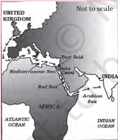
Fig.1.2 Suez Canal: Used as highway between India and Britain

Various details about the population of British India were first collected through a census in 1881. Though suffering from certain limitations, it revealed the unevenness in India's population growth. Subsequently,