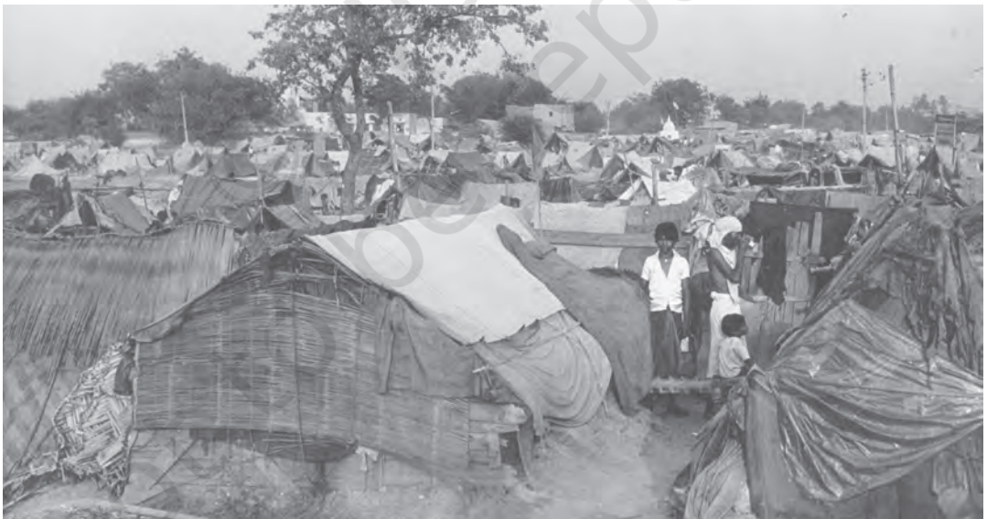
Fig. 1.3 A large section of India's population did not have basic needs such as housing

During the colonial period, the occupational structure of India, i.e., distribution of working persons across different industries and sectors, showed little sign of change. The agricultural sector accounted for