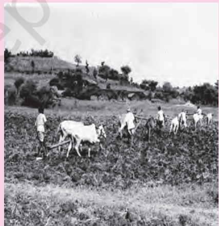
Fig. 1.1 India's agricultural stagnation under the British colonial rule

The French traveller, Bernier, described seventeenth century Bengal in the following way: "The knowledge I have acquired of Bengal in two visits inclines me to believe that it is richer than Egypt. It exports, in abundance, cottons and silks, rice, sugar and butter. It produces amply — for its own consumption — wheat, vegetables, grains, fowls, ducks and geese. It has immense herds of pigs and flocks of sheep and goats. Fish of every kind it has in profusion. From rajmahal to the sea is an endless number of canals, cut in bygone ages from the Ganges by immense labour for navigation and irrigation."