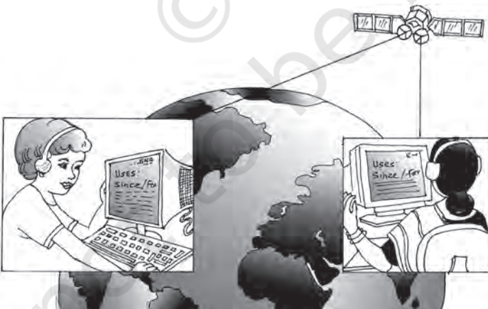
Fig. 3.1 Outsourcing: a new employment opportunity in big cities

global trade organisation to administer all multilateral trade agreements by providing equal opportunities to all countries in the international market for trading purposes. WTO is expected to establish a rule-based trading regime in which nations cannot place arbitrary restrictions on trade. In addition, its purpose is also to enlarge