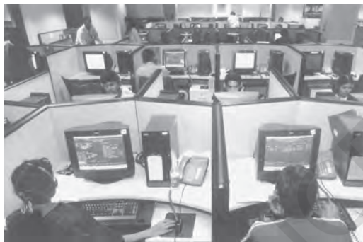
Fig. 3.2 IT industry is seen as a major contributor to India's exports

Some scholars question the usefulness of India being a member of the WTO as a major volume of international trade occurs among the developed nations. They also say that while developed countries file complaints over agricultural subsidies given in their countries, developing countries feel cheated as they are forced to open their markets for developed countries but are not allowed access to the markets of developed countries. What do you think?