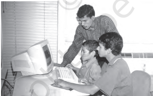
Fig. 4.4 Job on hand: transforming India into a knowledge economy

workforce, particularly involving mathematics, computer science, and data science, in conjunction with multidisciplinary abilities across the sciences and social sciences, and humanities, will be increasingly in greater demand. With climate change, increasing pollution, and depleting natural resources, there will be a sizeable shift in how we meet the world's energy, water, food, and sanitation needs, again resulting in the need for new skilled labour, particularly in biology, chemistry, physics, agriculture, climate science, and social science. The growing emergence of epidemics and pandemics will also call for collaborative research in infectious disease management and development of vaccines and the resultant social issues heightens the need for multidisciplinary learning. There will be a growing demand for humanities and art, as India moves towards becoming a developed country as well as