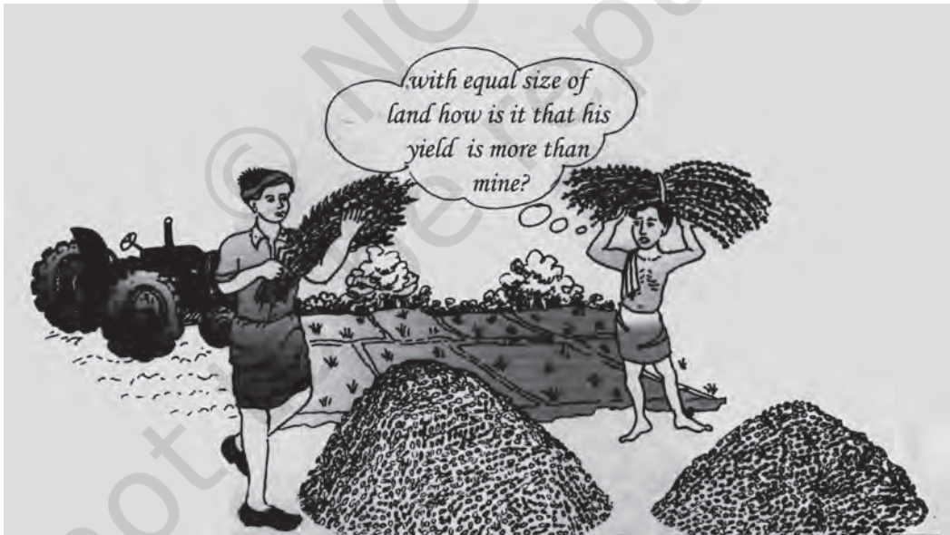
Fig. 4.1 Adequate education and training to farmers can raise productivity in farms

Education is sought not only as it confers higher earning capacity on people but also for its other highly valued benefits: it gives one a better social standing and pride; it enables one to make better choices in life; it provides knowledge to understand the changes taking place in society; it also stimulates innovations. Moreover, the availability of educated labour force facilitates adaptation of new