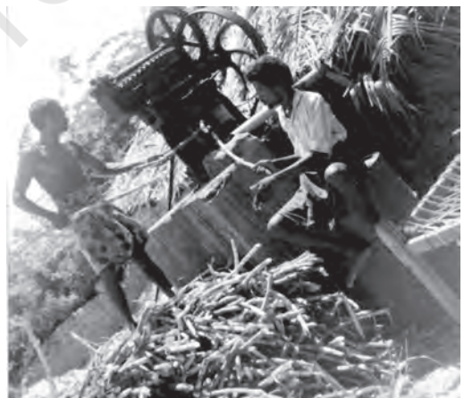
Fig. 5.2 Jaggery making is an allied activity of the farming sector

greater risk in depending exclusively on farming for livelihood. Diversification towards new areas is necessary not only to reduce the risk from agriculture sector but also to provide productive sustainable livelihood options to rural people. Much of the agricultural employment activities are concentrated in the Kharif season. But during the Rabi season, in areas where there are inadequate irrigation facilities, it becomes difficult to find gainful employment. Therefore expansion into other sectors is essential to provide supplementary gainful employment and in realising higher levels of income for rural people to overcome poverty and other tribulations. Hence, there is a need to focus on allied activities, non-farm employment and other emerging alternatives of livelihood, though there are many other options available for providing sustainable livelihoods in rural areas.