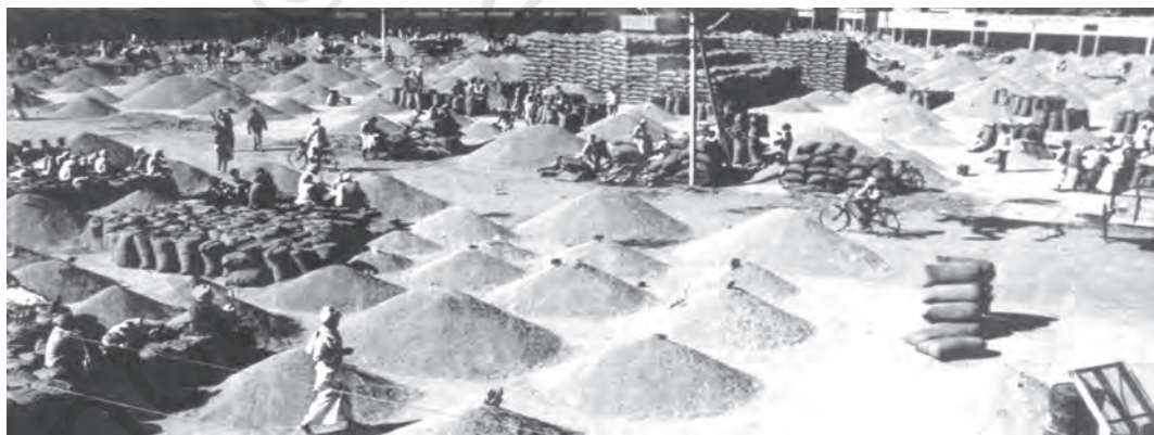
Fig. 5.1 Regulated market yards benefit farmers as well as consumers

Let us discuss four such measures that were initiated to improve the marketing aspect. The first step was regulation of markets to create orderly and transparent marketing conditions. By and large, this policy benefited farmers as well as consumers. However, there is still a need to develop about 27,000 rural periodic markets as regulated market places to realise the full potential of rural markets. Second component is provision of physical infrastructure facilities like roads, railways, warehouses, godowns, cold storages and processing units. The current infrastructure facilities are quite inadequate to meet the growing demand and need to be improved. Cooperative