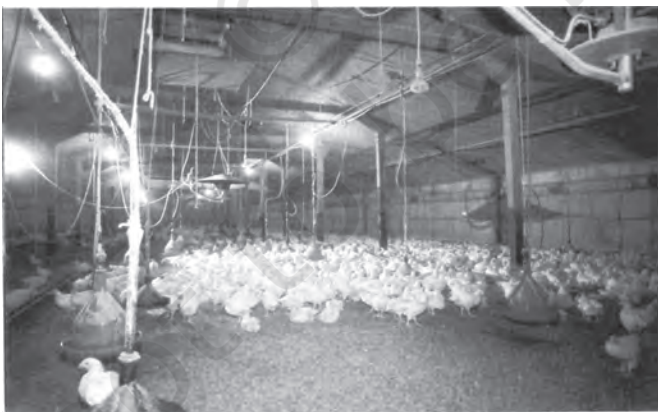
Fig. 5.4 Poultry has the largest share of total livestock in India

However problems related to over-fishing and pollution need to be regulated