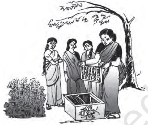
Fig. 5.5 Women in rural households take up beekeeping as an entrepreneurial activity

Horticulture: Blessed with a varying climate and soil conditions, India has adopted growing of diverse horticultural crops such as fruits, vegetables, tuber crops, flowers, medicinal and aromatic plants, spices and plantation crops. These crops play a vital role in providing food and nutrition, besides addressing employment concerns. Horticulture sector contributes nearly one-third of the value of agriculture output and six per cent of Gross Domestic Product of India. India has emerged as a world leader in producing a variety of fruits like mangoes, bananas, coconuts, cashew nuts and a number of spices and is the second largest producer of fruits and vegetables. Economic condition of many farmers engaged in horticulture has improved and it has become a means of improving livelihood for many unprivileged classes. Flower harvesting, nursery