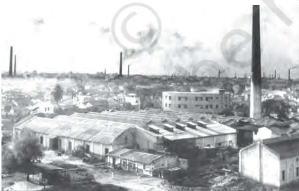
Fig. 7.2 Damodar Valley is one of India's most industrialised regions. Pollutants from the heavy industries along the banks of the Damodar river are converting it into an ecological disaster

But with population explosion and with the advent of industrial revolution to meet the growing needs of the expanding population, things changed. The result was that the demand for resources for both production and consumption went beyond the rate of regeneration of the resources; the pressure on the absorptive capacity of the environment increased tremendously — this trend continues even today. Thus what has happened is a reversal of supply-demand relationship for environmental quality — we are now faced with increased demand for environmental resources and services but their supply is limited due to overuse