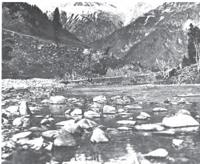
Fig. 7.1 Water bodies: small, snow-fed Himalayan streams are the few fresh-water sources that remain unpolluted.

this results in an environmental crisis. This is the situation today all over the world. The rising population of the developing countries and the affluent consumption and production standards of the developed world have placed a huge stress on the environment in terms of its first two functions. Many resources have become extinct and the wastes generated are beyond the absorptive capacity of the environment. Absorptive capacity means the ability of the environment to