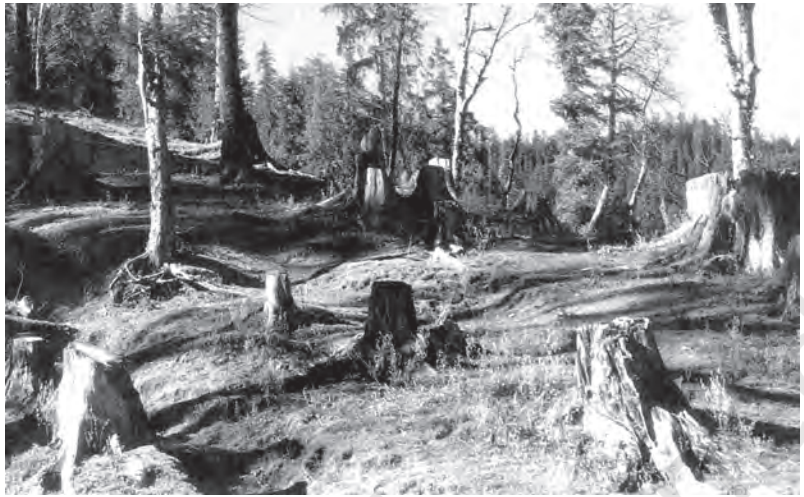
Fig. 7.3 Deforestation leads to land degradation, biodiversity loss and air pollution

India has abundant natural resources in terms of rich quality of soil, hundreds of rivers and tributaries, lush green forests, plenty of mineral deposits beneath the land surface, vast stretch of the Indian Ocean, ranges of mountains, etc. The black soil of the Deccan Plateau is particularly suitable for cultivation of cotton, leading to concentration of textile industries in this region. The Indo-Gangetic plains — spread from the Arabian Sea to the Bay of Bengal — are one of the most fertile, intensively cultivated and densely populated regions in the world. India's forests, though unevenly distributed, provide green cover for a majority of its population and natural cover for its wildlife. Large deposits of iron-ore, coal and natural gas are found in the country. India accounts for nearly 8 per cent of the world's total iron-ore reserves. Bauxite, copper, chromate, diamonds, gold, lead, lignite, manganese, zinc, uranium, etc. are also available in different parts of the country. However, the developmental activities in India have resulted in