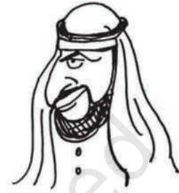
Sheikh Petrodollah King of the land of Black Gold

I value precious things. Bigoil says his President values freedom and democracy. So I keep both safely under lock and key in my land.