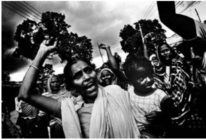
An entire community erupted in protests against a proposed open-cast coal mine project in Phulbari town, in the North-West district of Dinajpur, Bangladesh. Here several dozen women, one with her infant child, are chanting slogans against the proposed coal mine project in 2006.

are now being re-opened to MNCs through the liberalisation of the global economy. The mineral industry's extraction of earth, its use of chemicals, its pollution of waterways and land,