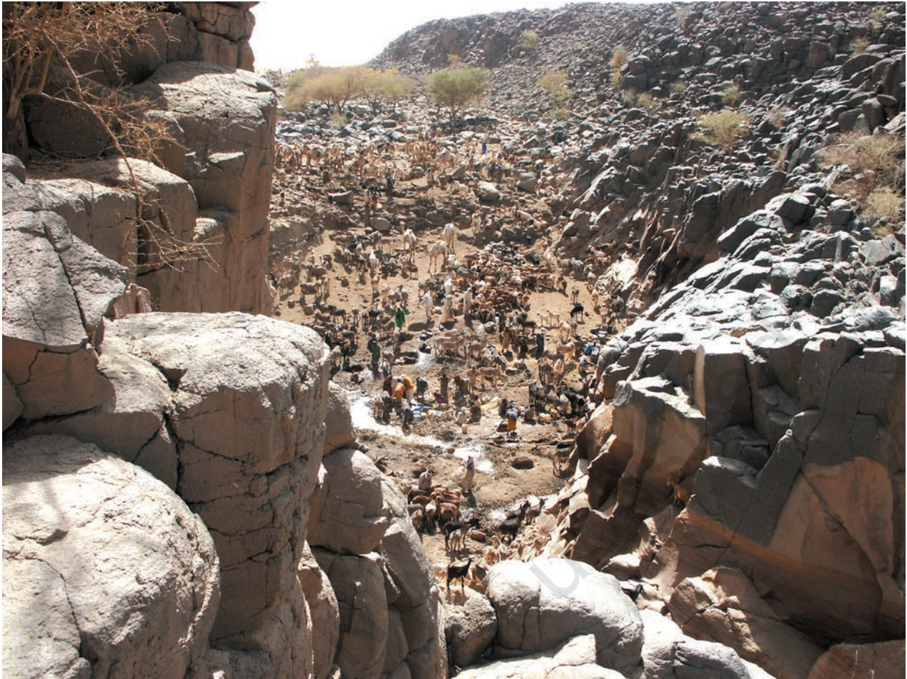
One of the biggest catastrophes in Africa in the 1970s, a drought turned the best cropland in five countries into cracked and barren earth. In fact, the term environmental refugees came into popular vocabulary after this. Many had to flee their homelands as agriculture was no longer possible.

basis of vague scientific evidence and time frames. In that sense the discovery of the ozone hole over the Antarctic in the mid-1980s revealed the opportunity as well as dangers inherent in tackling global environmental problems.