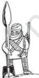
Errorists Loose cannonballs

Toppleton defends freedom and democracy. That's why he is so generous with guns and missiles. Like the ones he gave us to fight the invading Ruffians. He even trained us. We did not realise that it was the oil they were after. Bigoil is always trying to woo us. But we are too busy playing war games. Now we have rules of our own.