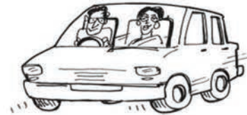
Mr & Mrs Gobbledoo

A new beauty is parked outside our garage. Awesome! Isn't it?... sleek chrome finish, power steering, automatic gears. Excellent pick up and great mileage too. It is low on emissions too...gentle on the atmosphere, you know. Global warming and all that stuff. Now we really are in hurry to zoom off and lead the good life...God Save Everyone!...vrrrrrooommmmm