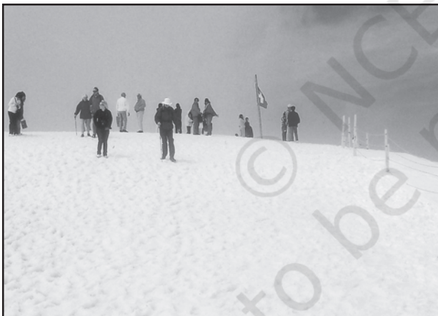
Fig. 6.5: Tourists skiing in the snow capped mountain slopes of Switzerland

Tourism is travel undertaken for purposes of recreation rather than business. It has become the world's single largest tertiary activity in total registered jobs (250 million) and total revenue (40 per cent of the total GDP). Besides, many local persons, are employed to provide services like accommodation, meals, transport, entertainment and special shops serving the tourists. Tourism fosters the growth of infrastructure industries, retail trading, and craft industries (souvenirs). In some regions, tourism is seasonal because the vacation period is dependent on favourable weather conditions, but many regions attract visitors all the year round.