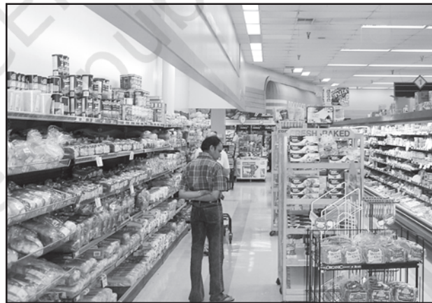
Fig. 6.3: Packed Food Market in U.S.A.

Urban marketing centres have more widely specialised urban services. They provide ordinary goods and services as well as many of the specialised goods and services required by people. Urban centres, therefore, offer manufactured goods as well as many specialised markets develop, e.g. markets for labour, housing, semi or finished products. Services of educational institutions and professionals such as teachers, lawyers, consultants, physicians, dentists and veterinary doctors are available.