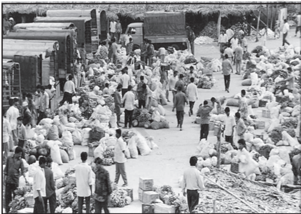
Fig. 6.2: A Wholesale Vegetable Market

Rural marketing centres cater to nearby settlements. These are quasi-urban centres. They serve as trading centres of the most rudimentary type. Here personal and professional services are not well-developed. These form local collecting and distributing centres. Most of these have mandis (wholesale markets) and also retailing areas. They are not urban centres per se but are significant centres for making available goods and services which are most frequently demanded by rural folk.