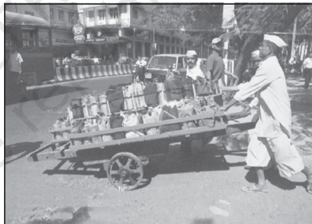
Fig. 6.4: Dabbawala Service in Mumbai

Personal services are made available to the people to facilitate their work in daily life. The workers migrate from rural areas in search of employment and are unskilled. They are employed in domestic services as housekeepers, cooks, and gardeners. This segment of workers is generally unorganised. One such example in India is Mumbai's dabbawala (Tiffin) service provided to about 1,75,000 customers all over the city.