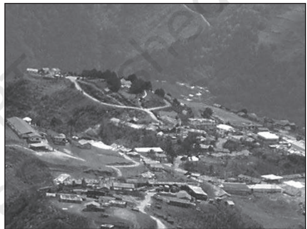
Fig. 2.2 : Semi-clustered settlements

Semi-clustered or fragmented settlements may result from tendency of clustering in a restricted area of dispersed settlement. More often such a pattern may also result from segregation or fragmentation of a large compact village. In this case, one or more sections of the village society choose or is forced to live a little away from the main cluster or village. In such cases, generally, the land-owning and dominant community occupies the central part of the main village, whereas people of lower strata of society and menial workers settle on the outer flanks of the village. Such settlements are widespread in the Gujarat plain and some parts of Rajasthan.