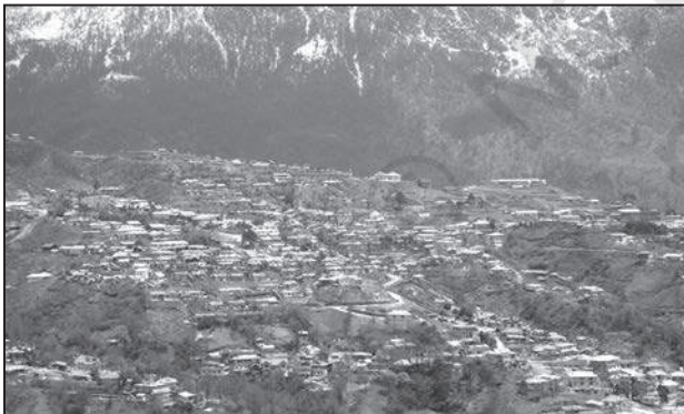
Fig. 2.1 : Clustered Settlements in the North-eastern states

The clustered rural settlement is a compact or closely built up area of houses. In this type of village the general living area is distinct and separated from the surrounding farms, barns and pastures. The closely built-up area and its