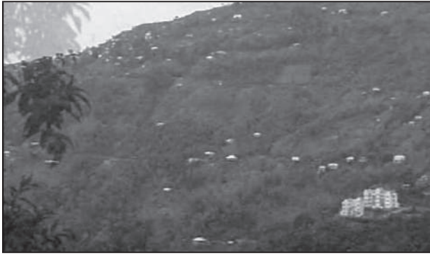
Fig. 2.3 : Dispersed settlements in Nagaland

with farms or pasture on the slopes. Extreme dispersion of settlement is often caused by extremely fragmented nature of the terrain and land resource base of habitable areas. Many areas of Meghalaya, Uttarakhand, Himachal Pradesh and Kerala have this type of settlement.