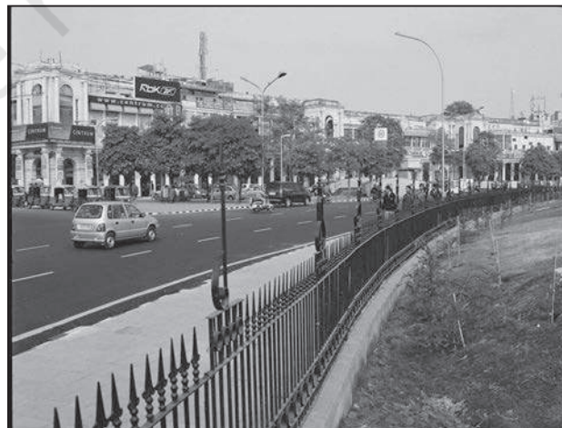
Fig. 2.4 : A view of the modern city

The British and other Europeans have developed a number of towns in India. Starting their foothold on coastal locations, they first developed some trading ports such as Surat, Daman, Goa, Pondicherry, etc. The British later consolidated their hold around three principal nodes – Mumbai (Bombay), Chennai (Madras), and Kolkata (Calcutta) – and built them in the British style. Rapidly