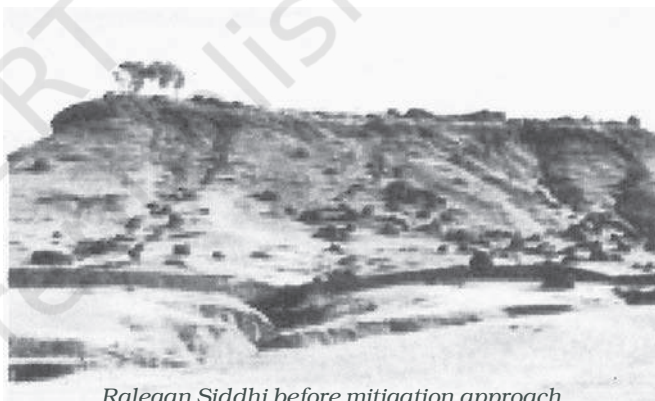
Ralegan Siddhi before mitigation approach

A Rs.22 lakh school building was constructed using only the resources of the village. No donations were taken. Money, if needed, was borrowed and paid back. The villagers took pride in this self-reliance. A new system of sharing labour grew out of this infusion of pride and voluntary spirit. People volunteered to help each other in agricultural operation. Landless labourers also