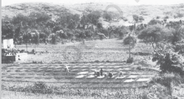
Ralegan Siddhi after mitigation approach

At present, water is adequate; agriculture is flourishing, though the use of fertilisers and pesticides is very high. The prosperity also brings the question of ability of the present generation to carry on the work after the leader of the movement who declared that, "The process of Ralegan's evolution to an ideal village will not stop. With changing times, people tend to evolve new ways. In future, Ralegan might present a different model to the country."