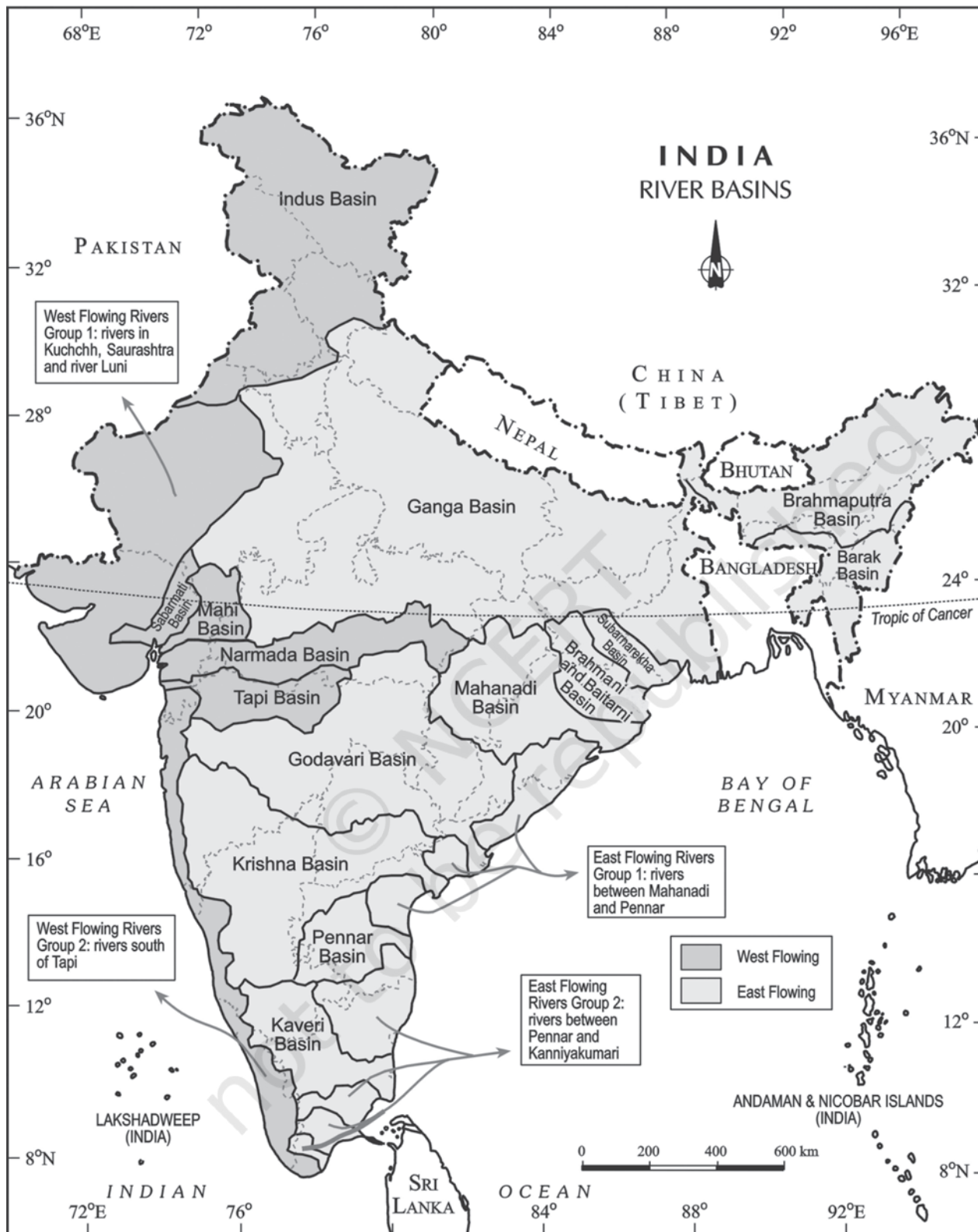
Fig. 4.1 : India – River Basins