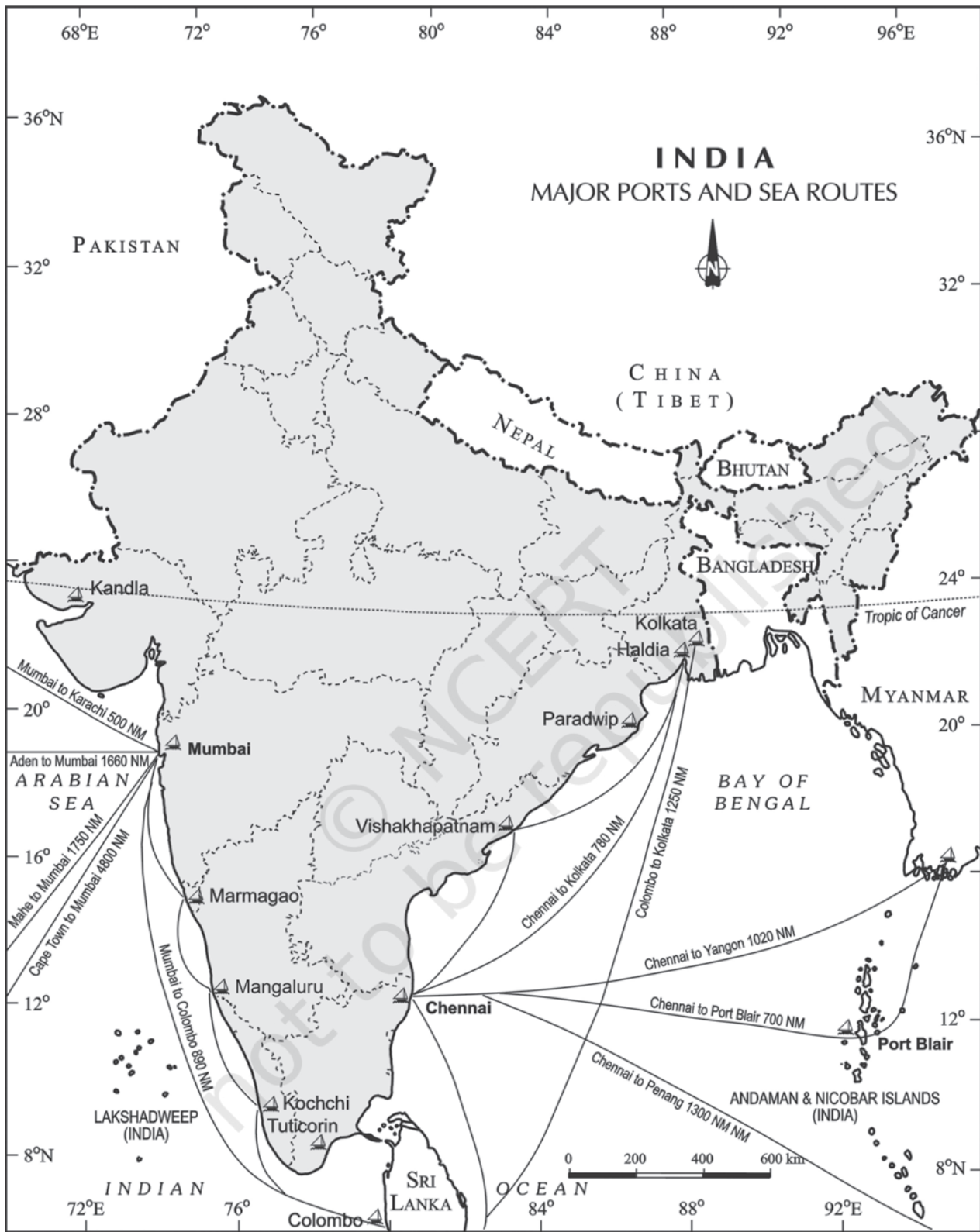
Fig. 8.4 : India – Major Ports and Sea Routes