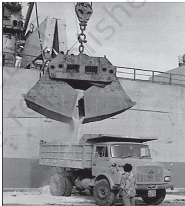
Fig. 8.3 : Unloading of goods on port

India is surrounded by sea from three sides and is bestowed with a long coastline. Water provides a smooth surface for very cheap transport provided there is no turbulence. India