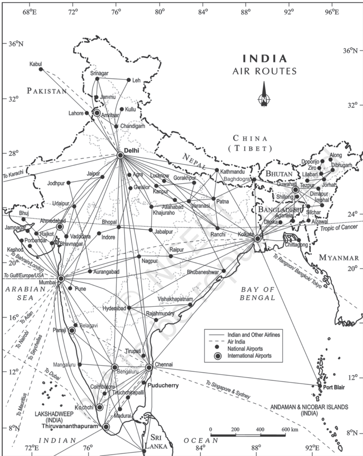
Fig. 8.5 : India - Air Routes