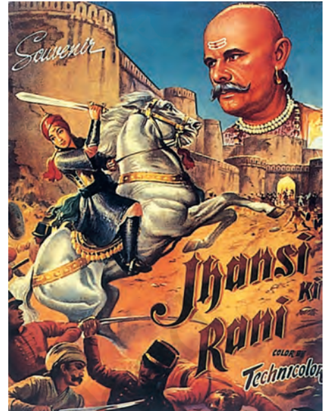
Fig. 10.18 Films and posters have helped create the image of Rani Lakshmi Bai as a masculine warrior

These images did not only reflect the emotions and feelings of the times in which they were produced. They also shaped sensibilities. Fed by the images that circulated in Britain, the public sanctioned the most brutal forms of repression of the rebels. On the other hand, nationalist imageries of the revolt helped shape the nationalist imagination.