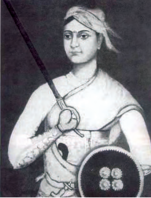
Fig. 10.3 Rani Lakshmi Bai, a popular image