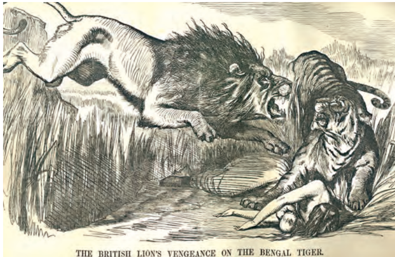
Fig. 10.14 The caption at the bottom reads “The British Lion’s Vengeance on the Bengal Tiger”, Punch , 1857.

➔ What idea is the picture projecting? What is being expressed through the images of the lion and the tiger? What do the figures of the woman and the child depict?