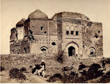
Fig. 10.8 A mosque on the Delhi Ridge, photograph by Felice Beato, 1857-58 After 1857, British photographers recorded innumerable images of desolation and ruin.

attempts to recover Delhi began in earnest in early June 1857 but it was only in late September that the city was finally captured. The fighting and losses on both sides were heavy. One reason for this was the fact that rebels from all over North India had come to Delhi to defend the capital.