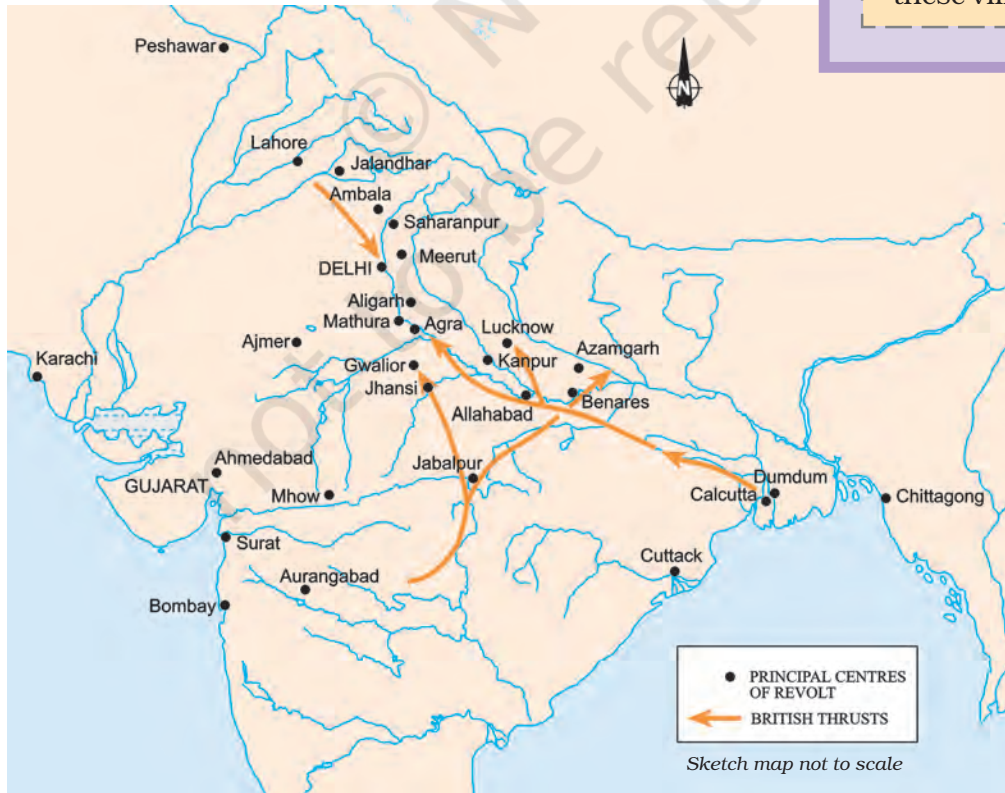
Map 2 The map shows the important centres of revolt and the lines of British attack against the rebels.

➤ What, according to this account, were the problems faced by the British in dealing with these villagers?