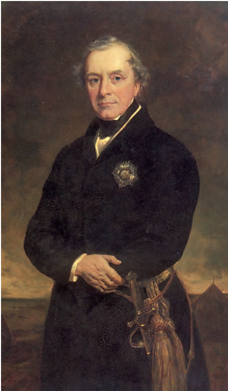
Fig. 10.5 Henry Hardinge, by Francis Grant, 1849

As Governor General, Hardinge attempted to modernise the equipment of the army. The Enfield rifles that were introduced initially used the greased cartridges the sepoy rebels rebelled against.