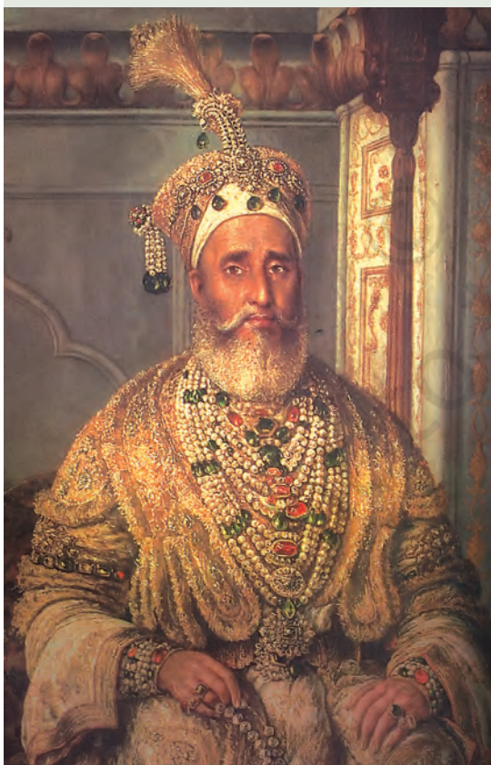
Fig. 10.1 Portrait of Bahadur Shah

Late in the afternoon of 10 May 1857, the sepoys in the cantonment of Meerut broke out in mutiny. It began in the lines of the native infantry, spread very swiftly to the cavalry and then to the city. The ordinary people of the town and surrounding villages joined the sepoys. The sepoys captured the bell of arms where the arms and ammunition were kept and proceeded to attack white people, and to ransack and burn their bungalows and property. Government buildings – the record office, jail, court, post office, treasury, etc. – were destroyed and plundered. The telegraph line to Delhi was cut. As darkness descended, a group of sepoys rode off towards Delhi.