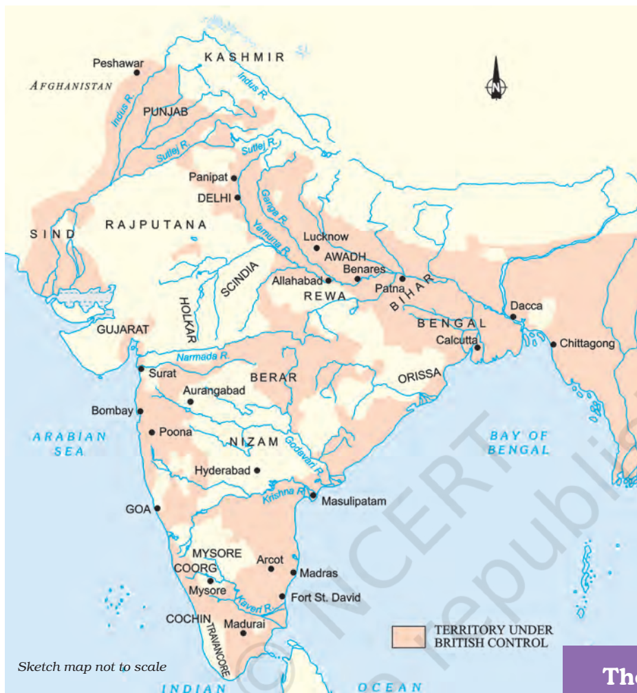
Map 1 Territories under British control in 1857