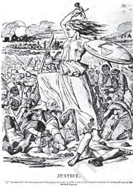
Fig. 10.13 Justice , Punch, 12 September 1857 The caption at the bottom reads “The news of the terrible massacre at Cawnpore (Kanpur) produced an outburst of fiery indignation and wild desire for revenge throughout the whole of England.”

In another set of sketches and paintings we see women in a different light. They appear heroic, defending themselves against the attack of rebels. Miss Wheeler in Figure 10.12 stands firmly at the centre, defending her honour, single-handedly killing the attacking rebels. As in all such British representations, the rebels are demonised. Here, four burly males with swords and guns are shown attacking a woman. The woman's struggle to save her honour and her life, in fact, is represented as having a deeper religious connotation: it is a battle to save the honour of Christianity. The book lying on the floor is the Bible.