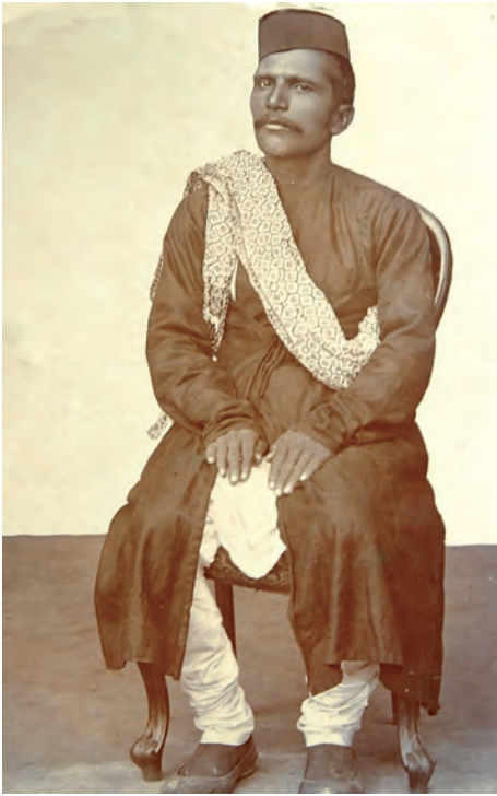
Fig. 10.6 A zamindar from Awadh, 1880

and issues, traditions and loyalties worked themselves out in the revolt of 1857. In Awadh, more than anywhere else, the revolt became an expression of popular resistance to an alien order.