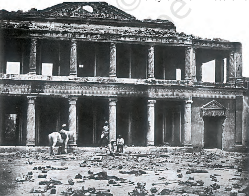
Fig. 10.9 Secundrah Bagh, Lucknow, photograph by Felice Beato, 1858

The British used military power on a gigantic scale. But this was not the only instrument they used. In large parts of present-day Uttar Pradesh, where big landholders and peasants had offered united resistance, the British tried to break up the unity by promising to give back to the big landholders their estates. Rebel landholders were dispossessed and the loyal rewarded. Many landholders died fighting the British or they escaped into Nepal where they died of illness or starvation.