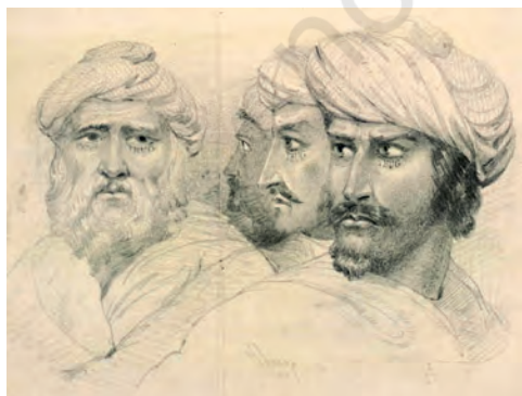
Fig. 10.19 Faces of rebels