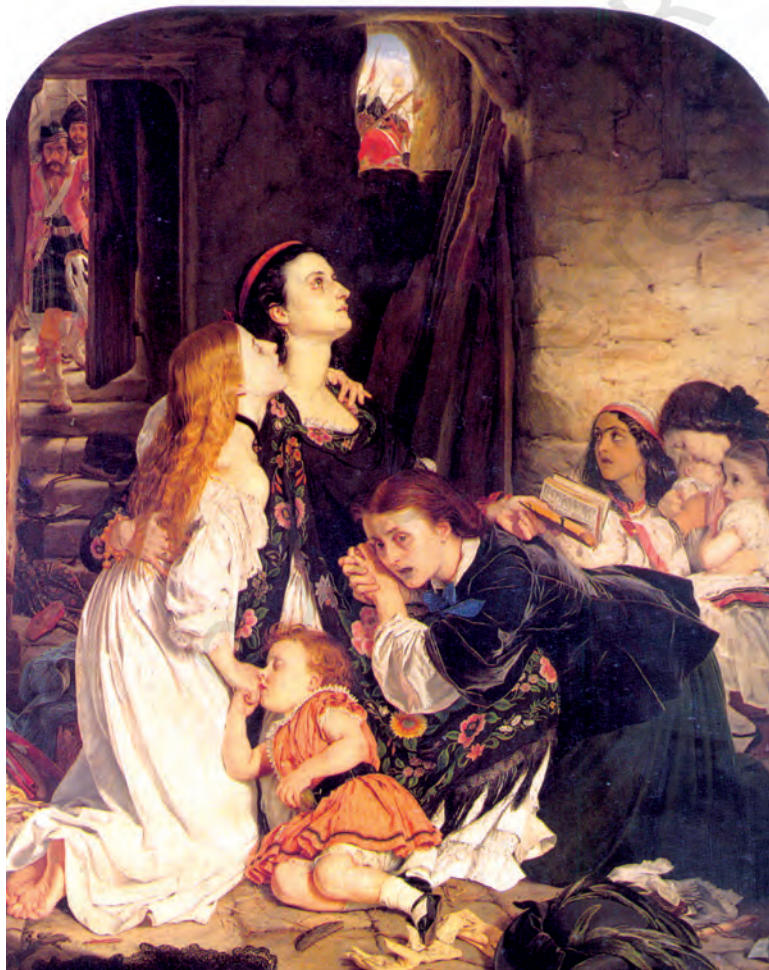
Fig. 10.11 “In Memoriam”, by Joseph Noel Paton, 1859

“In Memoriam” (Fig. 10.11) was painted by Joseph Noel Paton two years after the mutiny. You can see English women and children huddled in a circle, looking helpless and innocent, seemingly waiting for the inevitable – dishonour, violence and death. “In Memoriam” does not show gory violence; it only suggests it. It stirs up the spectator’s imagination, and seeks to provoke anger and fury. It represents the rebels as violent and brutish, even though they remain invisible in the picture. In the background you can see the British rescue forces arriving as saviours.