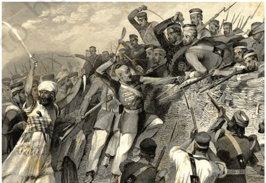
Fig. 10.2 Ordinary people join the sepoys in attacking the British in Lucknow.

Firangi , a term of Persian origin, possibly derived from Frank (from which France gets its name), is used in Urdu and Hindi, often in a derogatory sense, to designate foreigners.