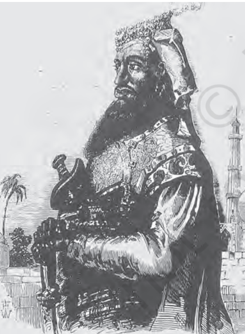
Fig. 10.4 Nana Sahib At the end of 1858, when the rebellion collapsed, Nana Sahib escaped to Nepal. The story of his escape added to the legend of Nana Sahib's courage and valour.