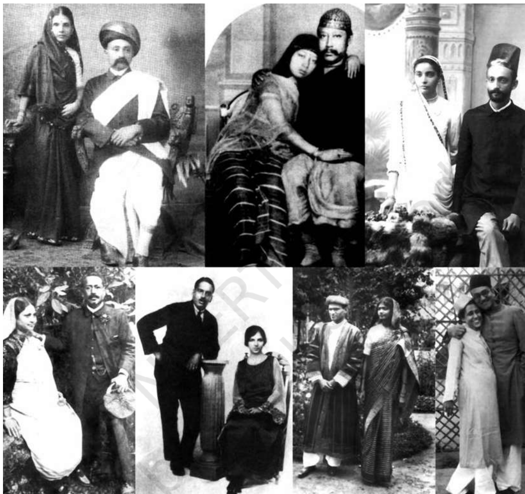
Couples from different regions 1880s to 1930s: Clockwise from top left corner: Gujarat; Tripura; Bombay; Aligarh; Hyderabad; Goa; Calcutta. From Malavika Karlekar, Visualising Indian Women 1875–1947, Oxford University Press, New Delhi.

Note: In this chapter, the word “State” has a capital S when it is used to denote the federal units within the Indian nation-state; the lower case ‘state’ is used for the broader conceptual category.