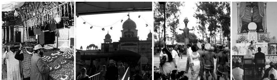
Different religious worship places

In everyday language, the word ' communalism ' refers to aggressive chauvinism based on religious identity. Chauvinism itself is an attitude that sees one's own group as the only legitimate or worthy group, with other groups being seen – by definition – as inferior, illegitimate and opposed. Thus, to simplify further, communalism is an aggressive political ideology linked to religion. This is a peculiarly Indian, or perhaps South Asian, meaning that is different from the sense of the ordinary English word. In the English language, "communal" means something related to a community or collectivity as different from an individual. The English meaning is neutral, whereas the South Asian meaning is strongly charged. The charge may be seen as positive – if one is sympathetic to communalism – or negative, if one is opposed to it.