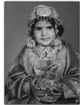
A Kashmiri girl

To be effective, the ideas of inclusive nationalism had to be built into the Constitution. For, as already discussed (in section 6.1), there is a very strong tendency for the dominant group to assume that their culture, language or religion is synonymous with the nation state. However, for a strong and democratic nation, special constitutional provisions are required to ensure the rights of all groups and those of minority groups in particular. A brief discussion on the definition of minorities will enable us to appreciate the importance of safeguarding minority rights for a strong, united and democratic nation.