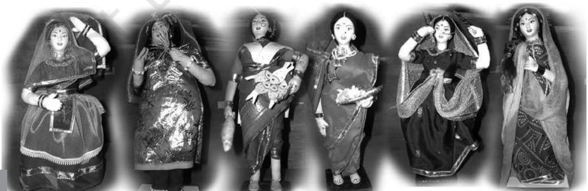
Left Margin: Food from different parts of India; Right top: Child dressed in Kashmiri Clothes; Bottom: Dolls dressed in costumes of different Indian States.

The notion of minority groups is widely used in sociology and is more than a merely numerical distinction – it usually involves some sense of relative disadvantage. Thus, privileged minorities such as extremely wealthy people are not usually referred to as minorities; if they are, the term is qualified in some way, as in the phrase ‘privileged minority’. When minority is used without qualification, it generally implies a relatively small but also disadvantaged group. The sociological sense of minority also implies that the members of the minority form a collectivity – that is, they have a strong sense of group solidarity, a feeling of togetherness and belonging. This is linked to disadvantage because the experience of being subjected to prejudice and discrimination usually heightens feelings of intra-group loyalty and interests (Giddens 2001:248). Thus, groups that may be minorities in a statistical sense, such as people who are left-handed or people born on 29 th February, are not minorities in the sociological sense because they do not form a collectivity.